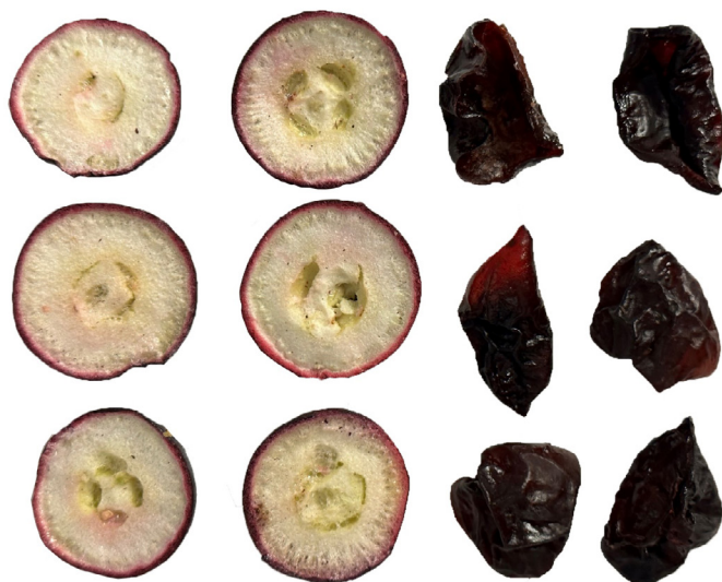
Figure 7. Differences in appearance between freeze-dried (left) and oven-dried (right) muscadine fruit halves.