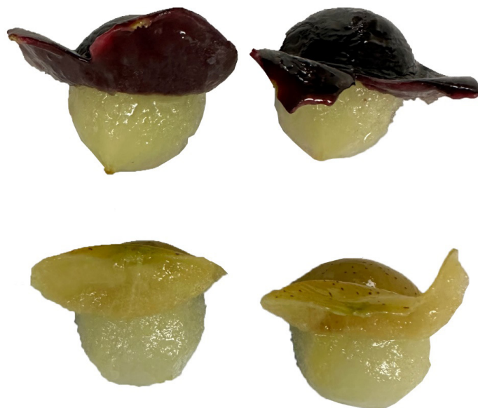
Figure 4. Semi-peeled muscadine grapes showing the thick peel: 'Paulk' (top); 'GA-13-4-2' (bottom).

Regardless of its nutritional benefits, the peel can be difficult to chew and swallow—a fact people often cited as the reason why they do not consume the peel, discarding it instead (Figure 4). The peel's thickness also makes it difficult to extract the juice; and muscadines are primarily used in juices. The seeds within the fruit are tough, difficult to chew, and very bitter, further discouraging peel consumption. Starting educational and promotional programs