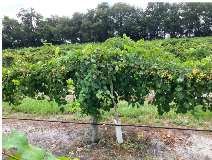
Figure 1. Muscadine vines at the time of harvest in late summer.

Muscadine grape ( Muscadinia rotundifolia [Michx.]) is a fruit crop native to America; it was the first grape species cultivated in the country. Muscadine grapes (Figure 1) adapt well to a wide range of biotic and abiotic stresses and have thus been grown and vinified throughout the southeastern US for centuries. Currently, southeastern farmers grow approximately 5,000 acres of almost 100 improved muscadine-grape varieties for commercial use. Muscadine grapes are commonly consumed fresh or processed into juice, wine, or jam. Recent research demonstrated the fruit's significant contribution of beneficial phytochemicals to the typical American diet; and thereafter, the demand for muscadine grapes considerably increased. Many consumers now consider muscadine grapes a favorable, healthy food due to their unique blend of bioactive compounds and antioxidant properties. Its thick peels and seeds, though, have prevented wider public consumption. This publication aims to introduce growers, Extension agents/specialists, and the general public to the potential for a new, value-added product that makes muscadine grapes much easier to eat and may diversify the food processing industry.