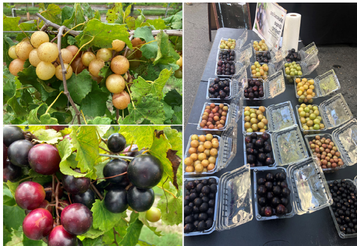
Figure 2. Muscadine grapes on vines (left) and varieties on display in clamshell containers (right).

muscadine peel is a rich source of antioxidants, dietary fiber, flavonoids, and other beneficial phytochemicals including high levels of resveratrol, a polyphenolic compound reported to have antioxidant and anti-inflammatory properties. The fruit's other beneficial compounds include anthocyanins and ellagic acid. Although the anatomy of muscadine grapes is like that of other grape types, its fruit are typically larger, with thicker peels and larger seeds.