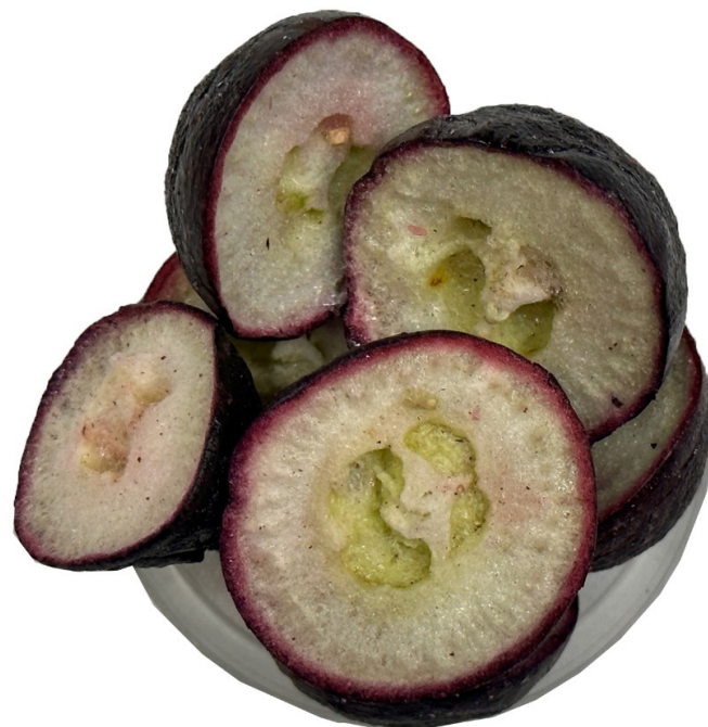
Figure 8. Freeze-dried 'Paulk' muscadine.