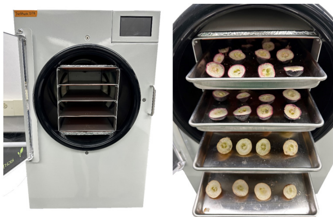
Figure 5. A small-scale freeze-dryer (left) and halved muscadines following drying (right).

Several steps are involved in the freeze-drying process for muscadine fruit (Figure 6):