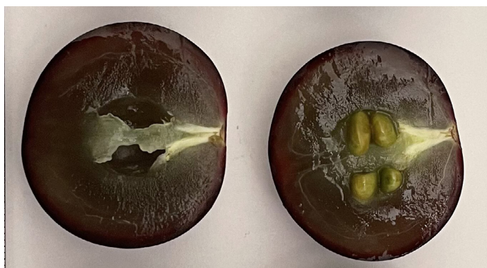
Figure 3. Anatomy of both halves of 'Supreme' muscadine fruit.