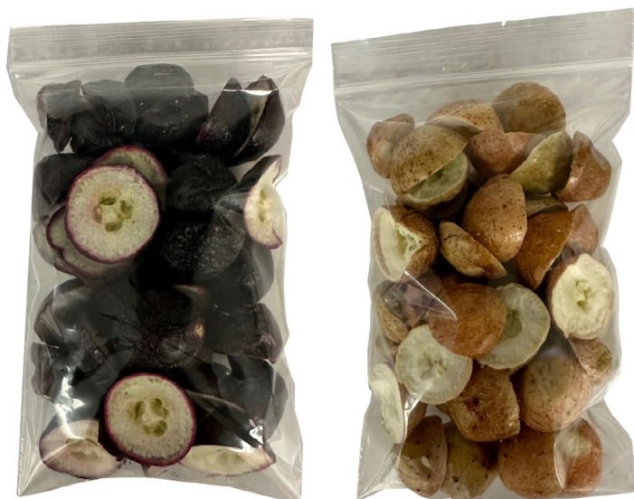
Figure 9. Freeze-dried muscadine fruit halves packed in sealed bags for storage. 'Paulk' (left) and 'GA-13-4-2' (right).