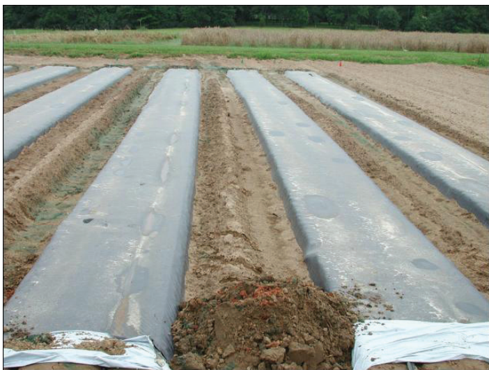
Figure 4. Water redistribution in the presence of an impermeable layer. In Quincy, FL on an Orangeburg loamy sand, dye appeared in the alleys (a). In Hendry county, the wetted zone has an omega shape when the water front reaches the impermeable layer (b).