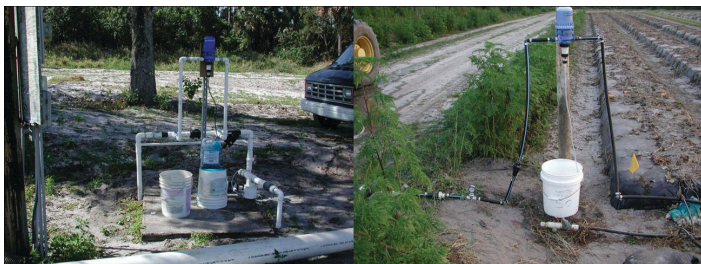
Figure 1. Example of injection loops using a Dosatron (left) or a Mazzi injector (right).

For practical purposes, the dye field will be divided into beds (where different drip tapes will be used). Each bed will also be divided into sections corresponding to each of the irrigation times selected (Figure 1). Dye selection (step 5, Table 1) is a critical step. Since the interpretation of the dye test assumes that the dye moves with the water front, selected dye should be totally soluble and not adsorbed by soil particles or soil organic matter. On the day of the dye test (steps 8 to 12, Table 1), consider starting early so that the entire test may be conducted during the same day. Once the system is operating, inject the dye and tie the drip tapes at the pre-determined times. Dye may be injected with a Dosatron or Mazzi injector. The shortest irrigation times will be located away from the water source, and increasingly longer irrigation times will be closer to the water source (Figure 2).