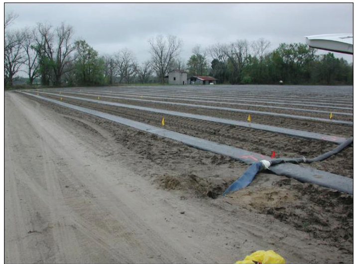
Figure 2. Example of possible layout for a dye test.

Pressure monitoring during the dye test is important, especially each time a section is tied off. As time progresses, the length of the remaining drip tape is shortened in the irrigation system, which may result in increased pressure and water flow. Volumes delivered by the drip system should be monitored according to operating time and/or with the water meter (Table 2). Pressure and water flow should be kept as constant as possible during the entire test to ensure that operating conditions match those recommended by manufacturers.