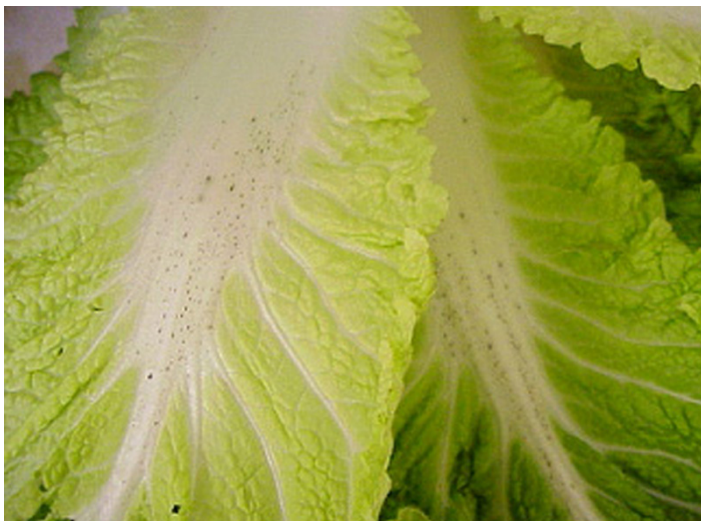
Figure 2. “Pepper spot” on the leaf midrib of Napa cabbage.

The first symptoms of pepper spots are small, dark circular or elongated spots that first appear on the white midribs of the outer leaves and then spread to the middle inner leaves (Figure 2). Spots develop on both outer and inner surfaces of leaves. Initial darkening occurs at the juncture of two or more epidermal cells, spreading to include 20 or more cells that collapse to form the typical pepper spot lesion (Figure 3). Spots are similar in size to sesame seeds, and are about 1 to 2 mm in diameter. Midribs look as if ground black pepper was sprinkled on them, hence the name “pepper spot.” This type of symptom would fall under section “51.459 damage” of the United States standard for grades of cabbage. It states that “damage” means any injury or defect that materially affects the appearance or the edible or shipping quality of cabbage (USDA 2016). Symptoms can occur in the field during growth, or they may develop during cold storage. Symptoms have also been observed on transplants (Figure 4).