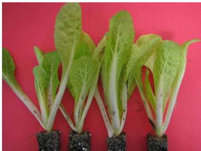
Figure 4. “Pepper spot” on Napa cabbage transplants.