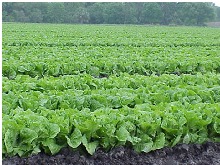
Figure 1. Field of Napa cabbage in Florida.

Napa cabbage is an annual plant that grows 10 to 20 inches tall and 6 to 8 inches in diameter (Figure 1). The Napa cabbage head is not round like that of a regular green cabbage, but elongated like a romaine lettuce head, although lettuce belongs to the daisy family, Asteraceae (this EDIS pub has information about the daisy family for lettuce, http://edis.ifas.ufl.edu/hs1276 , Liu et al. 2016). The outer leaves are closely wrapped, usually over the top, to make a dense heart of paler green or yellowish leaves. As its heart is typically yellowish, this crop is also called wong bok, meaning yellow cabbage. All leaves have a broad central midrib.