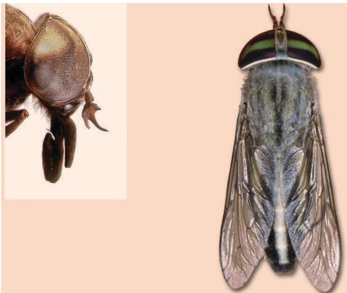
Figure 4. Horse fly.

Horse flies (Figure 4) and deer flies (Figure 5) are closely related insects with similar life cycles. Both pests are strong fliers and only the adult female bites. They are daytime feeders that use large piercing mouthparts to lacerate host skin for a blood meal. While feeding, an anticoagulant is injected into the wound, increasing blood flow. These wounds can often serve as sites for secondary infections and many people are allergic to the feeding activities of these pests. In addition, horse flies and deer flies are important agents of disease transmission due to their intermittent feeding activity.