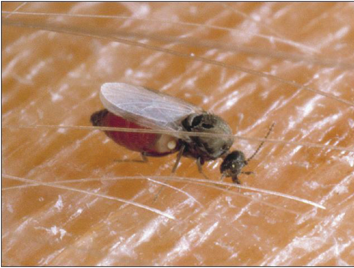
Figure 1. No-see'um ( Culicoides ).