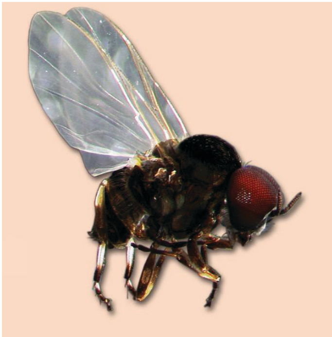
Figure 2. Black fly on man.

Black flies (Simuliidae) (Figure 2) are small, dark, stout-bodied insects with a hump-backed appearance. Adult females are not host specific and feed on blood primarily during daylight hours. It hovers about the eyes, ears, and nostrils of man and animals, often alighting and puncturing the skin causing severe irritation. However, black flies are not considered major pests of homeowners in Florida.