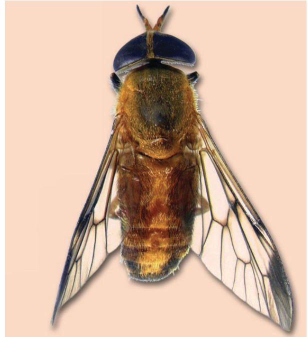
Figure 5. Deer fly.

weeks, concluding with adult emergence. The life cycle of horse flies and deer flies varies considerably depending on species, requiring anywhere from 70 days to two years.