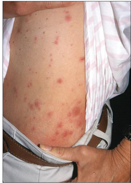
Figure 2. Chigger bites.

Chiggers prefer to attach on parts of the body where clothing fits tightly or where the flesh is thin, tender, or wrinkled. For this reason, chiggers locate in such areas as the ankles, waistline, knees, or armpits.