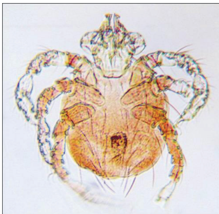
Figure 1. Chigger.

of the world, chiggers transmit scrub typhus; however, in Florida they are not known to transmit any human disease agent.