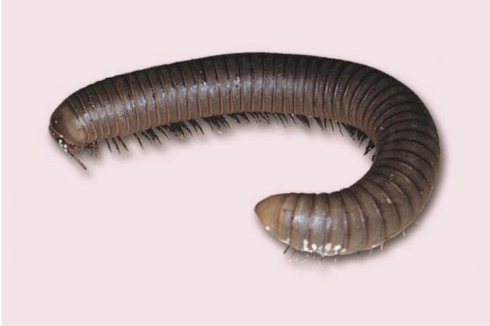
Figure 4. Millipede.

pests are generally more troublesome in wooded or newly developed areas, where decaying vegetation provides excellent food and breeding conditions.