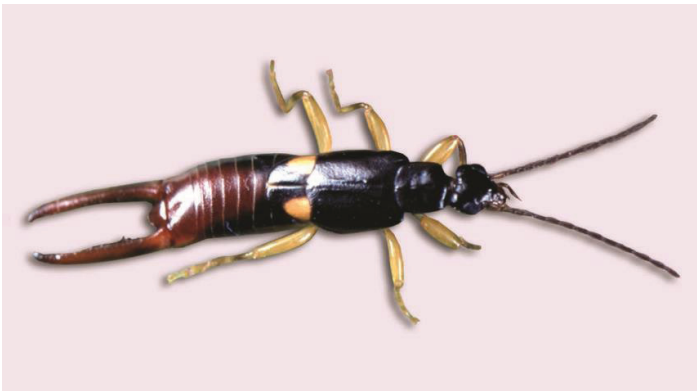
Figure 5. Earwig.

Earwigs (Figure 5) are elongated, beetle-like insects. They are short-winged and fast-moving and typically measure about ½ to 1 inch (1.2-2.5 cm) in length. They are usually dark brown and possess a pair of pincerlike appendages at the tip of the abdomen. They have chewing-type mouth-parts and slow development.