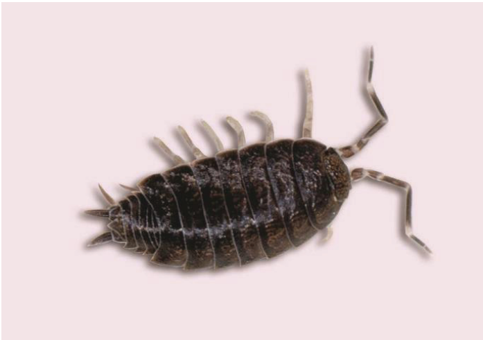
Figure 2. Sowbug.

Pillbugs, or “rolly-pollies,” lack tail-like appendages and can roll into a tight ball, from which the name “rolly-pollies” is derived. Sowbugs, often called woodlice, possess two tail-like appendages, seven pairs of legs, and well developed eyes. They are incapable of rolling into a tight ball.