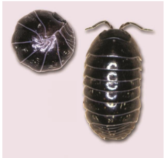
Figure 1. Pillbug.

habitats. They are wingless, oval or slightly elongated arthropods about ½ inch (13mm) in length and slate-gray, with body segments resembling armored plates. Both pillbugs and sowbugs feed primarily on decaying organic matter, although occasionally they may damage the roots of green plants. Although their typical habitat is outdoors, they occasionally wander indoors but they do not cause damage.