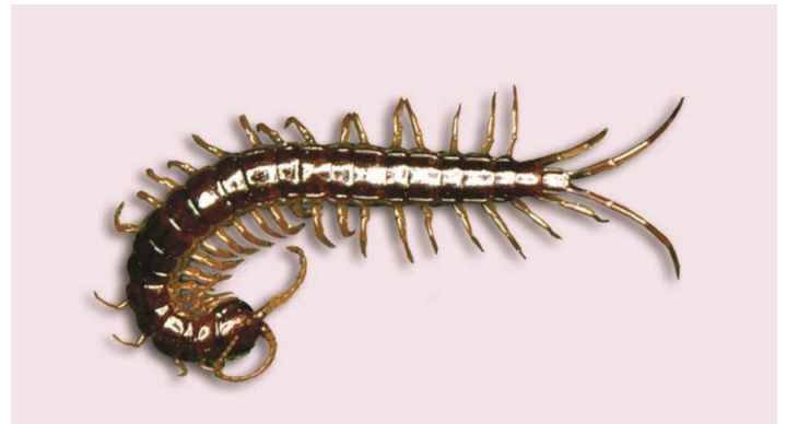
Figure 3. Centipede.

Centipedes (Figure 3) are many-legged animals (ranging from 10 to 100 depending on species) and belong to a group of animals called chilopods. They are usually brownish, flattened animals with many body segments, with most body segments having one pair of legs. Centipedes are fast runners and may vary in length from 1 to 6 inches (2.5 to 15 cm). They have one pair of antennae, or “feelers,” that are easily seen. Centipedes have poorly developed eyes and are most active at night. They are active predators feeding mainly on insects and spiders. All centipedes have venom glands to immobilize their prey, but the toxicity of the venom is not enough to be lethal to humans. The jaws of the smaller local species cannot penetrate human skin; however, the larger species may inflict painful bites.