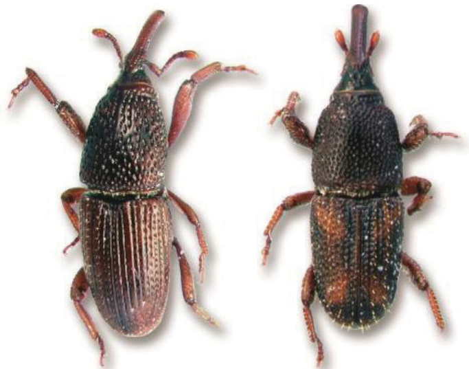
Figure 5. Granary weevil and rice weevil.