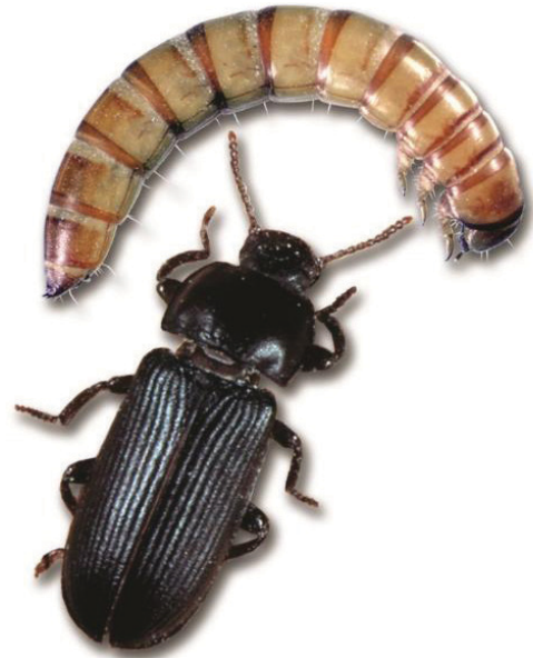
Figure 4. Mealworm larva and adult.