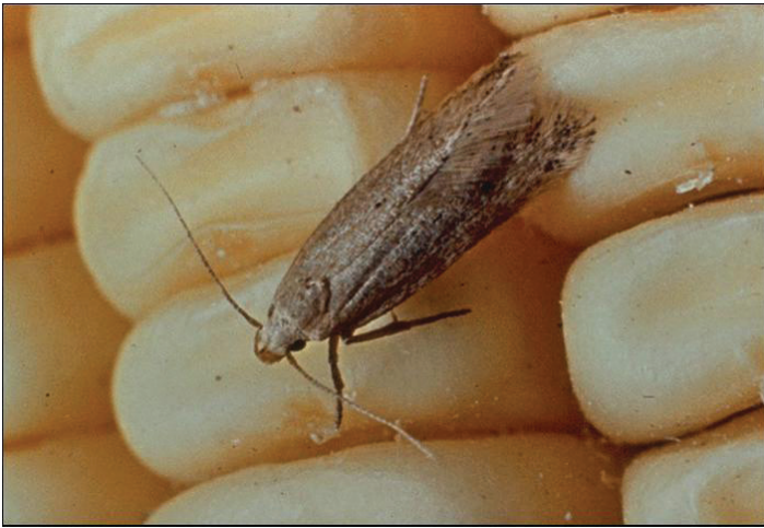
Figure 7. Angoumois grain moth.