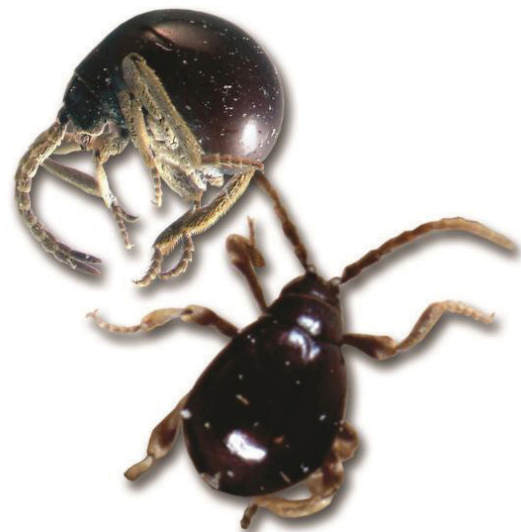
Figure 6. Spider weevil, side and dorsal views.