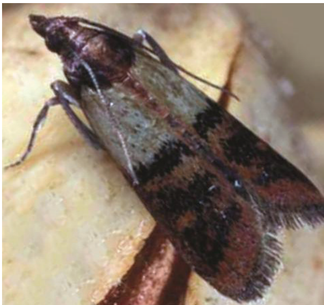
Figure 9. Indian meal moth, also known as flour moth.