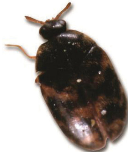
Figure 12. Warehouse beetle.