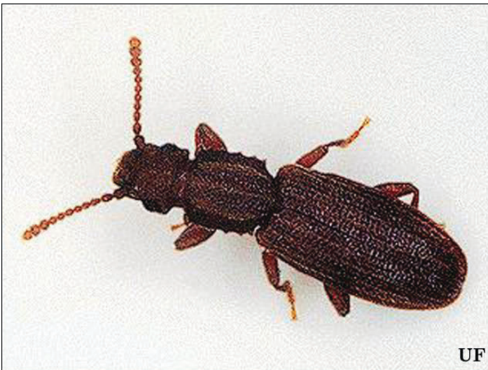
Figure 2. Sawtoothed grain beetle.