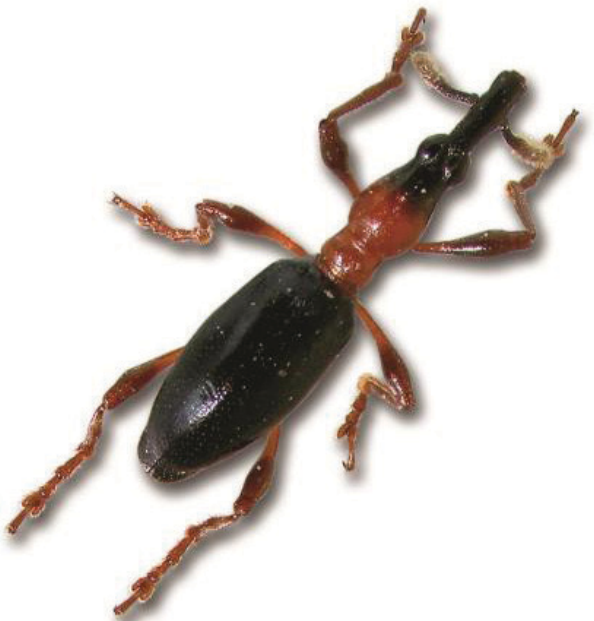
Figure 8. Sweet potato weevil.