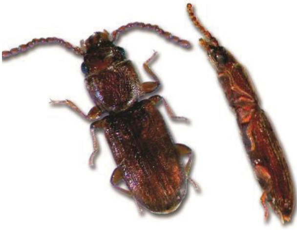
Figure 13. Flat grain beetle, dorsal and side views.