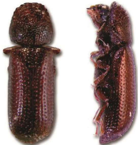
Figure 10. Lesser grain borer, dorsal and side views.