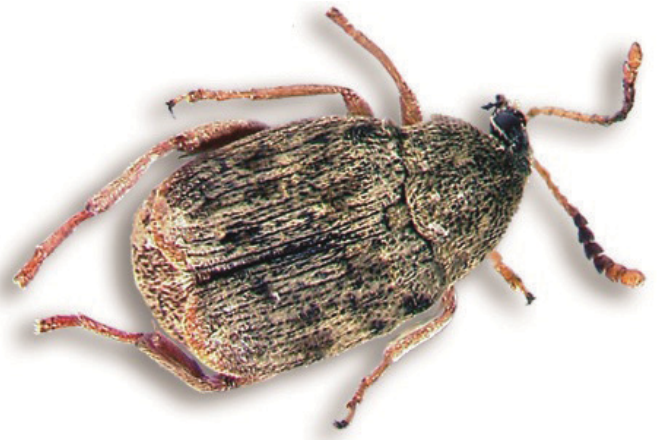
Figure 11. Bean weevil.