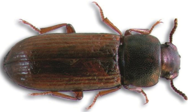
Figure 1. Flour beetle.

the pantry shelves. Moths and beetles are often attracted to lights or windows and may indicate an infestation. The presence of stored food pests is not an indication of uncleanliness, since infestation may be brought home in purchased food.