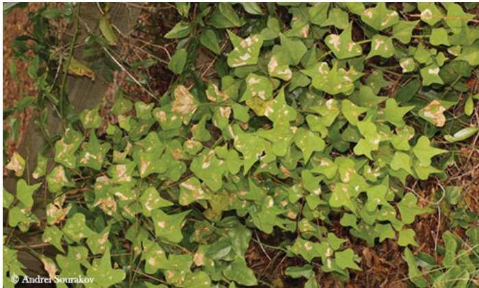
Figure 1. Damage to the coral bean plant ( Erythrina herbacea ) by erythrina leafminer ( Leucoptera erythrinella ).

The erythrina leafminer is a member of the genus Leucoptera , which are leaf borers that can cause severe damage to plant crops, such as coffee or apples. Even though these moths are ½ to ⅓ the size of an average moth, they can cause serious damage.