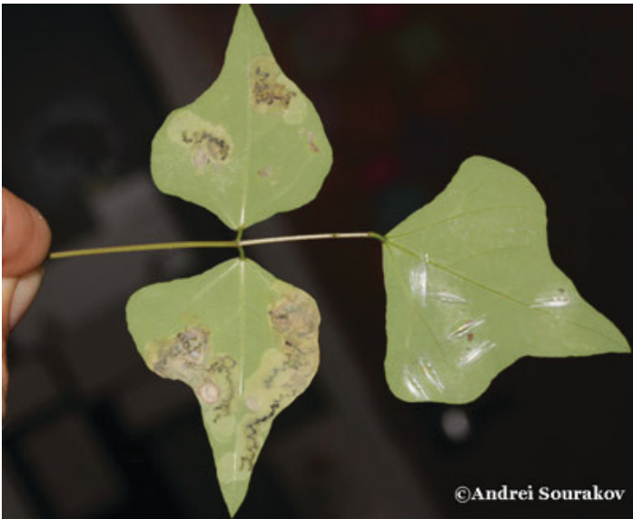
Figure 14. A leaf of the coral bean plant ( Erythrina herbacea ) infested by the erythrina leafminer ( Leucoptera erythrinella ). Credits: Andrei Sourakov, University of Florida