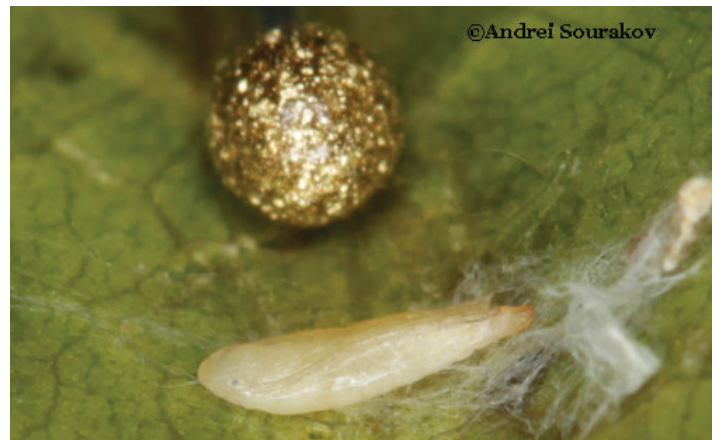
Figure 9. Pupa (removed from cocoon) of erythrina leafminer ( Leucoptera erythrinella ) next to a pin head.