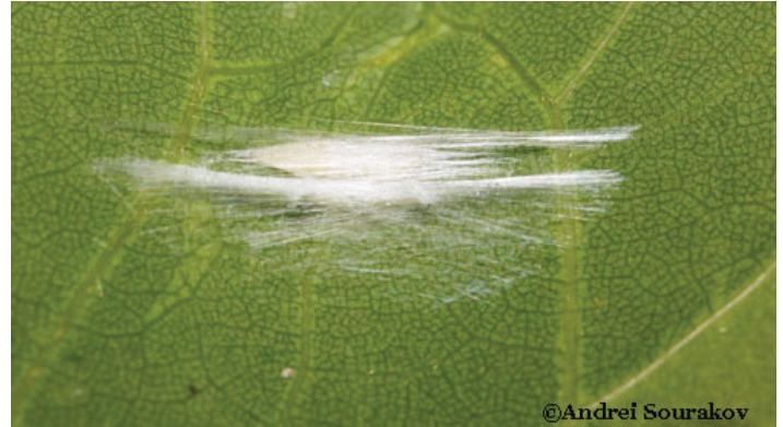
Figure 8. Cocoon of erythrina leafminer ( Leucoptera erythrinella ).

small marginal brown markings on their forewings and black valvae (sclerotized parts of genitalia). Both sexes have black eyes, which are hidden under an eye-cap made of white scales.