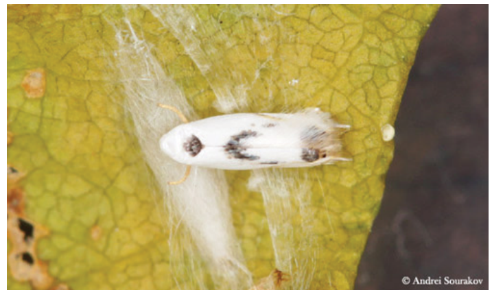
Figure 10. Freshly emerged female of erythrina leafminer ( Leucoptera erythrinella ).