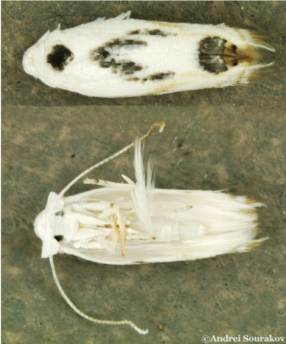
Figure 2. Upper and underside of erythrina leafminer ( Leucoptera erythrinella ) female.

on the leaf surface. The micropyle of the dome shaped egg is located dorsolaterally. The egg is covered with a reticulated hexagonal structure that can be observed using Scanning Electron Microscopy.