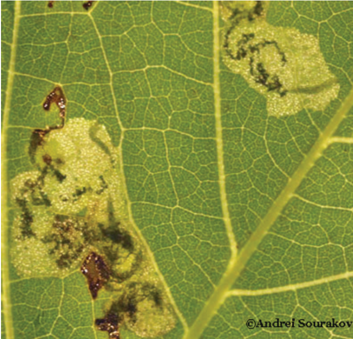
Figure 6. Mines of the erythrina leafminer ( Leucoptera erythrinella) in the leaf of the coral bean plant ( Erythrina herbacea).

Spinning cocoons takes a lot of energy and time, which you can see in this Leucoptera erythrinella cocoon spinning Time Lapse video depicting 2.5 hours in the life of two caterpillars of the Erythrina Leafminer, Leucoptera erythrinella .