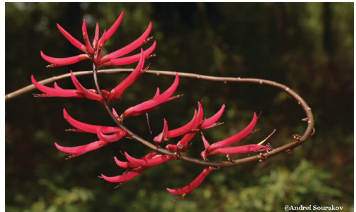
Figure 12. An inflorescence of the coral bean plant ( Erythrina herbacea ).

The moth's host plants in the genus Erythrina are favored as ornamentals for their beautiful flowers. They also have medicinal uses, which vary depending on local traditions. The damage that moths inflict may affect marketability of the plant stock at nurseries.