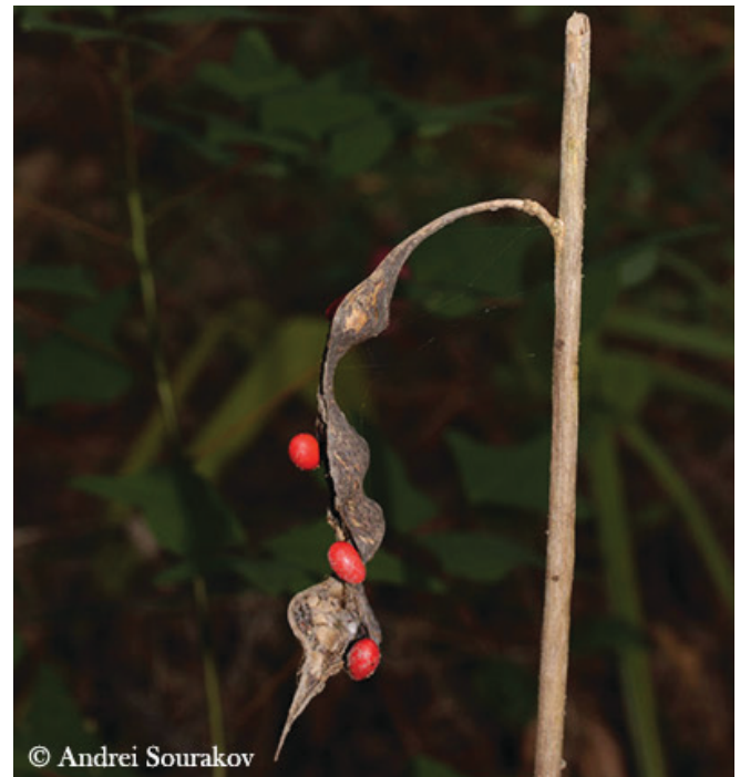
Figure 13. Dry seeds of the coral bean plant ( Erythrina herbacea ).