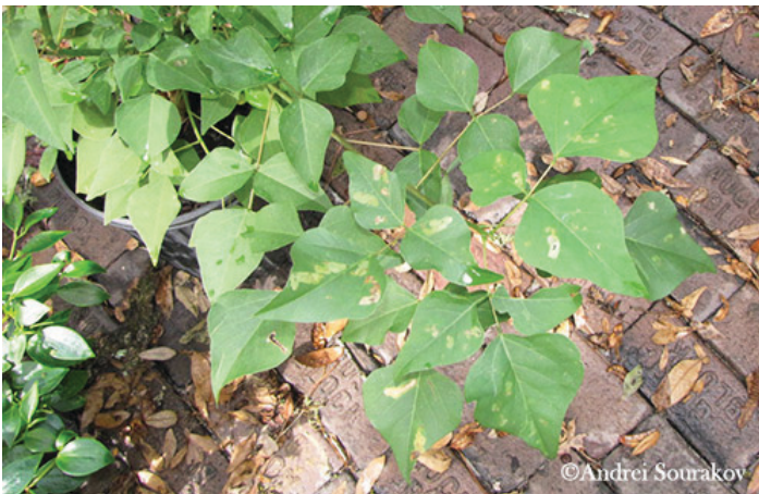
Figure 15. A hybrid between cockspear coral tree ( Erythrina crista-galli ) and coral bean ( Erythrina herbacea ) purchased from a nursery and infested by the erythrina leafminer ( Leucoptera erythrinella ) in north Florida.