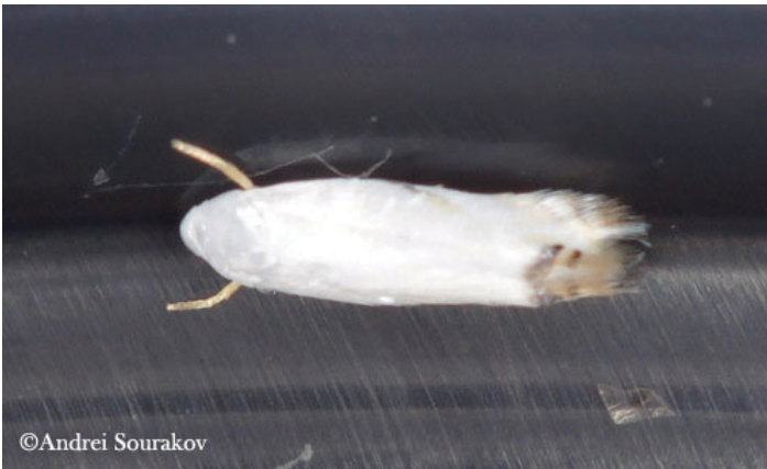
Figure 11. Male of erythrina leafminer ( Leucoptera erythrinella).