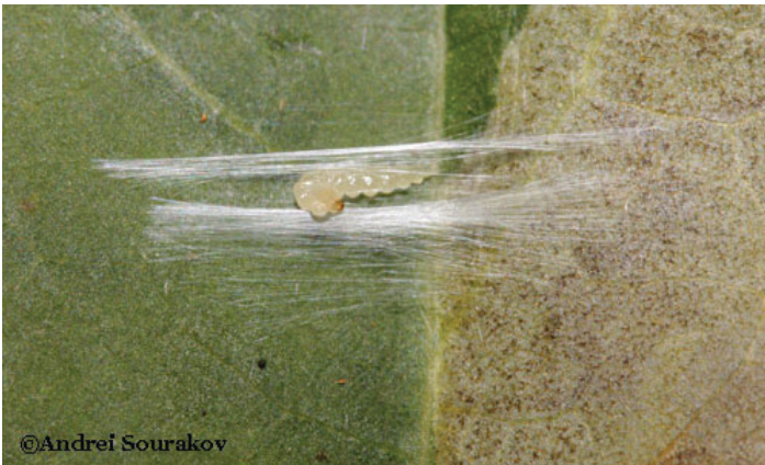
Figure 7. Larva of erythrina leafminer ( Leucoptera erythrinella) spinning a cocoon.