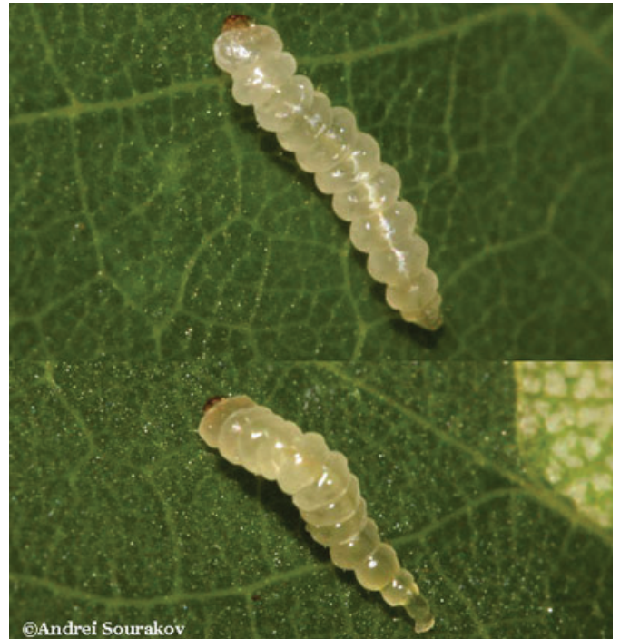
Figure 5. Motion of the mature larva of erythrina leafminer ( Leucoptera erythrinella ) emerged from the leaf of the coral bean plant ( Erythrina herbacea ) prior to pupation.

Credits: Andrei Sourakov, University of Florida, and Paul Skelley, Florida Department of Agriculture and Consumer Services, Division of Plant Industry