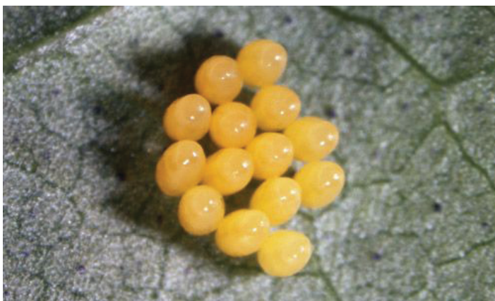
Figure 4. Eggs of Hippodamia convergens (1 day old).

Clusters of yellow eggs are laid by the adult female beetle in batches of 10–30 eggs on stems or leaves of plants where abundant insect prey is present. Individual eggs are spindle-shaped and 1–1.5 mm (~1/20th inch) long and laid pointing upwards.