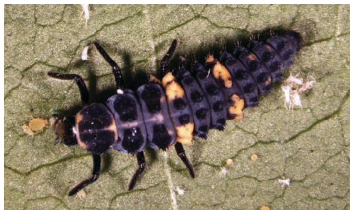
Figure 7. Third instar larvae of Hippodamia convergens .