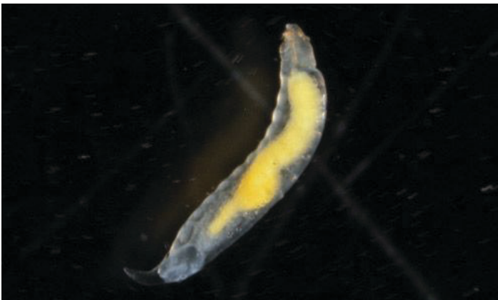
Figure 12. Larva of a parasitic wasp (probably Dinocampus coccinellae ) recovered from Hippodamia convergens .

Generalist predators such as large big-eyed bugs, Geocoris bullatus (Say), and damsel bugs, Nabis alternatus (Parshley), are reported as natural enemies of convergent lady beetle eggs. The braconid wasp Dinocampus (= Perilitus ) coccinellae (Schrank) has been found parasitizing convergent lady beetles (Figure 12). Some microsporidian diseases (primitive fungi) have also been recovered from field-collected specimens. The microsporidian Nosema hippodamiae is thought to cause chronic and sublethal effects, such as reduced fecundity and survival of adults. Many birds are predators of ladybeetles as well. However, the red color with black spots on the elytra may play a role as warning coloration, and ladybeetles with spots, such as Hippodamia convergens , tend to be eaten less frequently than unspotted ones.