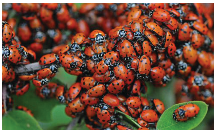
Figure 1. Mass of convergent lady beetles in Alamo Peak, Otero Co., NM.

other native species, may be displaced by the invasive Asian multicolored ladybeetle, Harmonia axyridis (Pallas).