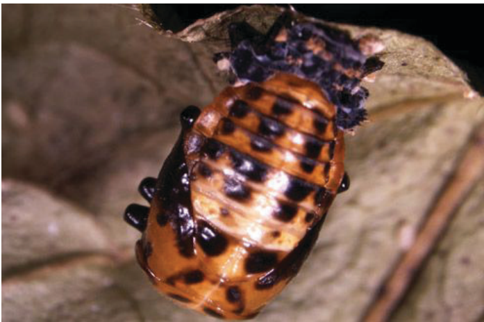
Figure 9. Pupa of Hippodamia convergens.