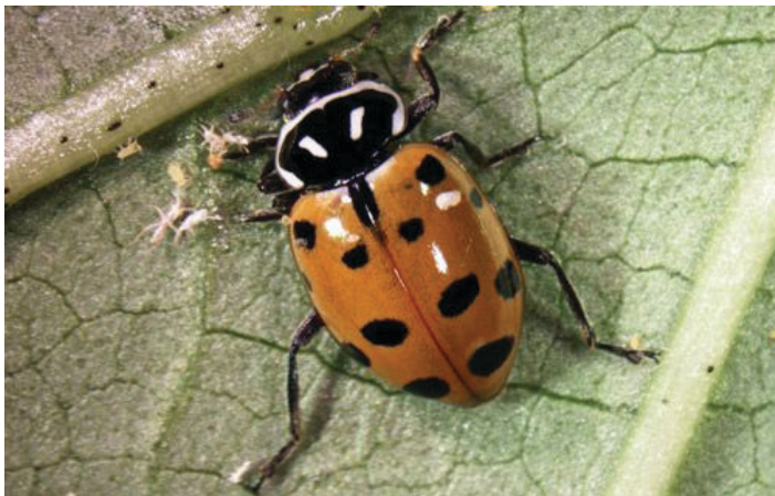
Figure 3. Newly emerged adult Hippodamia convergens showing typical body markings.

The adult is rounded and elongate-oval, averaging 7.8 mm (0.3 inch) long for females and 5.8 mm (0.23 inch) long for males. Adults are easily recognized by their bright red or orange elytra (hardened forewings), which usually have 12 black spots (6 on each elytron). The prothorax (area behind the head) is black with a white border and two white, converging lines, which give rise to the insect's common name. Marking on the elytra are variable, with some individuals less spotted or spotless, but the white lines that converge behind the head are common to all individuals. The legs, head, and underside are black. The legs are short with 3-segmented tarsi, and the antennae are short and clubbed.