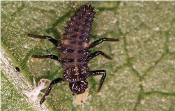
Figure 11. Hippodamia convergens second instar larvae feeding on melon aphid.

predator against the psyllid or other pests in citrus groves in Florida.