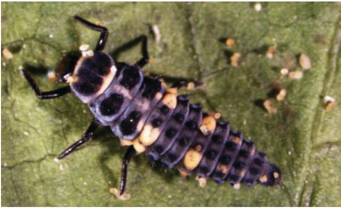
Figure 8. Fourth instar larvae of Hippodamia convergens.