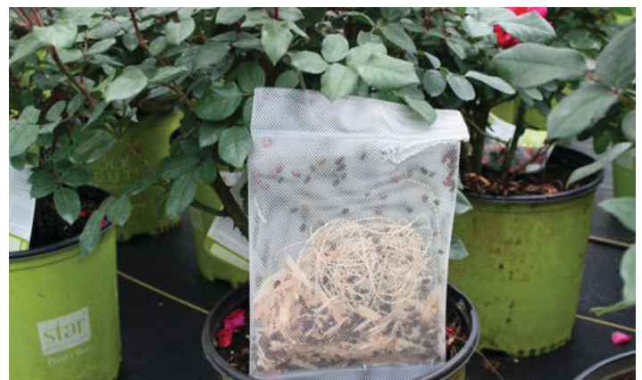
Figure 13. Release of Hippodamia convergens on rose plants.

The tradition of using this species as a form of natural pest control has continued, despite reports that field-collected beetles may harbor parasites and pathogens that may be inadvertently released along with the beetles. Moreover, since most wild-collected beetles overwinter while reproductively immature (ovaries are not yet developed) and have a natural tendency to disperse away from release sites, their effectiveness as biological control agents for gardeners and organic crops production is not guaranteed. The Association of Natural Biocontrol Producers does not endorse the collection of biocontrol organisms from their natural habitat destined for resale.