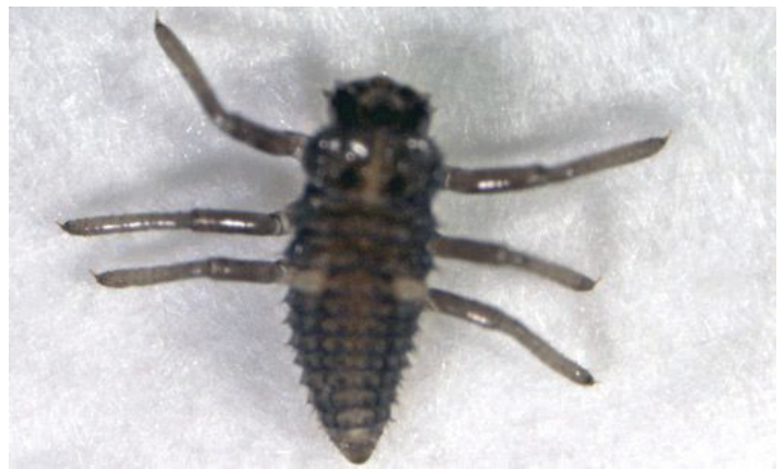
Figure 5. First instar larvae of Hippodamia convergens .

The larvae are black with orange spots on the prothorax and abdomen and look like small alligators. Larvae develop through four instars (stages), growing progressively larger and more spotted with orange and reaching about 7 mm ( \frac{1}{4} inch) before becoming a pupa. The pupa is hemispherical and orange and black.