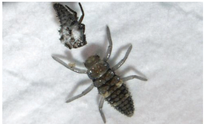
Figure 6. Second instar larvae of Hippodamia convergens .