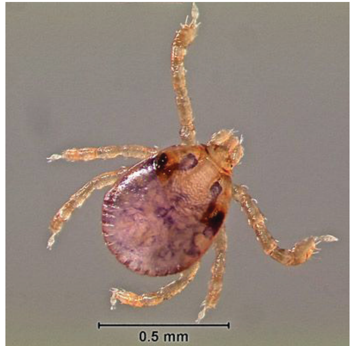
Figure 5. Gulf Coast tick, Amblyomma maculatum Koch, larva.

Nymphs (Figure 6) have eight legs and are approximately 1.33 by 0.75 mm ( \sim\frac{1}{16} by \frac{1}{32} in) (1 × w), unengorged, and can appear three times larger when engorged (Hooker et al. 1912). The cuticle is shiny and can range in color from dark bluish gray to dull white (Hooker et al. 1912). Nymphs are estimated to live up to seven months depending on environmental conditions (Teel et al. 2010).