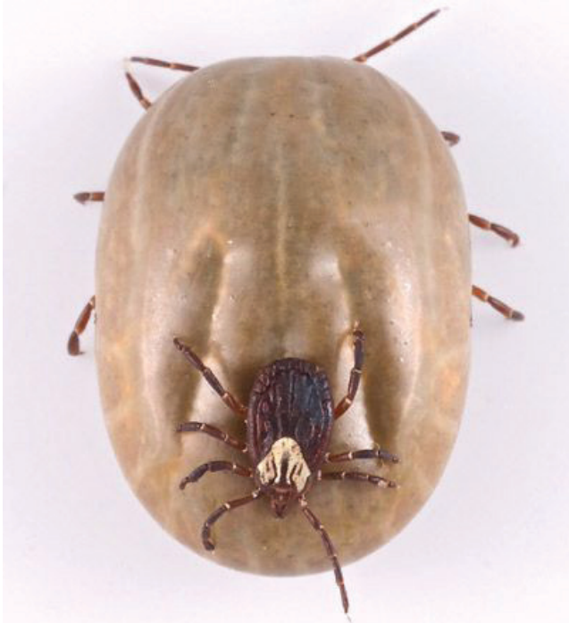
Figure 7. Relative size of an engorged, adult female Gulf Coast tick, Amblyomma maculatum Koch (bottom), compared to an unengorged female Gulf Coast tick (top).

as long as larvae under optimal laboratory conditions (Teel et al. 2010). Engorged ticks look strikingly different than unengorged ticks (Figure 7).