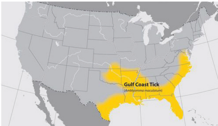
Figure 2. Distribution of the Gulf Coast tick, Amblyomma maculatum Koch, in the United States.