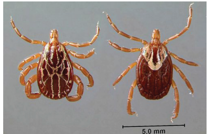
Figure 1. Adult male (left) and female (right) Gulf Coast ticks, Amblyomma maculatum Koch.

From the Catalogue of Life: 2010 Annual Checklist (ITIS 2014) and reviewed by Teel et al. (2010)