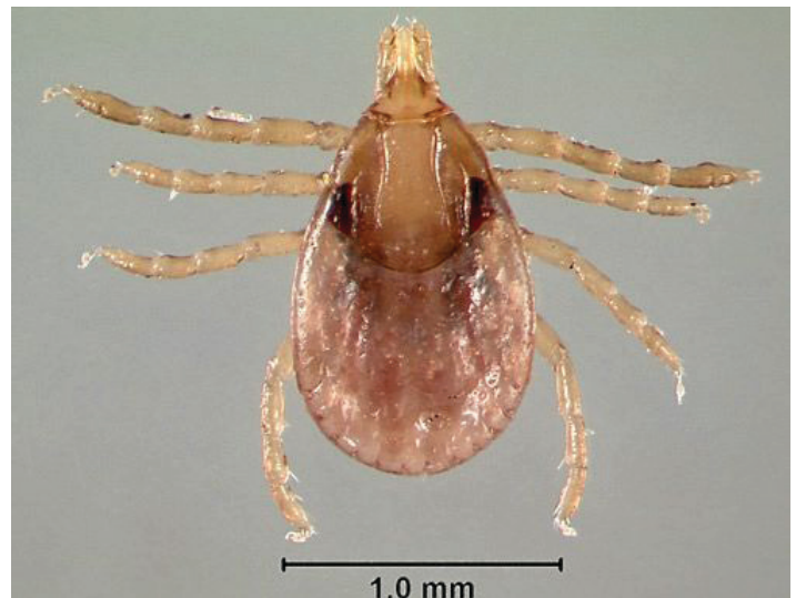
Figure 6. Gulf Coast tick nymph, Amblyomma maculatum Koch.