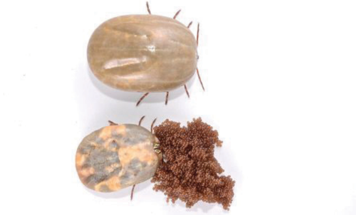
Figure 4. Female Gulf Coast ticks, Amblyomma maculatum Koch, fully engorged (top) and partially engorged with egg mass (bottom).

Eggs (Figure 4) are smooth brown, shiny ellipsoids with an average size of 0.520 by 0.397 mm (.020 by .016 in) (1 × w) (Hooker et al. 1912). Engorged females convert 52-69% of their body weight to producing eggs, resulting in approximately 10,000 eggs laid per clutch (Drummond and Whetstone 1970). The most eggs recorded from one engorged female Gulf Coast tick was 18,497 (Bishopp and Hixson 1936).