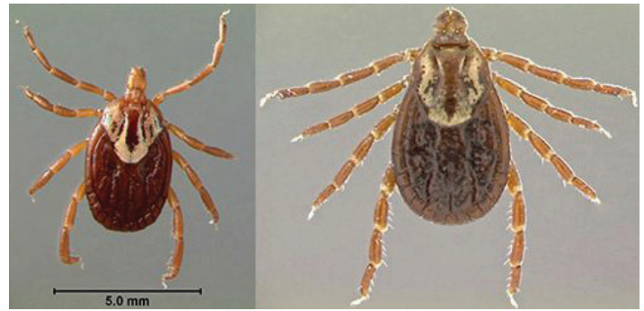
Figure 9. Dorsal view of an adult female Gulf Coast tick, Amblyomma maculatum Koch (left), and an American dog tick, Dermacentor variabilis (Say) (right).