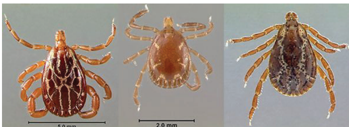
Figure 8. Dorsal views of a Gulf Coast tick, Amblyomma maculatum Koch (left); lone star tick, Amblyomma americanum (L.) (center); and American dog tick, Dermacentor variabilis (Say) (right), adult males.

In Florida, the ticks most likely confused with the male Gulf Coast tick are male lone star ticks and male American dog ticks (Figure 8). Female Gulf Coast ticks may be confused with female American dog ticks (Figure 9). The silvery ornamentation on male lone star ticks is restricted to six disassociated, symmetrical markings located on the lateral edges of the scutum, whereas Gulf Coast tick patterning is interconnected and covers most of the tick's dorsum. American dog ticks can be differentiated from Gulf Coast ticks by comparing the mouthparts. American dog tick mouthparts are short and pyramid-shaped in relation to the long, rectangular mouthparts of the Gulf Coast tick.