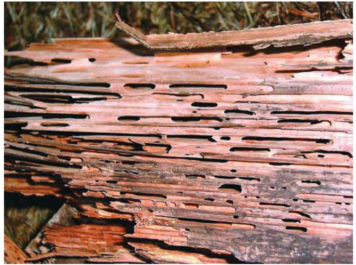
Figure 10. Carpenter ant damage to wood.

Cultural control practices entail using nonchemical materials to eliminate or exclude carpenter ants from infesting a structure. Repairing leaky pipes, caulking entry points, and removing damaged wood (Figure 10) are examples of cultural control practices. Eliminate “bridges” caused by trees and shrubs touching house exteriors. If wires or power cables are being used as bridges, it may be possible to have a professional treat the wires or areas where the wires attach to the structure. There are a number of “pest barrier” substances available that are sticky and can be used on tree trunks and other places to stop ants from passing. Using building materials designed to exclude carpenter ants in a structure is another example of a preventive strategy. Certain man-made lumbers have plastics incorporated into the product, making this lumber ideal for use in exterior structures such as decks. Insulation materials are also manufactured with impregnated borates and other compounds that repel or kill carpenter ants.