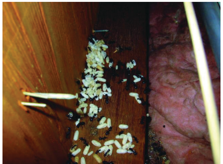
Figure 9. Carpenter ants in an attic space.