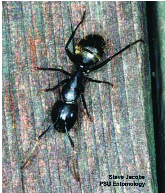
Figure 2. A black carpenter ant adult worker.

the structural integrity of their homes, which they sometimes have misidentified as caused by Florida carpenter ants. However, unlike the wood-damaging black carpenter ant, found in Florida's Panhandle, and a few other western US species, Florida carpenter ants seek either existing voids in which to nest or excavate only soft materials such as rotten or pithy wood and Styrofoam. The main nests for the black carpenter ant (Figure 2) are usually found outside, with satellite nests found indoors within voids or under insulation. Carpenter ants are primarily nocturnal in their foraging behavior. Carpenter ants do not sting but they do bite and can spray formic acid into the fresh wound if the ant is not removed quickly.