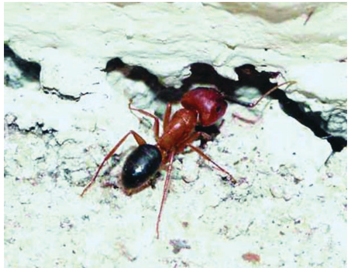
Figure 8. Worker of the Florida carpenter ant entering a void.

Observation of foragers entering voids is the best means of finding indoor nests (Figure 8). Watch for trailing ants at their peak nocturnal foraging hours and follow them. Look for areas of higher ant population density indicating closer proximity to the nest. The presence of ants and sawdust in crawlspaces and/or attics in a home also indicate an infestation (Figure 9). If alates emerge in a home during the winter or early spring, one can assume that there is an interior nest. If carpenter ant workers are found inside the home only in warm months, they may be scout ants from an outside nest. Nontoxic baits such as sugar milk, sugar water, honey, or dead insects placed along a foraging trail can cause other nestmates to be recruited to the area. Try to follow the foragers back to the nest and then treat the nest.