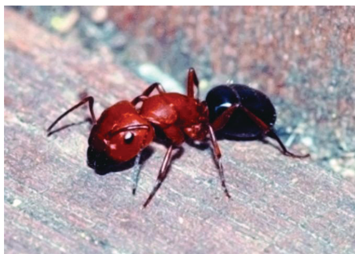
Figure 1. Adult carpenter ant major worker.

in the genus Camponotus are true carpenter ants because some nest in preformed cavities or in soil. Two carpenter ant species that are common around structures in the South are the Florida carpenter ant and the Tortugas carpenter ant. These bicolored arboreal ants are among the largest ants, making them apparent as they forage or fly indoors and out (Figure 1).