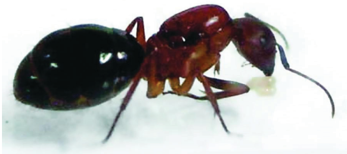
Figure 6. Florida carpenter ant dealate queen tending her brood.

Carpenter ants develop through complete metamorphosis, going through stages of the egg, larva, pupa, and adult worker or reproductive (alate). Carpenter ants create new colony sites when winged male and female reproductives emerge from a nest and depart for a mating flight. The mating flights of carpenter ants take place in the spring and are triggered by environmental factors such as photoperiod and changes in temperature. Winged reproductives fly in the evening or night during the rainy season (May through November). At the conclusion of a mating flight, the newly fertilized queen falls to the ground, breaks off her wings, and begins her search for a suitable nest site (Figure 6).