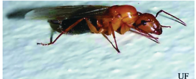
Figure 3. Female alate (reproductive) of the Florida carpenter ant.

largest caste, reaching up to 20 mm in length. Carpenter ants have no stinger, but workers can bite and spray formic acid for defense. The thorax is evenly convex; a key characteristic of carpenter ants. The thorax and head are ash brown to rusty-orange, and the gaster is black (Figure 3). Body hairs are abundant, long, and golden. Male reproductives are much smaller than queens with proportionally smaller heads and larger wings.