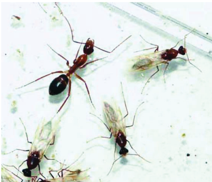
Figure 5. Worker and male reproductives of the Tortugas carpenter ant. Notice that the worker's head is longer than broad.