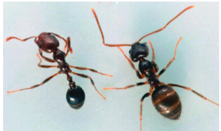
Figure 1. Tawny crazy ant worker ( Nylanderia fulva ) (right) in comparison to a small worker of the red imported fire ant (left).

Florida in the 1950s. The new species rapidly spread over most of Florida and several other Gulf Coast states. Large populations of these ants discovered in Texas in 2002 were classified as “ Paratrechina species near pubens ” because of minor morphological variations from P. pubens . However, through the use of genetic and morphological studies, it is now known that the pest ant that invaded the Gulf Coast states is really a species from central Brazil. It is known currently by the specific name Nylanderia fulva , or tawny crazy ant (Figure 1).