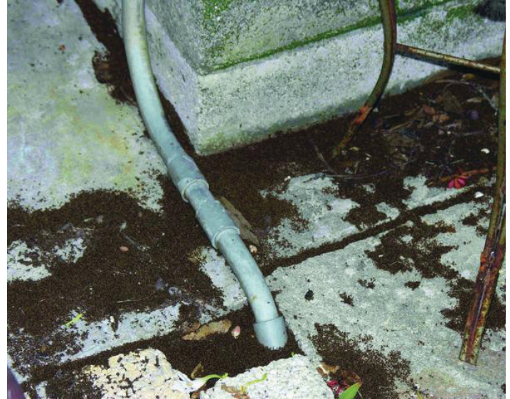
Figure 4. Brown piles of dead tawny crazy ants collect on paving stones outside a home. One colony of these ants may have several hundred thousand individuals.

and stored away from structures. To prevent ant entry into structures, landscape plants around the structure need to be cut back so no branches touch the structure. All cracks and crevices around the structure need to be sealed. Pesticide applications can be more effective if made earlier in the spring before the ant populations expand beyond their overwintering site into a permanent nest, and before the ant populations reach extreme levels. These early applications prevent rapid expansion of the ant population and its foraging territory.