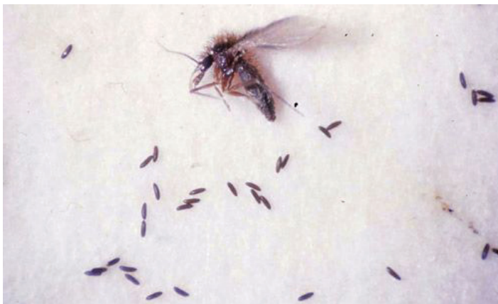
Figure 5. A female Lutzomyia longipalpis (Lutz and Neiva) and her eggs.

The developmental time of each Lutzomyia longipalpis generation is typically six to seven weeks, but a generation may be completed more quickly. Females require a blood meal to mature eggs. The time from blood meal to oviposition is five to nine days. Once eggs are laid, they require four to nine days to hatch. Larvae develop in nine to 24 days and the pupal stage lasts for approximately 10 days. Under laboratory conditions, most females die after oviposition in the first gonotrophic cycle (Killick-Kendrick et al. 1977; Luitgards-Moura et al. 2000) (Figure 5).