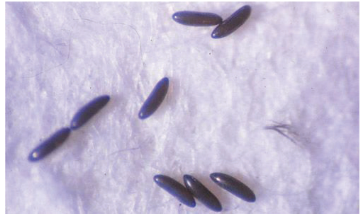
Figure 2. Eggs of Lutzomyia longipalpis (Lutz and Neiva), a sand fly.

and 0.42 mm (0.02 in) wide and the posterior part of the 9th abdominal segment is pigmented (Leite and Williams 1996) (Figure 3). Larvae feed on organic material in the soil (Ferro et al. 1997).