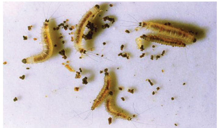
Figure 3. Fourth instar larvae of Lutzomyia longipalpis (Lutz and Neiva), a sand fly. Note the pigmentation of the posterior part of the 9th segment and the presence of two pairs of caudal setae.