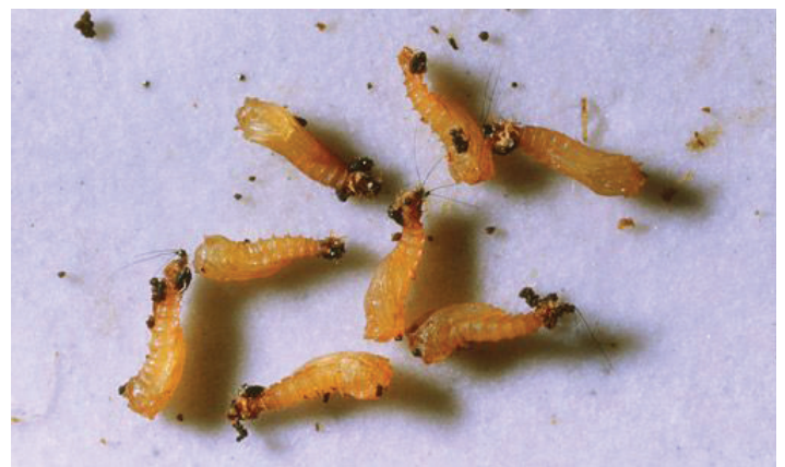
Figure 4. Newly formed Lutzomyia longipalpis (Lutz and Neiva) pupae.