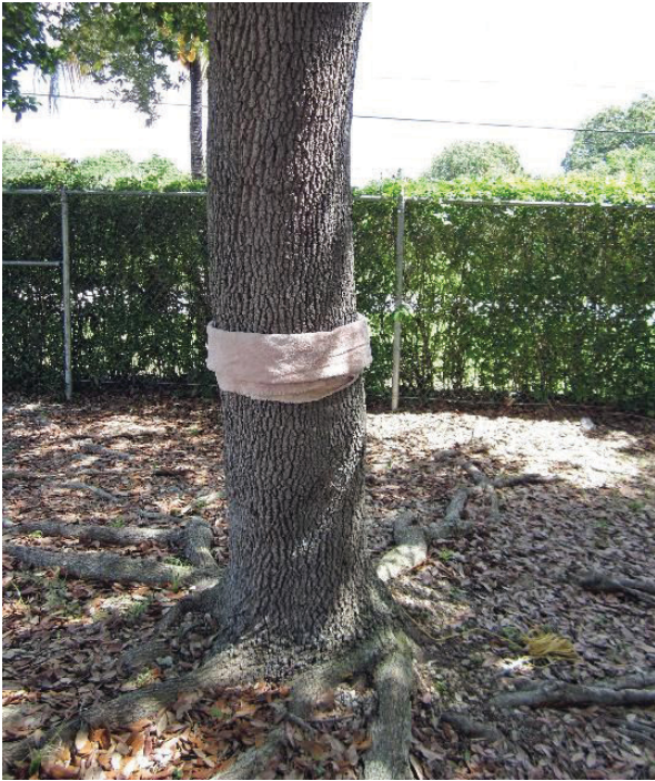
Figure 18. Tree band trap made with a towel fastened with string in a skirt can be used to collect tree-feeding caterpillars.