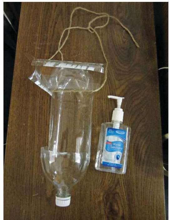
Figure 20. Bark and ambrosia beetle ethanol trap made from soda bottle with a large “window” and hand sanitizer.