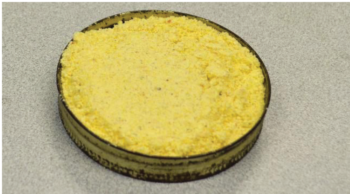
Figure 7. Shallow lid containing corn meal and boric acid for pantry pests.

Commercial “pantry pest” traps employ a sex-pheromone that lures the adult stages of the insect (normally the male) to a sticky card that can be hung near a suspected infestation. Most traps contain a lure attractive to multiple pantry-pest species. The traps must be placed strategically because too many of them in a confined area may confuse moths and make the traps less effective. Similar pheromone traps are available for clothes moths.