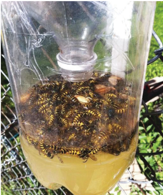
Figure 10. Fermenting fruit juices will attract stinging wasps in the bottle trap.

Social wasps including yellow jackets, hornets and paper wasps are common stinging insects that can be a nuisance when foraging near garbage cans or building nests (which they will defend) close to human activities. The plastic bottle funnel trap can be used as a simple DIY trap. Adding petroleum jelly or cooking oil along the inside edges of the funnel can cause wasps to slip inside the trap. Preferred baits vary according to the season and wasp species. In general protein baits (e.g., hamburger) work best in the spring when wasps are building their colonies while carbohydrate baits (e.g., fermenting fruits or beer) may be more effective in the late summer and fall. Do not use honey because it may attract honeybees. Hang traps about 4 to 5 feet above the ground. For safety, place them away from sites of human activity.