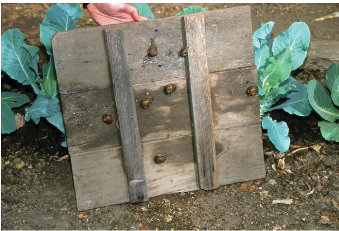
Figure 16. Snails hiding under raised board trap.