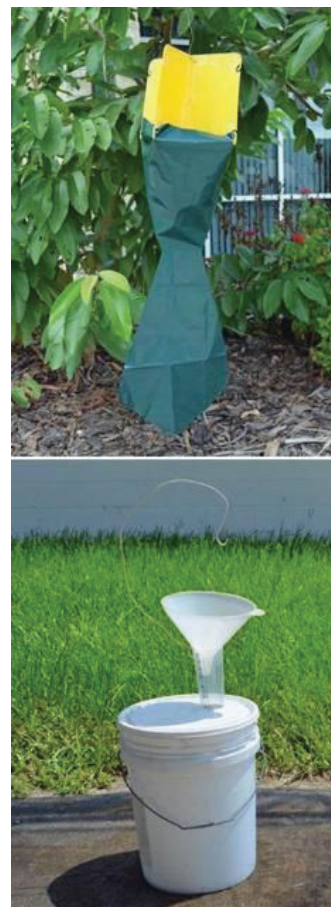
Figure 23. Commercial Japanese beetle trap (top) and DIY version below (lures not shown).

Light-trapping is a general term for attracting and capturing nocturnal insects with lamps, especially those that emit light in the ultraviolet range, e.g., mercury vapor lamps, black light lamps, or fluorescent tubes. A simple light trap can be made from a funnel, a round bucket, and a light. The funnel is placed in the container and the light source suspended above. Insects attracted to the light fall through the funnel and are trapped. Newspaper strips, egg boxes, or similar materials provide a hiding place for trapped insects. Hanging a black light adjacent to a vertically suspended white sheet outdoors is an excellent way to observe large numbers of nocturnal insects, including moths and beetles. In addition to the need for a power source, the main disadvantage of light traps is their rather indiscriminate nature. They catch many different types of insects without necessarily controlling any specific one.