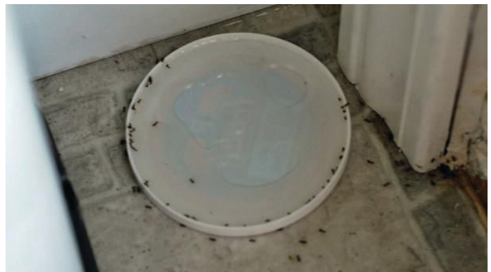
Figure 6. A poison ant bait station containing sugar and boric acid.

A poison bait station for ants can be made by mixing boric acid, with sugar water or honey in a 2% concentration. The bait is placed in shallow container lids where ants are foraging. Any foraging ants should be allowed to carry food back to their nest, where the queen will eventually be killed. Not all species of ants are susceptible; in general, smaller species that are attracted to sugars will be most vulnerable. Place traps in a safe place away from access because boric acid is toxic and can cause serious illness to pets and children if ingested.