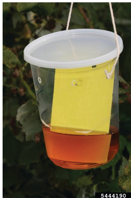
Figure 14. Fruit fly trap baited with vinegar.

Disposable cups baited with apple cider vinegar are highly attractive fruit fly traps in homes, gardens, and orchards. Poke small holes in the cup to allow flies inside. Fruit flies that enter the trap quickly drown in the vinegar. Hang cups wherever fruit fly infestations occur or as a pest-monitoring tool in orchards.