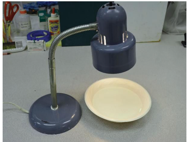
Figure 9. Illuminated pan traps will attract fleas.

Some stinkbugs, such as the brown marmorated stinkbug (BMSB), enter homes or other structures in high numbers. The BMSB is attracted to light sources and can be caught at night with a light source directed at a reflective pan of water similar to the flea trap; although being a larger insect, the stinkbug may require deeper water than does the flea. A recent citizen science study concluded that an aluminum foil water pan trap was the most effective trap tested for collecting BMSB.