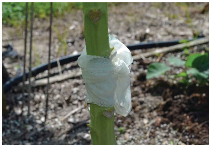
Figure 13. Plant barrier traps prevent ants that farm honeydew-producing insects.