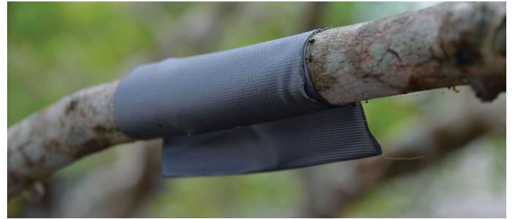
Figure 19. Tape trap for monitoring scale and mealybug crawlers.

cups or inverted soda bottles containing soapy water and baited with ethyl alcohol (ethanol) released via a cotton wick. Alternatively liquid hand sanitizer containing at least 65% ethanol can be dispensed directly into the bottom of the trap. Traps should have a strategically cut window in the side to allow entrance of flying beetles, which drown in the soapy water or liquid hand sanitizer. Traps should be hung from a branch or attached to a stake in the afternoon when temperatures are above 70°F and checked the next day. A citizen science bark beetle project shows how to make ethanol traps and get bark beetles identified.