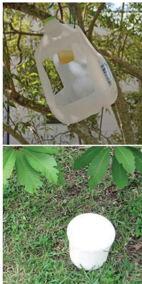
Figure 22. A food bait trap made from a milk jug (top) and white bucket (bottom) with soapy water can be used to trap day- and night-active scarabs, respectively.

The larvae of beetles in the family Scarabaeidae (scarabs) are pests of turf and ornamental plants. Root feeding by the larvae can cause significant decline in lawns while the adult stage of some species feeds on trees and shrubs. Day-flying scarabs like the green June beetle, flower beetles, and Japanese beetles can be caught in a DIY food-bait scarab trap . The trap consists of a one-gallon milk jug or similar container, with large windows cut in the side. The lid or cap should not be removed. The trap is baited with fermenting foods, such as beer and an over-ripe banana placed inside a smaller container. Beetles attracted to the baits enter the trap, where they drown in soapy water. The traps should be hung from tree branches or fence posts and checked weekly, with the bait refreshed at least monthly. Night-active May/June beetles are attracted to light-colored objects. A white bucket scarab trap containing soapy water can be placed under trees or shrubs where feeding damage is observed. Commercial pheromone traps are available for the adult stages of some scarabs.