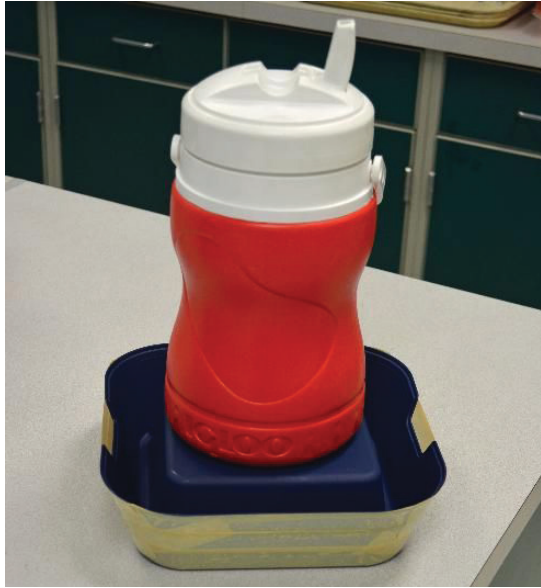
Figure 3. Bed bug trap with dry ice lure.

under the legs of beds and other furniture. Masking tape placed on the outermost and innermost sides of the large and small containers, respectively, will enable approaching bed bugs to enter either container—but not to exit back to the room. Car polish or a thin layer of talcum powder applied to the interior side of the larger and exterior side of the smaller container will ensure trapped bed bugs cannot escape.