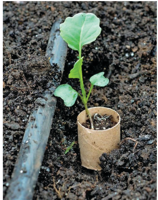
Figure 17. Cutworm collars made from toilet paper rolls help protect vulnerable seedlings.

The larvae of some noctuid moths chew through the stems of young plants, killing them. These “cutworms” typically hide in the ground during the day and are easy to overlook. Vulnerable seedlings can be protected with a section of cardboard tube placed around the stem and pushed a few inches into the ground. These “cutworm collars” can be made from used toilet paper rolls, which will naturally decompose after a few weeks, when the plants will be less susceptible to damage.