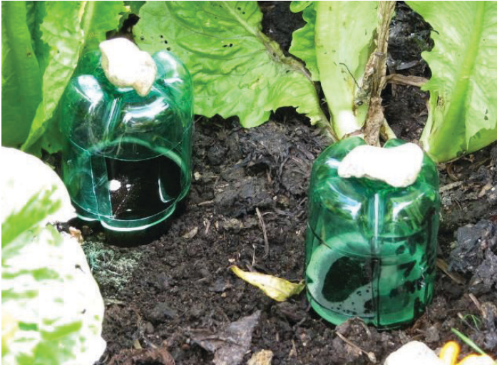
Figure 15. Pitfall trap for slugs and snails made from two plastic bottle halves.

and other beneficial insects that eat mollusks, and these should therefore not be removed.