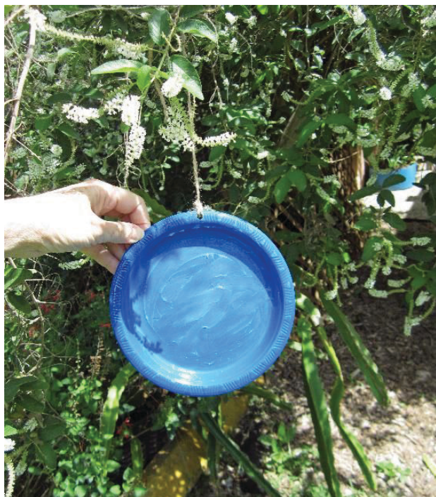
Figure 12. Disposable plastic plate covered with petroleum jelly for trapping thrips.

Sticky plant barrier traps may also be used where ants are found “herding” aphids, soft scales, or other honeydew secreting insects. Ants tending these plant-feeding insects protect them from natural enemies, resulting in dramatically increased pest infestations. In cases where ants are observed interacting with aphids and feeding on their honeydew, a sticky barrier of petroleum jelly placed around the bases or stems of infested plants will trap and deter ants and thus allow natural control methods to become reestablished.