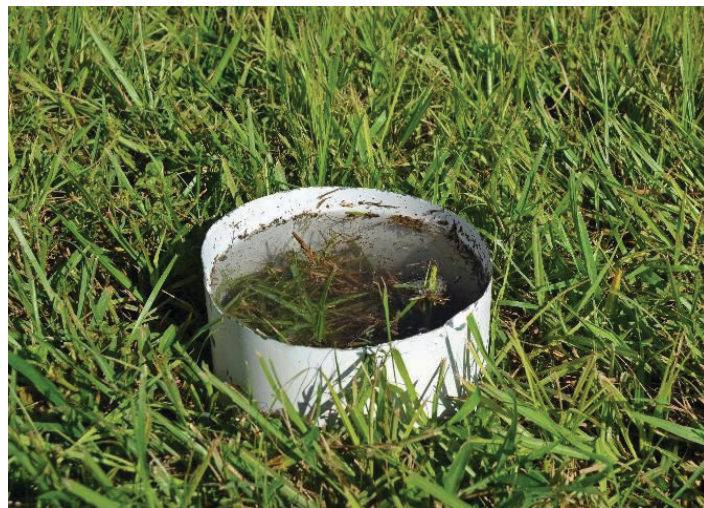
Figure 24. Flotation method to monitor chinch bugs in turf.