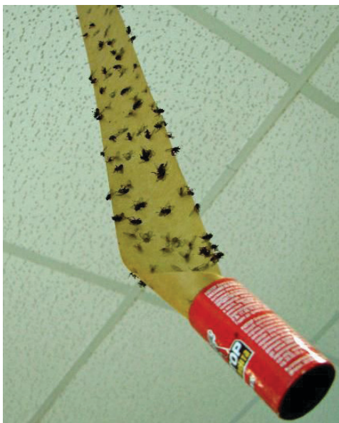
Figure 1. Flypaper or ribbon.

A simple inexpensive bottle funnel trap can be made using an empty plastic drinking container. The top is cut just below the neck, inverted into the body as a funnel, and attached with tape or glue. Small holes cut in the side allow the trap to be hung up. The trap can be baited with various foods or other attractants and placed indoors or outdoors in locations where flies are active. Houseflies ( Musca domestica ) are effectively baited with sugary liquids such as sugar syrup or honey water. Protein baits (such as meat) are attractive to blow or carrion flies such as bottle flies (Caliphoridae), while fermenting materials (ripe fruits, cider vinegar, beer or wine) attract fruit flies (Tephritidae) as well as wasps. Water containing a drop of liquid detergent or oil to reduce surface tension can be added to drown caught flies. Small flies, such as fruit flies, can be trapped or monitored with a jar or cup baited with apple cider vinegar and a drop of soap. The container is covered with plastic food wrap sealed with a rubber band and holes poked in the top allow odor to escape and flies to enter. Commercial fly traps come in various forms including cups and disposable bags and include dissolvable baits that are mixed to form a drowning solution.