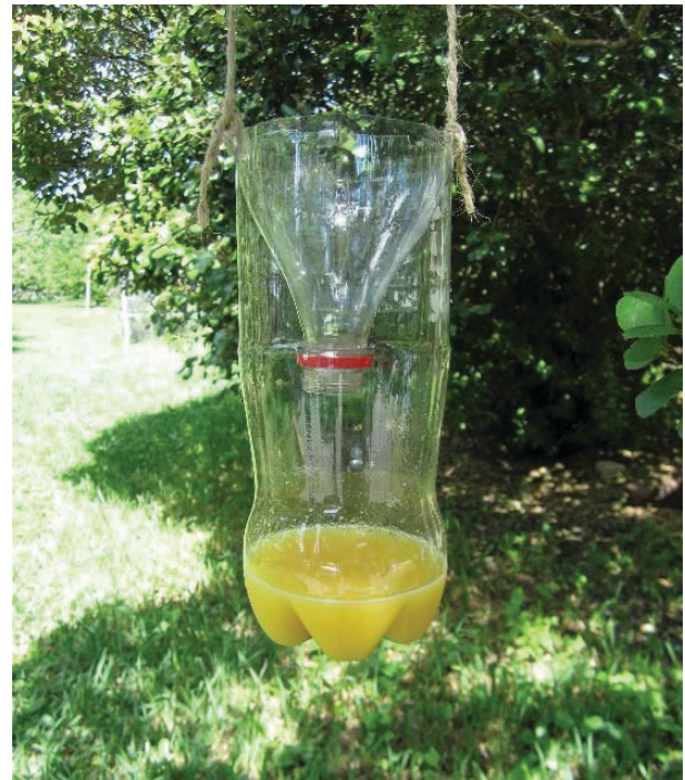
Figure 2. Bottle trap for flies, wasps and other insects.