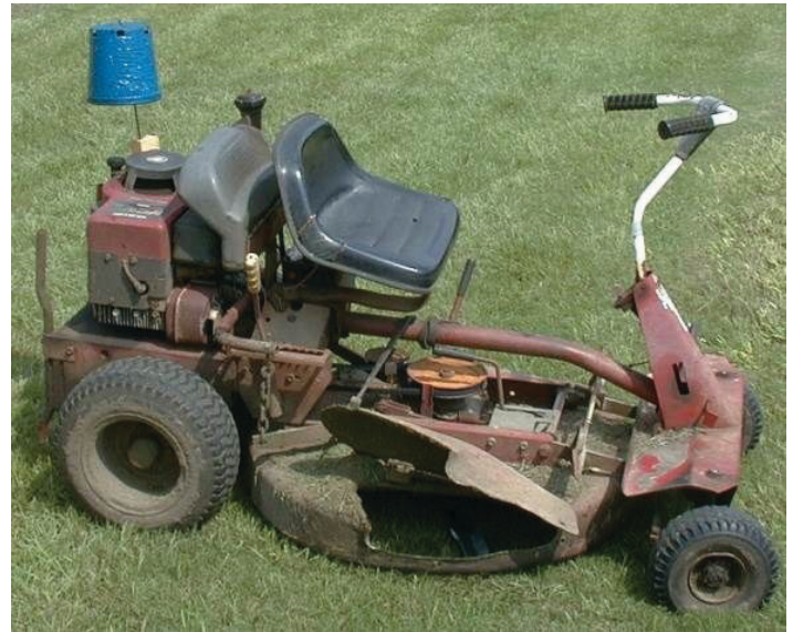
Figure 11. Trolling deer fly trap attached to lawnmower.

Many insects attack flowers, fruits, vegetables, and turf. Populations of these garden pests may not be readily detected until they reach damaging levels, due to the insects’ small size, cryptic habits, or nocturnal habits. Fortunately, several traps and monitoring devices can help alert gardeners to their presence, allowing appropriate control measures to be taken if needed.