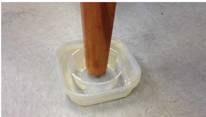
Figure 4. Bed bug interceptor trap.