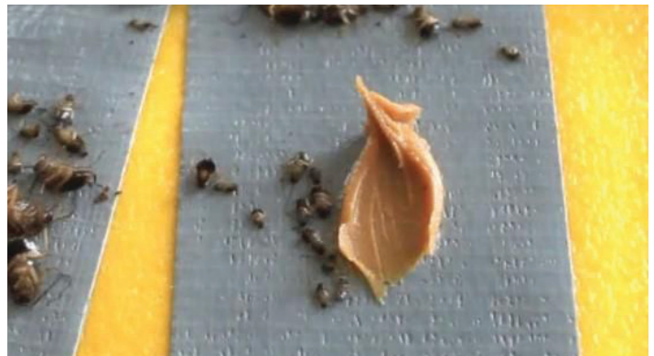
Figure 5. Glue trap made from duct tape with peanut butter bait.

commercial sticky traps also contain a pheromone that is claimed to attract cockroaches. A DIY poison-bait station for cockroaches can be made using powdered boric acid (or Borax) liberally mixed with slightly melted peanut butter. The bait can be applied in bottle caps or shallow container lids indoors or outdoors where infestations occur.