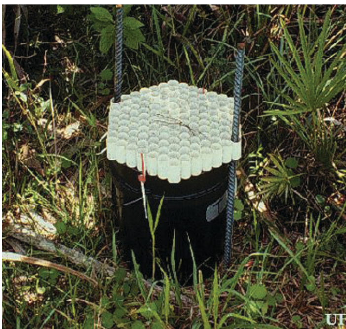
Figure 21. Bucket trap used to capture palmetto weevils.

The giant palm weevil or palmetto weevil ( Rhynchoporus cruentatus ) attacks palms, including the sabal, coconut, and date palms, in Florida and elsewhere. The silky cane weevil ( Metamasius hemipterus sericeus ) attacks banana, Musa spp., palms, and sugarcane. Stressed, damaged, and recently transplanted trees or plants are the most susceptible. These pests are very destructive since an infestation is rarely found at the early stage and severely infested trees are difficult to treat. Black 5-gallon bucket traps baited with palm stem tissue, sugarcane (cut into 2- to 4-inch pieces), or pineapple are used to attract weevils. Baffles constructed from 5 cm long PVC glued together longitudinally and placed over bucket openings effectively prevent weevils from escaping. Small draining holes should be added to the buckets. Traps should be secured with rebar or stakes. Hardware cloth (heavy wire screening) can be used to protect the bait from animals (especially raccoons). Traps should be situated away from susceptible trees. Traps can be synergized by using the synthesized and commercially available male-produced aggregation pheromones of these weevils ( http://www.chemtica.com/site/?p=1766 ; http://www.chemtica.com/site/?p=2953 ) as well as the wounded plant kairomone, ethyl acetate ( http://www.chemtica.com/site/?p=1774 ).