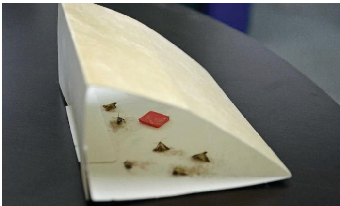
Figure 8. Sticky trap containing pheromone that has attracted Indian meal moths.