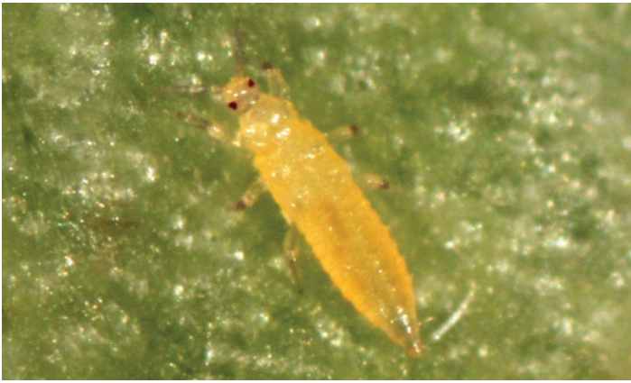
Figure 2. Larva of Florida flower thrips, Frankliniella bispinosa Morgan, on a bean leaf.