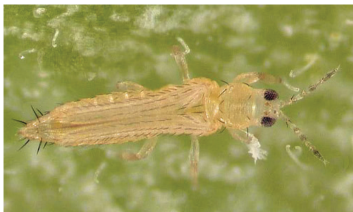
Figure 1. Adult Florida flower thrips, Frankliniella bispinosa Morgan.