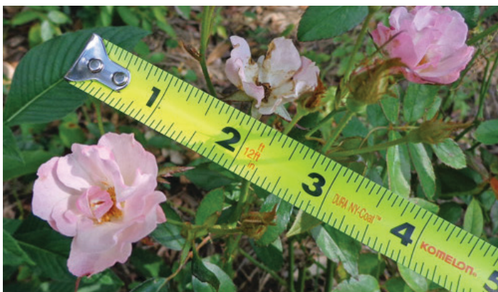
Figure 9. Damage to polyantha rose (La Marne) by Florida flower thrips, Frankliniella bispinosa Morgan, showing petal and bud scarring.

Many insecticides are labelled for flower thrips control in vegetables and ornamental plants. However, the use of broad-spectrum insecticides may favor the buildup of western flower thrips, which is more tolerant compared with their predators and competitor native flower thrips leading to more severe pest problems (Funderburk 2009). In fruiting vegetables (peppers and tomatoes) Florida flower thrips and native species, Frankliniella tritici , are far less damaging when compared with the invasive western flower thrips or melon thrips, Thrips palmi Karny. For this reason, limiting insecticides to those compatible with natural enemies and preserving populations of less damaging native competitor thrips are recommended (Pani et al. 2008, Funderburk 2009).