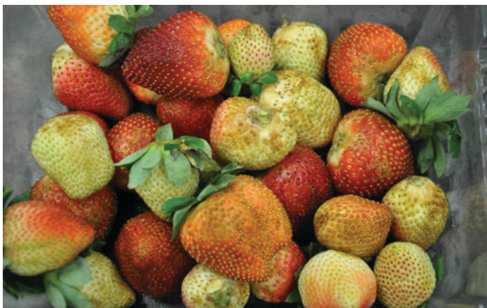
Figure 8. Bronzing on strawberry caused by Florida flower thrips, Frankliniella bispinosa Morgan.

in tomato plants before treatment is recommended (Funderburk 2009). Plastic mulches that reflect UV are used as repellents to prevent colonization of field-grown fruiting vegetables, although the effectiveness of this approach declines as the plants grow, covering the mulch (Demirozer et al. 2012, Tyler-Julian et al. 2014).