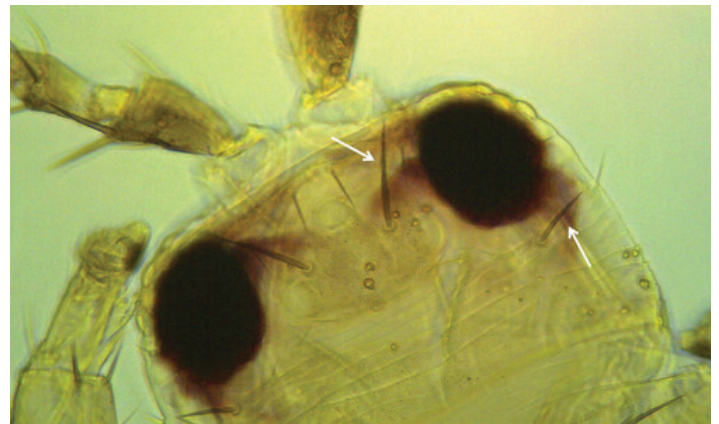
Figure 4. Head of Frankliniella bispinosa Morgan is wider than it is long, with well-developed interocular setae (hairs) (left arrow), longer than postocular setae (right arrow).

Like the immature stages, Frankliniella bispinosa adults resemble other Frankliniella species, and are commonly found in association with Frankliniella tritici and Frankliniella occidentalis . This species is particularly similar to a Caribbean species, Frankliniella cephalica ; the only recorded difference being the shape of the pedicel ring on the third antennal segment. Several diagnostic features are provided below.