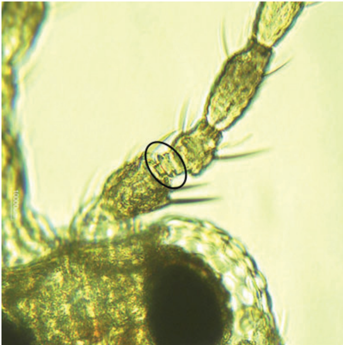
Figure 3. Antennal segment II of Frankliniella bispinosa Morgan has prominent spines, and the segment III pedicel has a sharp edged ring (circled).