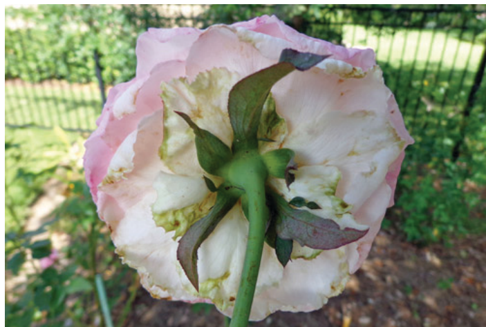
Figure 10. Damage to hybrid tea rose (Beverly) by Florida flower thrips, Frankliniella bispinosa Morgan, showing petal scarring.

Many insecticides are labelled for flower thrips control in vegetables and ornamental plants. However, the use of broad-spectrum insecticides may favor the buildup of western flower thrips, which is more tolerant compared with their predators and competitor native flower thrips leading to more severe pest problems (Funderburk 2009). In fruiting vegetables (peppers and tomatoes) Florida flower thrips and native species, Frankliniella tritici , are far less damaging when compared with the invasive western flower thrips or melon thrips, Thrips palmi Karny. For this reason, limiting insecticides to those compatible with natural enemies and preserving populations of less damaging native competitor thrips are recommended (Pani et al. 2008, Funderburk 2009).