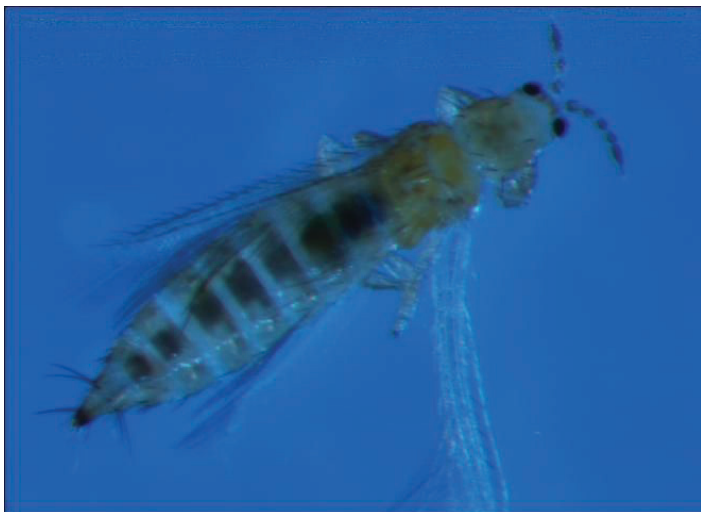
Figure 1. Western flower thrips, Frankliniella occidentalis (Pergande) adult.

and fruits; scarred petals; ii) linear thickenings of the leaf lamina; curled and distorted leaves/terminals; iii) brown frass markings on the leaves and fruits; iv) gray to black markings on fruits, often forming a conspicuous ring of scarred tissue around the apex; v) distorted or scabby fruits; vi) early senescence of leaves; and vii) stunted growth of the host.