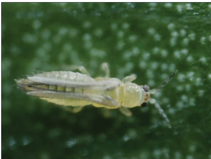
Figure 2. Chilli thrips, Scirtothrips dorsalis (Hood) adult.