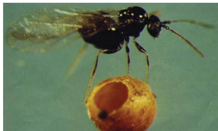
Figure 1. Gall and female wasp of the second generation of Neuroterus saltatorius . The gall is 1 mm in diameter.

behavior of the second-generation galls after they fall from the leaves mid-summer (Smith 1995). The movement is much like the well-known “Mexican jumping beans” ( Cydia deshalsiana ) (Lepidoptera: Tortricidae). When the tightly packed larva inside the gall moves, it creates a jumping motion, and the 1 mm gall can jump up to 3 cm (Manier and Damier 2014)! This jumping action enables the gall to lodge into the soil and leaf litter where it overwinters, protected from temperature and humidity fluctuations, and its parasitoid enemies (Smith 1995, Manier and Damier 2014).