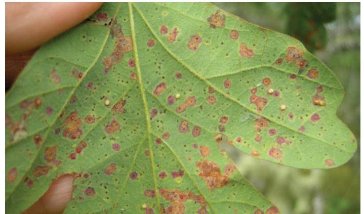
Figure 7. Failed gall induction on trees in the native range in southern Puget Sound, Washington.

Increased host plant susceptibility may play a role in the outbreaks of Neuroterus saltatorius in its introduced range. While most trees in a patch of oaks are infested in the introduced range, in the native range highly infested trees are rare and often surrounded by a sea of uninfested trees. Higher failed gall induction and higher mortality of gall-formers has also been recorded in the native range compared to the introduced range on Vancouver Island (Prior and Hellmann 2013) (Figure 7).