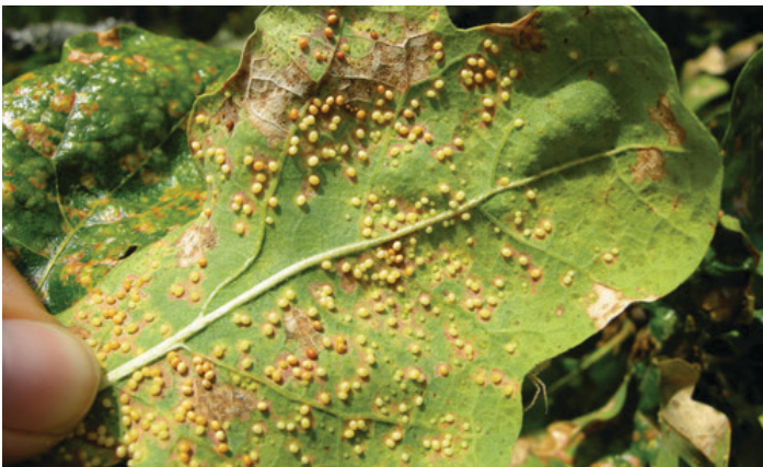
Figure 5. Second or agamic (female only) generation galls.