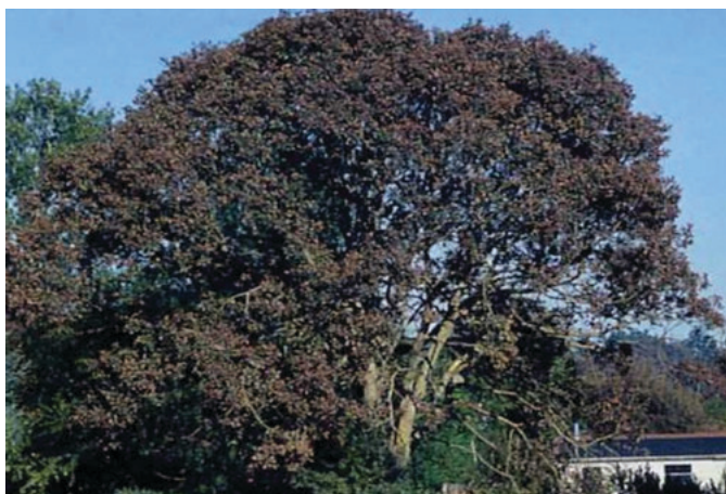
Figure 3. Infested Quercus garryana tree and mid-summer foliar damage in Victoria, British Columbia, Canada.

Another reason why this tiny gall garner attention is because it can cause significant mid-summer foliar scorching on oaks (Figure 2). Foliar necrosis occurs around the site of gall attachment, and when the number of galls on a leaf is high the entire leaf can brown. In some cases, whole trees become infested, and branch dieback or premature defoliation occurs (Figure 3). Where this species is found in the western United States, the numbers of galls on leaves is not usually high. Damage is rarely reported, and when infestations occur, infested trees are often in isolation (Smith 1995, Schick 2003, Prior and Hellmann 2013). This species has been introduced into new locations, such as to the San Juan Islands in Washington State and Vancouver Island, British Columbia in Canada. The Canadian Forest Service first detected this species in 1986 just north of the city of Victoria (Duncan 1997). In its introduced range, it occurs at very high densities on trees; whole patches of trees are often infested, and infestations are consistently high from year to year (Smith 1995, Duncan 1997, Prior and Hellmann 2013). On Vancouver Island and the San Juan Islands, it is considered a threat to a rare oak savanna ecosystem (Duncan 1997, Prior and Hellmann 2010).