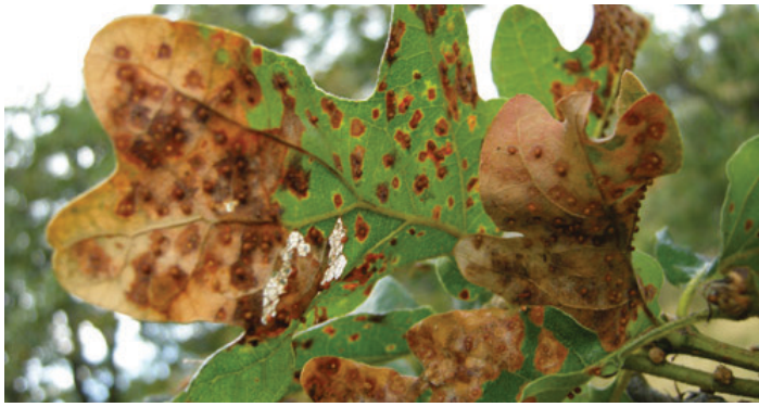
Figure 2. Foliar damage caused by the second generation of Neuroterus saltatorius in its introduced range (Victoria, British Columbia, Canada).