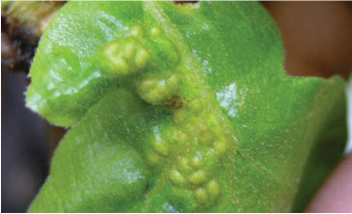
Figure 4. First or gamic (sexual) generation foliar cluster galls.

asexual or agamic generation (Figure 5). Listed below are descriptions for those life history stages and galls that have been previously described.