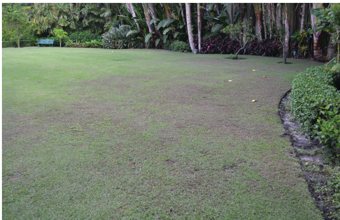
Figure 5. Extensive Tuttle mealybug damage in a zoysiagrass lawn in south Florida.