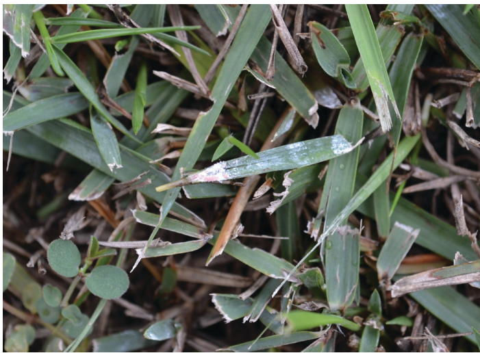
Figure 3. Tuttle mealybugs and wax secretions on Empire zoysiagrass.

oval-shaped bodies and secrete a white, waxy substance that covers their body and parts of leaves (Figure 3). Adult females are larger and often covered with more wax than nymphs. The white wax is often the best indicator of infestation. Although not common, the Winnemuca grass mealybug and pink sugarcane mealybug have been found on turfgrass and resemble Tuttle mealybug in appearance. Therefore, mealybugs must be collected and sent to Florida Department of Agriculture and Consumer Services—Division of Plant Industry (FDACS-DPI) for proper identification. However, management is likely the same.