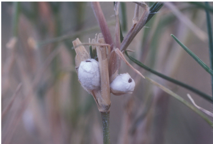
Figure 1. Rhodesgrass mealybug adult females.

Rhodesgrass mealybugs have a distinct appearance that sets them apart from most other turf-infesting insect pests. They have round, dark brown bodies that are typically covered with a white, waxy secretion. This waxy covering resembles a tuft of cotton on the grass stem (Figure 1). This mealybug feeds under the leaf sheath, on leaf nodes, or within the crown of the plant. Mature females are most noticeable because they produce a spindly waxy fiber that extends from their round cottony body (Figure 2).