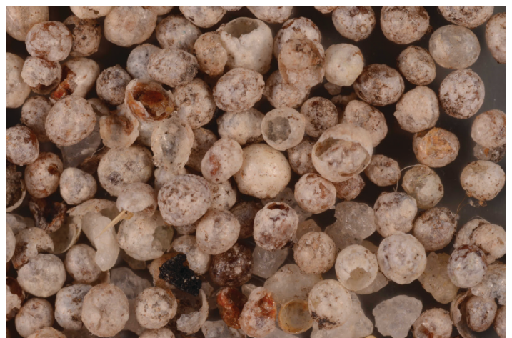
Figure 9. Dimargarodes meridionalis cysts.

Ground pearls are found in the soil up to 10 inches (25 cm) below the surface. Eggs are pink to white and covered in a white waxy case. Nymphs form yellow to brown spherical shells or cysts, which is the basis of the name “pearl.” These cysts (Figure 9) range in size from about 1/50–1/20 inch (0.5–1.5 mm). The adult female is wingless, 1/20 inch (1.5 mm) long, pink in color, and has well-developed forelegs and claws (Figure 10). Adult males are not commonly seen, but have wings and are gnat-like.