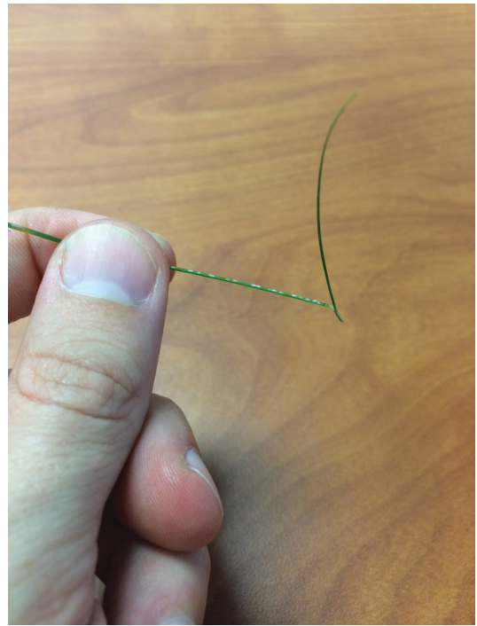
Figure 8. Duplachionaspis divergens on zoysiagrass.

Although this pest is occasionally found in high numbers, D. divergens is considered a minor pest of grasses. Grass blades turn yellow and brown at sites where insects are feeding.