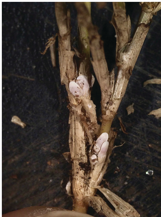
Figure 6. Bermudagrass scale insects on bermudagrass stem.

This insect is distributed worldwide and throughout Florida. It was first reported as a damaging pest of forage and turfgrasses in the southern United States in 1964.