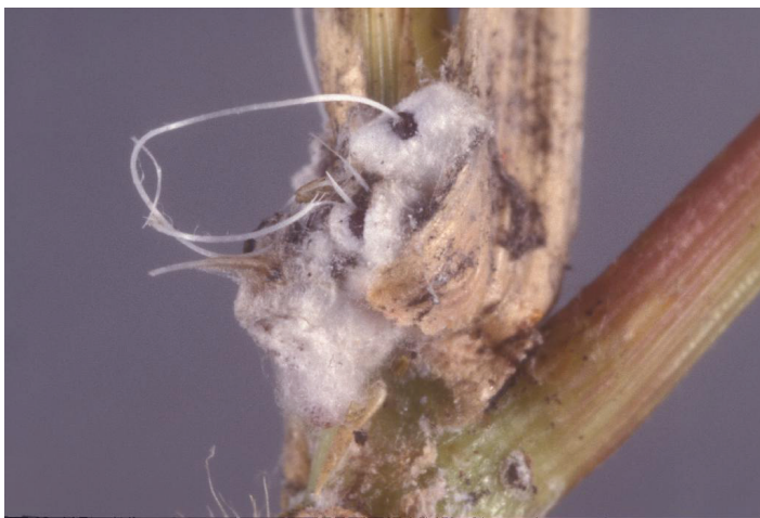
Figure 2. Rhodesgrass mealybug adult female with wax filament.