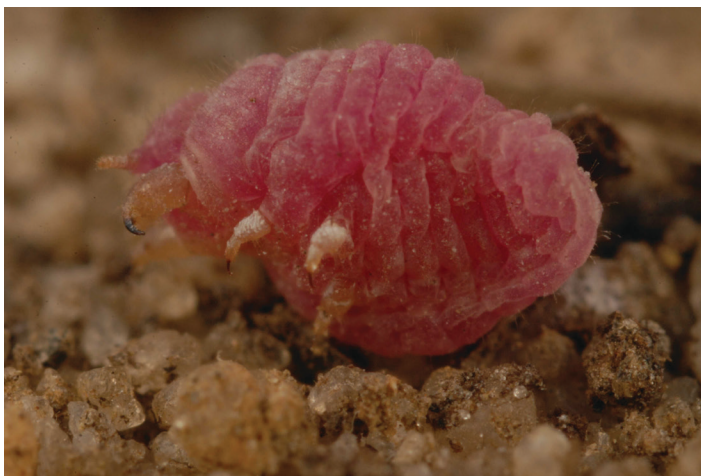
Figure 10. Dimargarodes meridionalis adult female.