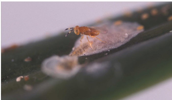
Figure 11. Parasitoid wasp (Aphelinidae) attacking an armored scale insect.