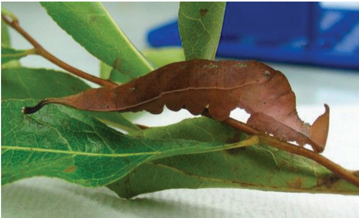
Figure 8. Fifth instar (mature larva) of Prepona laertes on gopher apple foliage.