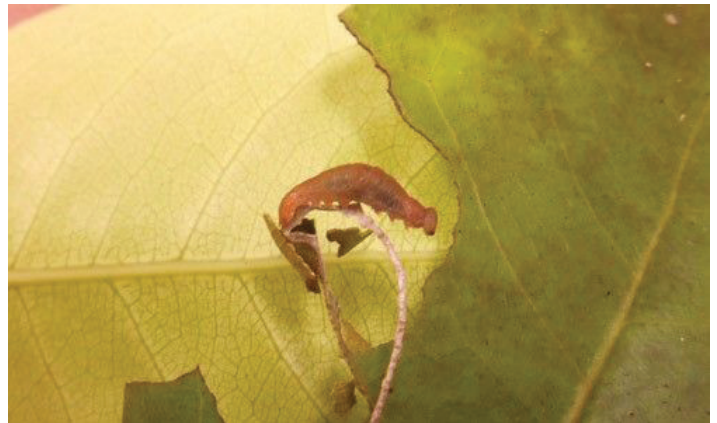
Figure 6. Larva of Prepona laertes , first instar on cocoplum leaf.

Larvae are smooth and brown (Figures 6–8). The head has a pair of closely set horns, appearing “coneheaded.” The abdomen is swollen anteriorly, thickest at the second segment. The prolegs on the last segment are rudimentary and hidden under a pair of long, crooked “tails.” These features are most pronounced in older caterpillars (Figure 8), and first-instar larvae (Figure 6) cannot be distinguished easily from those of native species. Mature larvae reach lengths of 7.0 to 7.5 cm ( \sim 2\frac{1}{2} to 3 in). The cryptic larvae move slowly with a waddling gait (DeVries 1987).