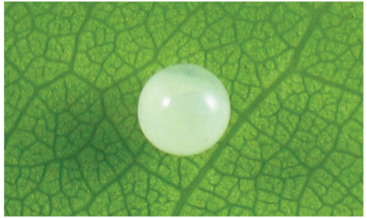
Figure 9. Egg of Prepona laertes on cocoplum leaf.

Preliminary evidence suggests that Prepona laertes in parts of its native range may comprise at least two host races or cryptic species, one of which feeds on Fabaceae (Leguminosae), and another on Chrysobalanaceae (Janzen et al. 2009). However, morphological characters that differ consistently have not yet been found (Dias et al. 2011). Prepona laertes , as currently circumscribed, has many synonyms and subspecies (Lamas 2004), including Prepona omphale (Hübner) and Prepona laertes demodice (Godart). The genus Prepona Boisduval includes several other similar species in the Neotropical region (Ortiz-Acevedo and Willmott 2013, Warren et al. 2016).