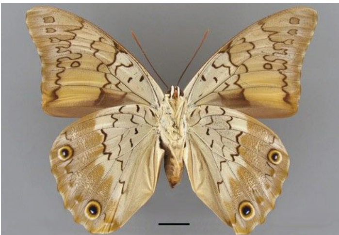
Figure 4. Female Prepona laertes , ventral aspect. Scale bar = 1 cm ( \sim\frac{3}{8} in).