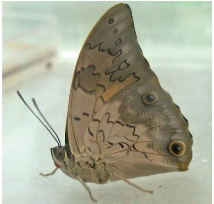
Figure 5. Live male Prepona laertes raised in quarantine.

Larvae are smooth and brown (Figures 6–8). The head has a pair of closely set horns, appearing “coneheaded.” The abdomen is swollen anteriorly, thickest at the second segment. The prolegs on the last segment are rudimentary and hidden under a pair of long, crooked “tails.” These features are most pronounced in older caterpillars (Figure 8), and first-instar larvae (Figure 6) cannot be distinguished easily from those of native species. Mature larvae reach lengths of 7.0 to 7.5 cm ( \sim 2\frac{1}{2} to 3 in). The cryptic larvae move slowly with a waddling gait (DeVries 1987).