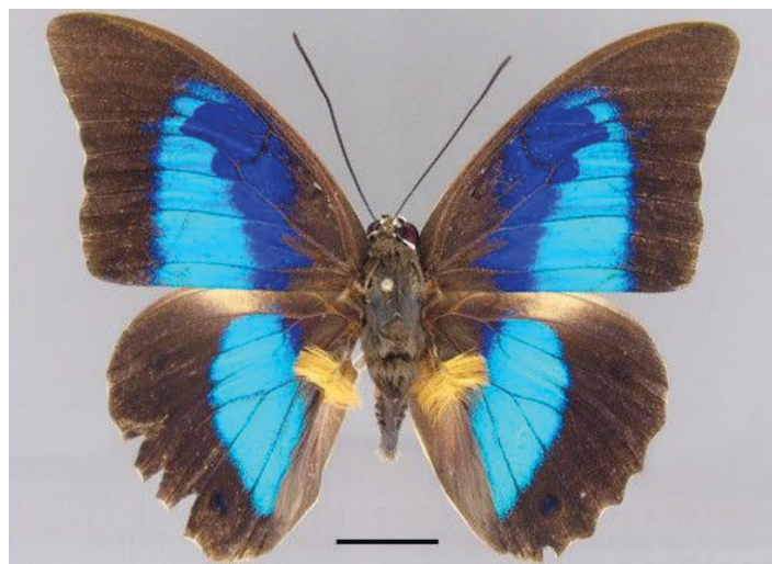
Figure 1. Male Prepona laertes from initial interception in Florida, dorsal aspect. Scale bar = 1 cm (~3/8 in).

Prepona laertes differs from other butterflies in Florida in wing pattern (Figures 1–5). The forewing length (base to apex) is 3.5 to 5.0 cm (1.4 to 2.0 inches), males being smaller. The wings are black on the dorsal side with a broad, blue medial band. Ventrally, they are grayish to tan brown with narrow, angular lines. Each hind wing has two small eyespots. Males have a large tuft of yellow hairs on the hind wing.