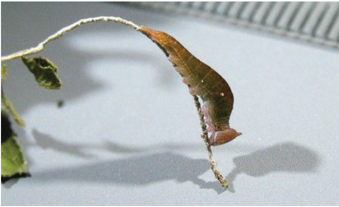
Figure 7. Second instar larva of Prepona laertes on cocoplum leaf. Scale in mm.