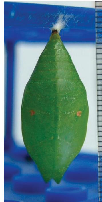
Figure 10. Pupa of Prepona laertes . Scale in millimeters.