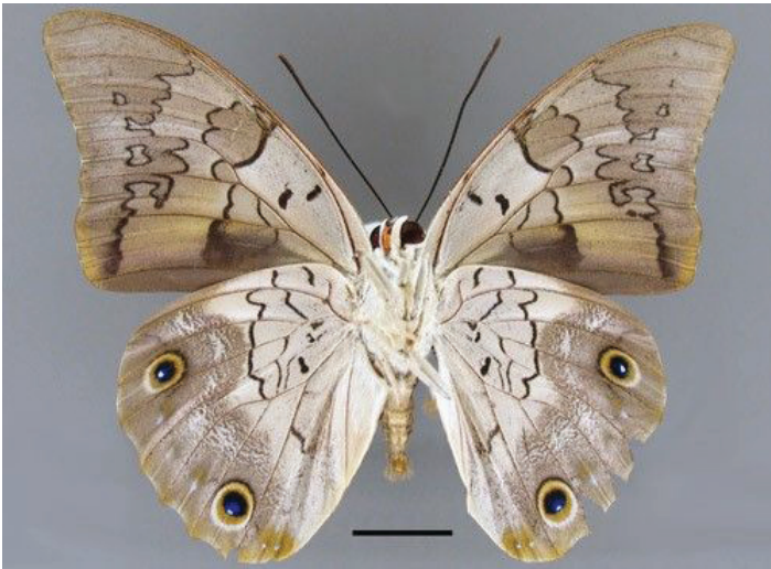
Figure 2. Male Prepona laertes , ventral aspect. Scale bar = 1 cm ( \sim\frac{3}{8} in).