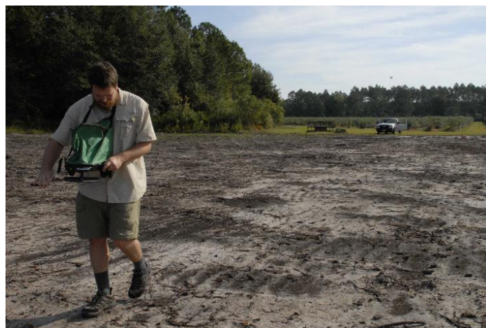
Figure 4. Broadcast seeders can be used to distribute wildflower seeds along a plot's surface.