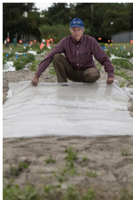
Figure 3. Solarization employs the use of large sheets of plastic to control weeds.