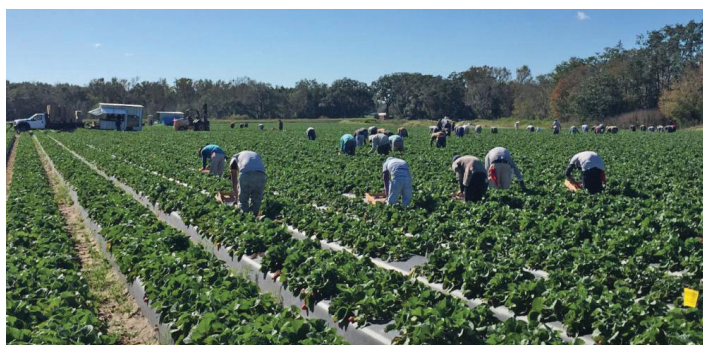
Figure 8. Harvest crew picking strawberries, moving up and down planting rows, Plant City, FL, 2017.

Foliar nematodes can also infest new plants by swimming up stems and moving along moist plant tissue surfaces. In some hosts they may also enter the leaves through stomata, but this has not been observed on strawberries. Foliar nematodes can mature from egg to adult in about 2 weeks, allowing many generations to develop during one growing season. Another potential means by which foliar nematodes are spread is through the harvesting process. Especially when plants are still wet from morning dew, the nematodes can easily be spread by the harvesting crew as they drag their hands through the planting rows while picking the berries (Figure 8).