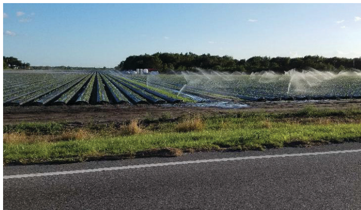
Figure 7. Overhead irrigation in strawberry field.

propagation of plants in spring and summer, the runners formed by crimped plants usually become infected as they push through the infected areas at the base of the leaves. This resulted in circular areas of diseased plants appearing in the nursery beds.