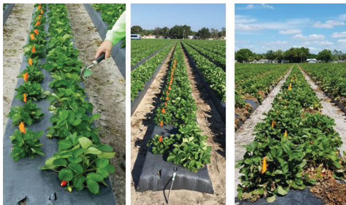
Figure 5. Foliar nematode symptoms on strawberry throughout the growing season; orange flags indicate nematode infection; same row is shown at different times; left, November 2016; middle, December 2016; and right, March 2017. Plant City, FL.

In the 2016–17 strawberry season, we observed a striking change in plant habit of nematode-infected strawberries throughout the growing season. Early in the season, A. besseyi -infected plants showed the typical crinkling and folding of leaves, and plants were compact and stunted. However, by the end of the season those same plants had become larger and greener as compared to non-infected plants (Figure 5).