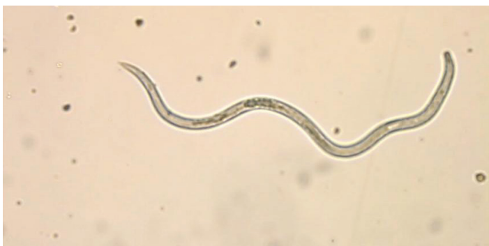
Figure 1. Aphelenchoides besseyi from strawberry. Plant City, 2016.

From the 1930's until the 1960's, crimp was frequently observed in commercial FL strawberry nurseries. Years when crimp did not show up were linked to low spring temperatures, setting of plants in new ground, and careful selection of nursery plants. There is no certainty about which species of Aphelenchoides caused crimp in Florida during those days. During the early years they were identified as A. fragariae , but in later reports starting around the 1950's there is no more mention of A. fragariae , instead the nematodes were now identified as A. besseyi . A. besseyi was first described in 1942 by J.R. Christei, so possibly the earlier reports were misidentifications. Very few reports exist on bud nematodes in FL strawberries after the 1970's. In 2014 the nematodes were reported from one farm (Noling, personal communication), and in 2016-17 they were found on six farms. The 2016-17 foliar nematodes were identified morphologically as A. besseyi (R. Inserra, FDACS, DPI, Gainesville, (R. Inserra, DPI, Gainesville, FL) (Figure 1). This identification was confirmed by molecular analyses of topotype populations of this species (Oliveira et al, 2019). Several other species of Aphelenchoides have since been identified from Florida strawberry fields, including a newly described species A. pseudogoodeyi which appears to be fungal-feeding and not cause damage to strawberry (Oliveira et al, 2019; Subbotin et al, 2020).