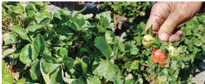
Figure 4. Aphelenchoides besseyi symptoms on strawberry. Left: twisting, crinkling and curling of strawberry leaves; right: abnormally shaped "broccoli" fruit. Plant City, FL, 2016–17 season.

Most nematodes in strawberry plants are found in the protected spaces at the bases of the young leaves and in the folds of the leaves in the bud. Brooks (1931) could artificially produce crimps by placing some of these nematodes in the buds of healthy plants. The time required for the symptoms to appear varied from 11 to 120 days, depending upon temperature, moisture, and whether or not the plant was putting on new foliage.