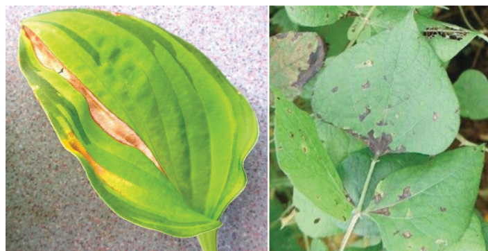
Figure 6. Aphelenchoides besseyi symptoms on Hosta spp. (interval lesions) and beans ("angular leaf spot", Costa Rica).

In other plants, foliar nematode symptoms often include localized chlorotic or purplish angular lesions that are delineated by leaf veins (it is difficult for the nematodes to move across the veins). This often creates a patch-like appearance on dicots and a stripe-like pattern with monocots (because monocots have parallel veins, discoloring on them looks like streaks) (Figure 6.) Discoloring typically starts near the leaf base and spreads outward. The symptoms of angular spots are often mistaken for bacterial leaf spots or fungal pathogens such as downy mildew which are also commonly confined between the leaf veins. In Costa Rica, A. besseyi has been reported to cause a disease of bean called angular leafspot (Figure 6).