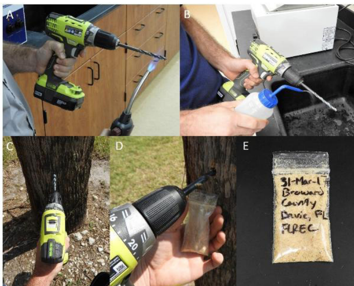
Figure 1. Protocol for palm trunk sampling to test for LY and TPPD phytoplasmas: Heat sterilization of drill bit before drilling for trunk tissue (A), Rinsing drill bit to remove excess tissue/cool after heat sterilization (B), Site selection and removal of the pseudobark so that trunk tissue can be accessed (C), Drilling hole and taking sample of living trunk tissue (D), Properly labeled bag with trunk tissue from symptomatic palm (E).