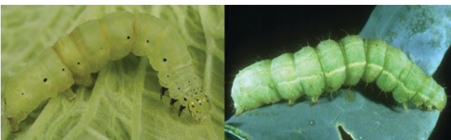
Figure 3. Soybean looper larva Chrysodeixis includens (Walker) (left) with black thoracic legs compared to the cabbage looper larva Trichoplusia ni (Hübner) (right) with green thoracic legs.