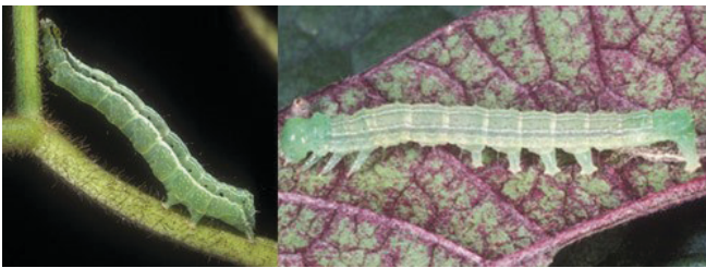
Figure 2. Soybean looper larva Chrysodeixis includens (Walker) (left) with two abdominal prolegs, compared to the velvetbean caterpillar Anticarsia gemmatilis (Hübner) (right) with four abdominal prolegs.

In its larval stage, the soybean looper is predominantly light to dark green and typically has white stripes running down the dorsal and lateral portions of its body. The body of the soybean looper tends to be thicker and larger at the rear, tapering down towards the head and can reach 1.3 inches (3.03 cm) in length. Chrysodeixis includens can be differentiated from many similar looking species by inspecting the number of abdominal prolegs. Green caterpillars with three or more abdominal prolegs such as the velvetbean caterpillar , Anticarsia gemmatilis (Hübner), can be easily distinguished from Chrysodeixis includens which has only two abdominal prolegs (Figure 2). The soybean looper may have black or green thoracic legs, while the cabbage looper has green thoracic legs (Figure 3) (Smith et al. 1994).