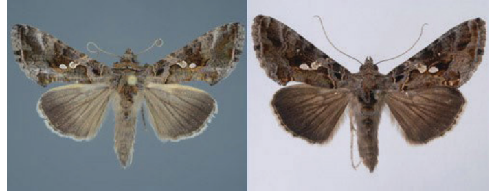
Figure 4. Adult soybean loopers, Chrysodeixis includens (Walker), with differing color patterns.

The adult moth is small, with a wingspan ranging 1 to 1.5 inches (2.54–3.81 cm), and is mottled brown to black in color. Forewings are darker in color than the hindwings and possess silvery white spots. Presence of these spots can be used to distinguish the soybean looper from many other crop feeding pests, though it should be noted that the adult cabbage looper also has similar markings.