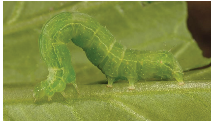
Figure 1. Soybean looper larva, Chrysodeixis includens (Walker), making its signature looping motion.

south Texas in the United States, but populations may migrate from Central and South America and the Caribbean Islands (Smith et al. 1994; Carner et al. 1974). In the southern United States, populations are most prevalent from August to September (Burleigh 1972; Canerday and Arant 1966).