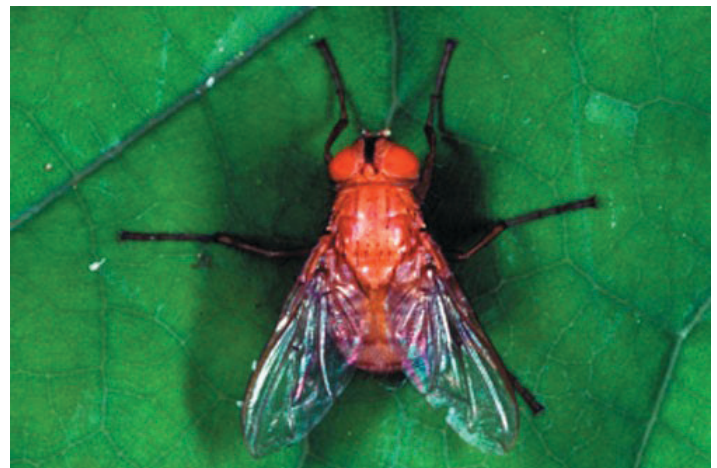
Figure 1. Ormia depleta (Wiedemann), the Brazilian red-eyed fly.

Ormia depleta was first found in Brazil, in the 1930s (Frank and Walker 2006). According to Fowler and Kochalka (1985), it also has been recorded in Honduras and Peru. After being released in Florida in 1987, adults are thought to currently be present year-round in 28 counties, and seasonally present (fall) in an additional ten counties (Figure 2) (Frank and Walker 2006).