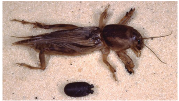
Figure 4. Pupa of Ormia depleta next to the mole cricket in which it developed.