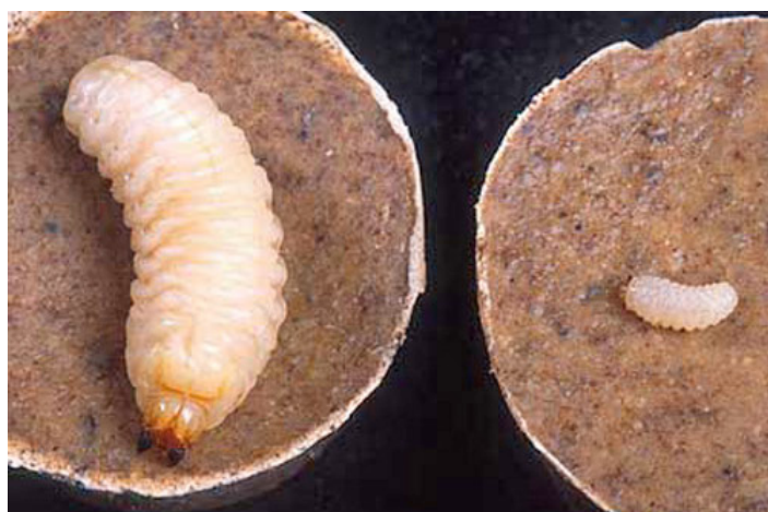
Figure 1. Diaprepes root weevil larvae.

that can sometimes be confused with grasshopper or caterpillar damage (Figure 3). The life cycle varies depending on environmental and nutritional factors. Larvae can feed for several months before pupating in the soil and then emerging as adults. Due to this extended feeding time and the 3–4 months during which the adults are laying eggs, the timing for one complete life cycle is difficult to predict.