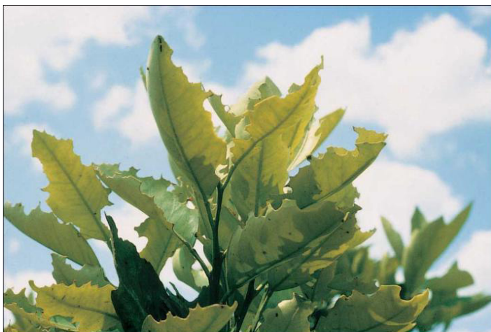
Figure 3. Adult root weevil notching damage on citrus leaves.