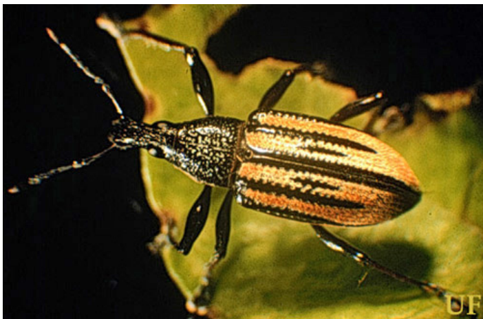
Figure 2. Adult Diaprepes root weevil.