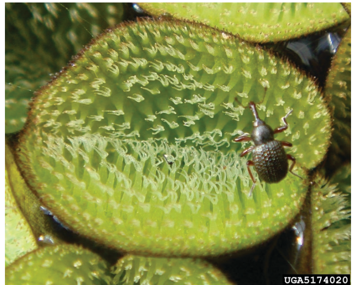
Figure 1. Adult Cyrtobagous salviniae (Calder & Sands) on its aquatic host plant, Salvinia molesta (D. S. Mitch.).

molesta . Florida has an established adventive population of Cyrtobagous salviniae , which was probably introduced in the 1960s or earlier (Kissinger 1966). It is now present in more than 77% of the Florida's waterbodies, resulting in the control of Salvinia minima (Jacono et al. 2001).