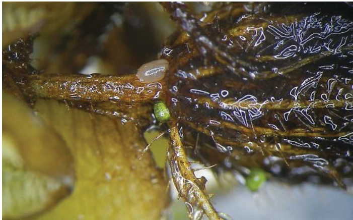
Figure 2. Egg of Cyrtobagous salviniae (Calder & Sands).

The eggs of Cyrtobagous salviniae are deposited singly on the leaves or rhizomes (belowground or sub-surface stems) of Salvinia molesta or Salvinia minima . Eggs are elliptical, milky white, and measure 0.5 by 0.2 mm (Figure 2).