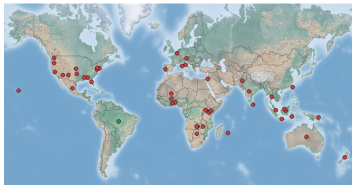
Figure 6. Worldwide distribution of Salvinia molesta D. S. Mitchell, the primary host plant of Cyrtobagous salviniae (Calder & Sands). Red dots represent areas where the plant is considered invasive and the green dot is in its native range.

Salvinia molesta is considered the most invasive Salvinia species and a serious threat to tropical and subtropical aquatic ecosystems worldwide (Douglas-Oliver 1993). Salvinia molesta spreads from fragments of leaves and roots via water currents and on contaminated equipment such as boats and vehicles. It has been found forming dense mats on water surfaces that can thicken up to 1 m deep (Thomas and Room 1986). Beginning in the 1940s, human activities have spread Salvinia molesta to various tropical and subtropical regions of Africa, Asia, Australia, and United States (Figure 6, Thomas and Room 1986). The plant now occurs in more than 30 countries.