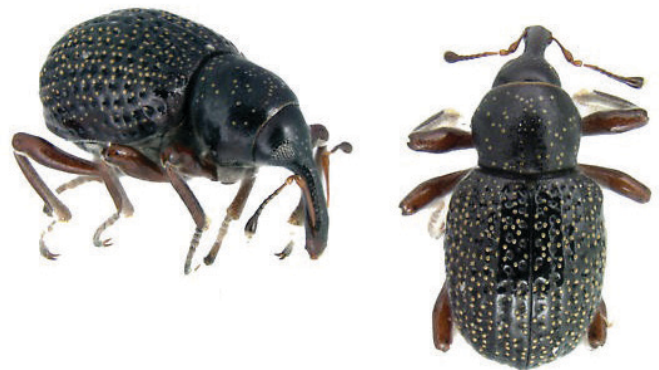
Figure 5. Adult of Cyrtobagous salviniae (Calder & Sands).

The adults of Cyrtobagous salviniae measure 2 to 3.5 mm long and are brown during the first five days following emergence before turning shiny black for the remainder of their life. Similar to other weevil species, they have hardened forewings (called elytra) and membranous hindwings used for flight, along with a long snout on their head (Figure 5). The antennae and chewing mouthparts are located at the apex of the rostrum (snout) as shown in Figure 5.