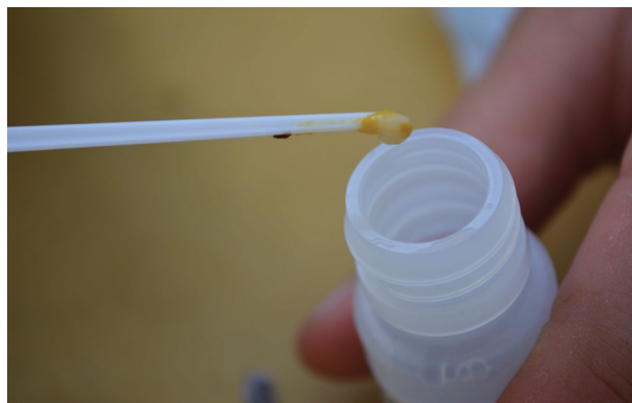
Figure 7. Larvae going into the extraction bottle.