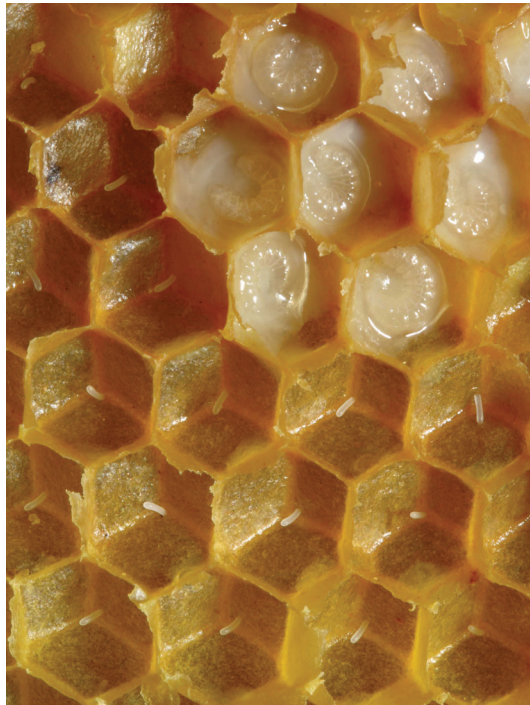
Figure 1. Healthy, glistening Apis mellifera larvae lying in the backs of their cells in the shape of a letter “C” (upper left). They are pearly white in appearance.

from their cells by their adult sisters. A spotty brood pattern is not associated exclusively with European foulbrood, as other conditions can cause a similar brood pattern. However, it can be an additional indicator of European foulbrood infection when observed with larvae showing other signs of disease.