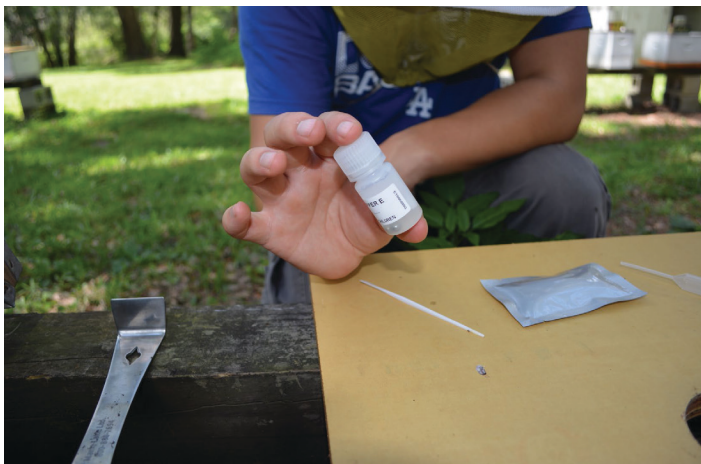
Figure 8. Shaking the extraction bottle for 20 seconds.

10. If no lines are present in the sample well, the test failed, and you will have to re-test.