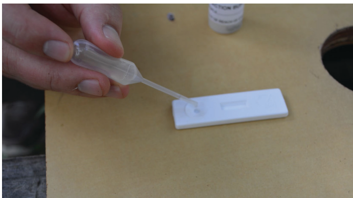
Figure 10. Squeezing two drops of the sample into the sample well with the pipette.