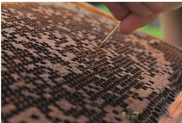
Figure 4. Rope field test for the foulbroods, showing the larval or pupal remains roping out of the cell when a small rod is withdrawn from the cell slowly (suggesting an American foulbrood infection). Larvae killed by European foulbrood do not rope.