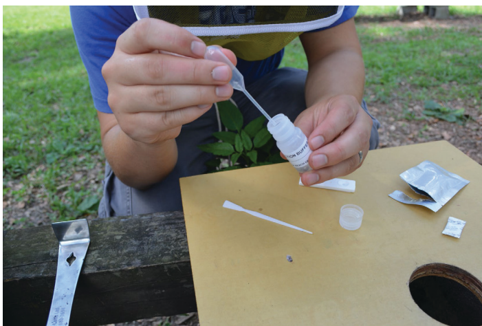
Figure 9. Removing larval sample from the extraction bottle with a pipette.