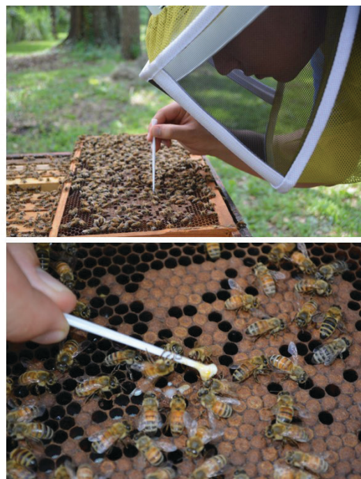
Figure 6. Larvae showing signs of European foulbrood collected with a spatula.