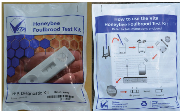
Figure 5. Vita European foulbrood diagnostic test kit.

Detailed instructions for Vita European foulbrood diagnostic kit (Figure 5):