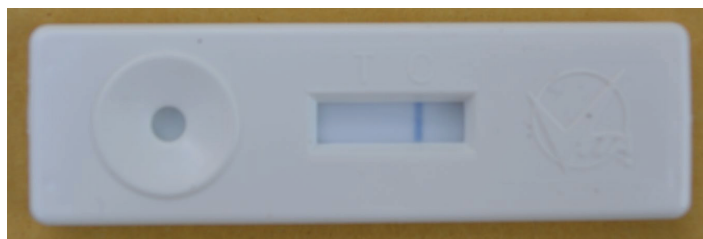
Figure 11. A negative test for European foulbrood with only one line below the C.