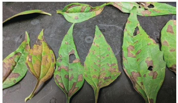
Figure 4. Foliar nematodes cause vein-delimited discoloration, such as the geometric lesions on these echinacea leaves.

The most commonly encountered symptom of endoparasitic feeding is a patchwork browning of foliar tissue (Figure 4). This pattern suggests the nematodes are unable to burrow through leaf veins, requiring them to exit the leaf when food is exhausted within the vein-bordered area and reenter the host elsewhere. The lesions left behind may appear geometric, streak-like, or as speckles depending on the venation patterns of the host plant. On ferns, browning of the pinnules may occur on only one side of the costas (Figure 5). Plants may also exhibit a lack of vigor due to heavy infestation, such as stunted growth and a thin canopy.