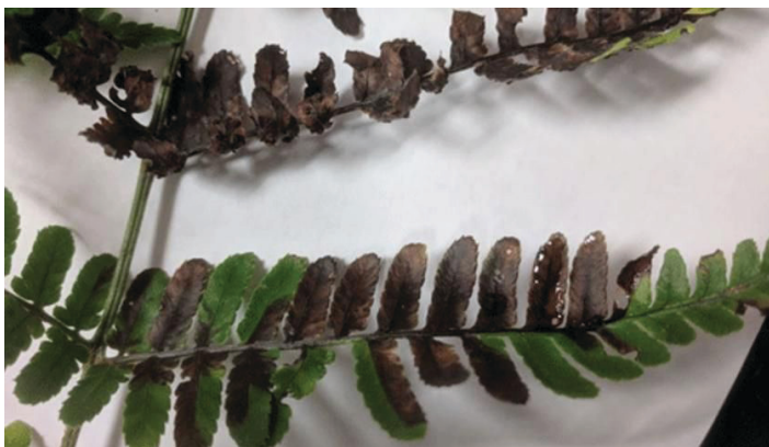
Figure 5. On ferns, foliar nematodes can cause lesions confined to individual pinnae or lobes of pinnae.