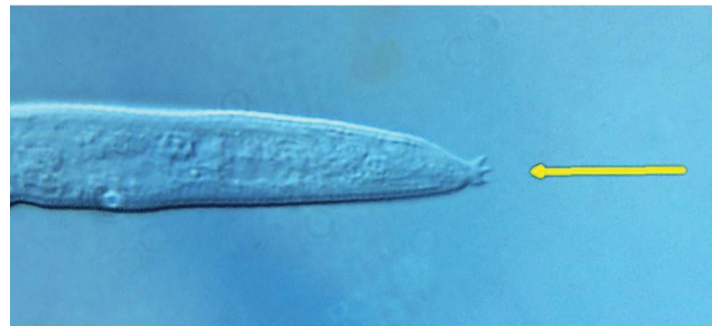
Figure 3. Three-pointed mucro on the tail tip of Aphelenchoides pseudobesseyi .

The females and males of Aphelenchoides differ from their other close relative, Bursaphelenchus , by lacking a vulval flap and bursa (copulatory grasping structures), respectively (Figure 2). A distinctive, though difficult to observe, physical feature of Aphelenchoides is the mucro, which is a miniscule projection from the tip of the nematode's tail (Figure 3). Different species may have a mucro with a single-pointed tip or one that flares into multiple points, and this is commonly used as a diagnostic feature. Foliar nematodes tend to exhibit far more physical activity than their soil-dwelling, plant-parasitic counterparts. Numerous, rapidly undulating roundworms (as seen in this video) can be extracted by allowing shredded leaves to soak in water for a day or two, but a microscope is still necessary to observe them. If species identification is needed, the UF/IFAS Nematode Assay Lab can identify Aphelenchoides and other nematodes to species using morphological and molecular methods.