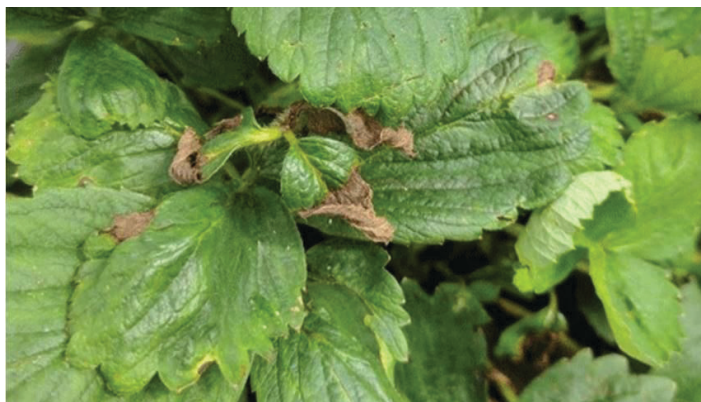
Figure 7. Strawberry leaf crimp caused by Aphelenchoides besseyi .