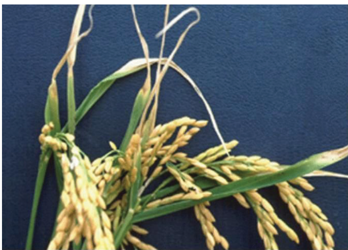
Figure 6. White tip disease caused by Aphelenchoides oryzae , which is characterized by chlorotic leaf tips.

Symptoms may vary between host crops, even when infected with the same species of foliar nematode. For example, angular leafspot of coneflowers and green stem and foliar retention syndrome of soybean are both caused by Aphelenchoides pseudobesseyi (Figure 6). In rice, white tip disease induces chlorotic whitening of the leaf tips, extending 3 to 5 cm down the leaf, which is its diagnostic symptom. Damage to the panicles can result in a significant yield loss (de Jesus et al. 2016). In Brazil, this same species has been recently identified as a major pest of soybean, where it disrupts harvest by causing plants to remain green when they should senesce (Meyer et al. 2017). In addition to a single species causing different symptoms on two hosts, more than one species can be associated with a single host. Aphelenchoides besseyi and Aphelenchoides fragariae are known to cause crimping disease symptoms in strawberries, where the leaves grow crumpled and distorted, and the fruit is likewise stunted and deformed (Figure 7) (Desaeger and Noling 2017).