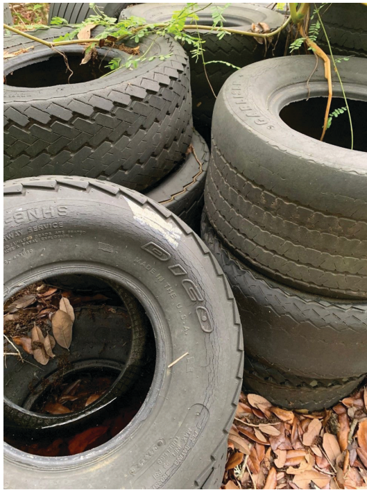
Figure 2. In addition to serving as a potential method of transport, tires that are discarded and left in the environment collect water, providing developmental habitat for container-inhabiting species like Aedes japonicus (Theobald).