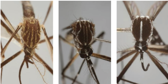
Figure 7. Although similar in appearance to other container-inhabiting species found in Florida, the gold lyre-like pattern on the scutum easily distinguishes Aedes japonicus (Theobald) (left), from Aedes aegypti (center), and Aedes albopictus (right).

Similar in appearance to other invasive but now established Aedes container-inhabiting mosquitoes in the United States, Aedes japonicus is diagnosable by the golden lyre-like pattern on its scutum. In contrast, the yellow fever mosquito, Aedes aegypti (Linnaeus), has a silver lyre on the scutum, and the Asian tiger mosquito, Aedes albopictus , has a silver line down the middle of the scutum (Figure 7).