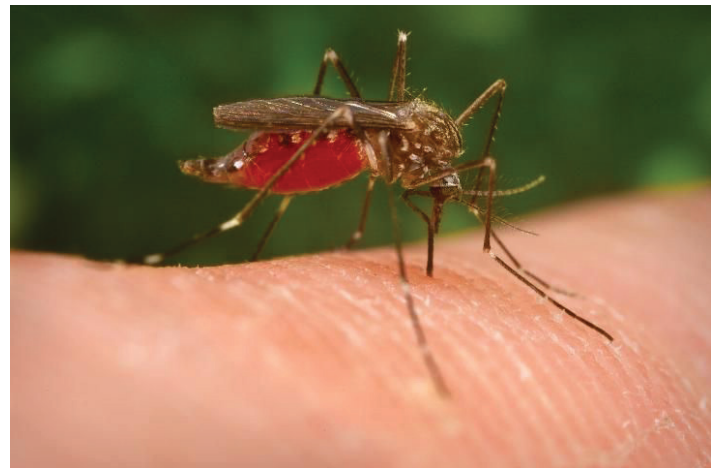
Figure 8. An adult female Aedes japonicus (Theobald) taking a blood meal from a human.

Regardless, Aedes japonicus has been noted as a mosquito pest in areas where it has become established. Although not particularly aggressive, its willingness to take human blood meals (Figure 8) and its reproductive success in areas of human habitation make this species a potential nuisance (Schaffner et al. 2003).