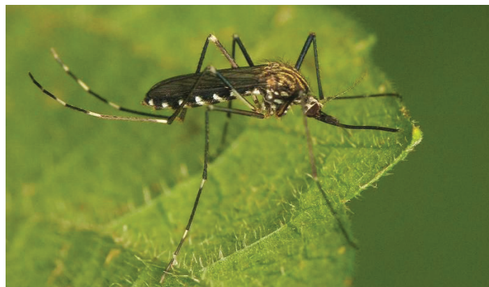
Figure 1. Adult female Aedes japonicus (Theobald) with golden stripes on scutum (dorsal area of thorax).

in shipments of tires arriving from Japan (Laird et al. 1994). International tire trade was also the introduction pathway for another important invasive mosquito species, the Asian tiger mosquito, Aedes albopictus (Skuse), making this the suspected source of Aedes japonicus in many other countries, where adults are often detected in tire yards (Hawley et al. 1987, Versteirt et al. 2009).