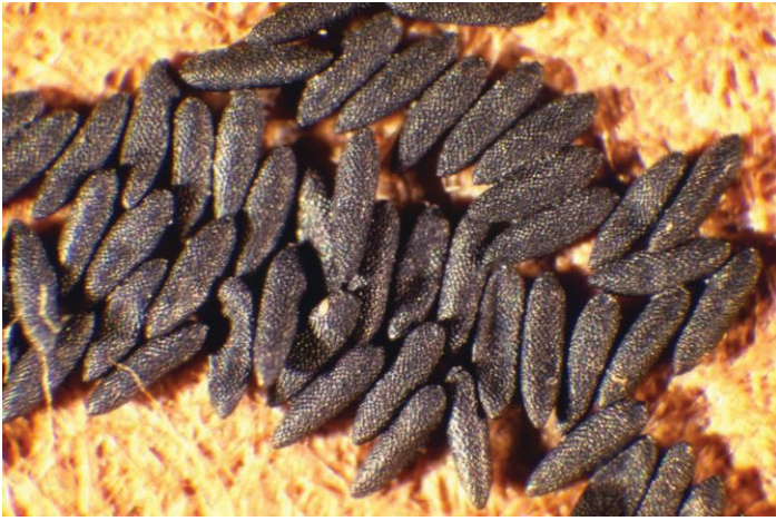
Figure 4. The eggs of Aedes mosquitoes are small (0.5 mm in length), black, and cigar shaped.