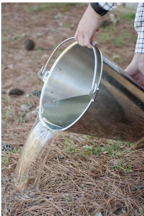
Figure 9. Emptying containers of standing water helps eliminate developmental sites for Aedes japonicus and other container-inhabiting mosquitoes.

Larval surveillance is likely to be more successful than adult surveillance and can be conducted using dark-colored, five-gallon buckets containing leaf infusion (Johnson et al. 2010, Kaufman et al. 2012). An integrated pest management strategy that includes source reduction (Figure 9) and selective use of chemical controls like larvicides can be used to reduce container-inhabiting mosquito populations. Eliminating larval mosquito habitats around homes, particularly water-holding artificial containers (Figure 10), reduces the number of mosquitoes potentially produced around households. Supplementing container elimination with targeted larvicidal treatments of developmental habitats has been demonstrated to successfully reduce the abundance of Aedes japonicus (Ibañez-Justicia et al. 2018).