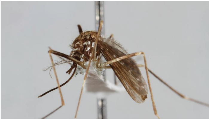
Figure 6. In addition to the golden stripes on the scutum, black and white scales on the sides of the thorax, and black and white banding on the legs, are useful in distinguishing Aedes japonicus (Theobald) from native mosquito species in North America.