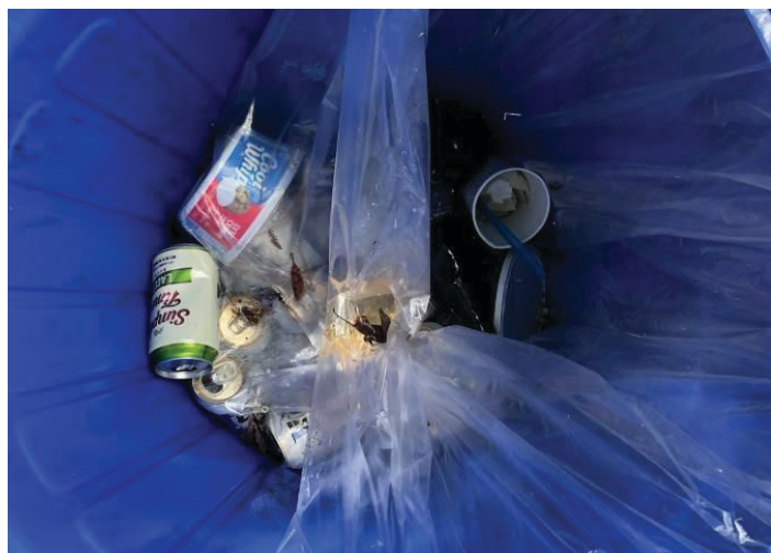
Figure 10. Artificial containers that collect water, such as an uncovered garbage can, may provide developmental habitats for container-inhabiting Aedes mosquitoes like Aedes japonicus .

For more information on managing mosquitoes and personal protective measures, please visit the UF/IFAS Extension Mosquito Control website at https://edis.ifas.ufl.edu/entity/topic/mosquito_control .