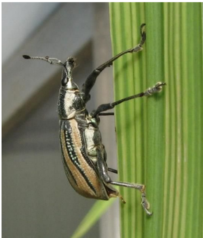
Figure 6. Diaprepes abbreviatus sugarcane root weevil adult on sugarcane.

Diaprepes root weevil (Curculionidae), Diaprepes abbreviatus (L.), is an important pest of sugarcane and citrus in various islands of the Caribbean. It has long been a pest in Florida citrus. In 2010, infestations of the weevil were observed causing damage to Florida sugarcane for the first time (Cherry et al. 2011) (Figure 6).