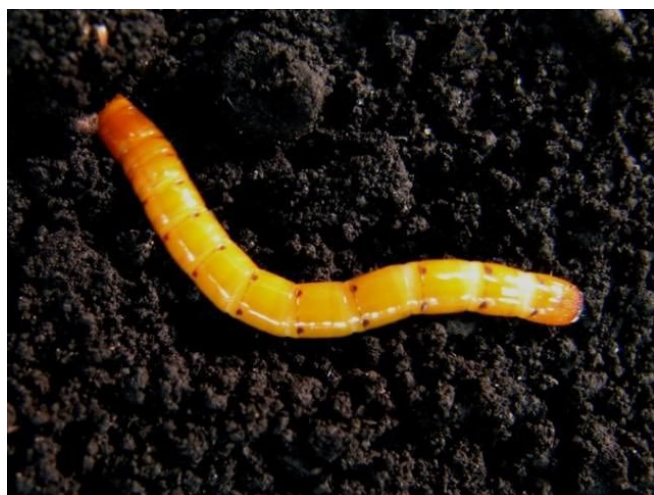
Figure 1. Melanotus communis wireworm (Coleoptera: Elateridae).

Historically, wireworms (Coleoptera: Elateridae) were the first soil insects surveyed causing significant damage in Florida sugarcane (Bregger et al. 1959). Hall (1988) reported twelve species of wireworms in the crop. Past surveys have shown that Melanotus communis (Gyllenhal) is the species causing the most economic damage (Figures 1 and 2).