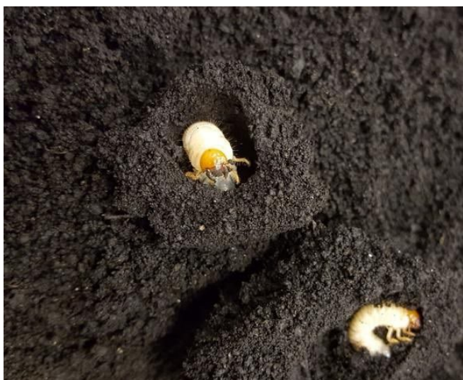
Figure 3. White grubs (Coleoptera: Scarabaeidae).