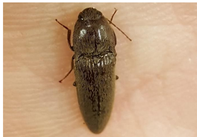
Figure 2. Melanotus communis adult click beetle (Coleoptera: Elateridae).