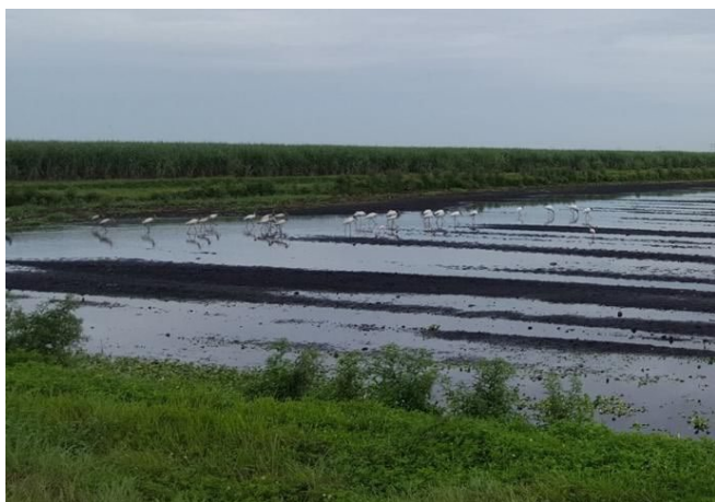
Figure 9. Wood storks foraging in a naturally flooded sugarcane field.

indirectly by exposing them to predation, often by diverse and abundant birds (Figure 9).