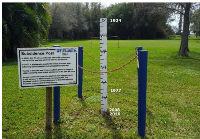
Figure 8. Subsidence post at the UF/IFAS EREC in Belle Glade, FL. Note: Post marks show soil depth in previous years. This may not be typical of other areas, because it has no crops and is drained most of the year.

Two factors have increased flooding, which is effective in reducing soil insect populations, in the Everglades Agricultural Area (EAA). (See "Management by Flooding," below.) Best management practices (BMP) including water held during the rainy season to reduce phosphorous discharge is the first factor. Second is organic matter oxidation due to the drainage of organic (muck) soils. This has led to the prevalence of shallow soils in the EAA, and these shallow soils are frequently flooded (Jennewein et al. 2016). This phenomenon of soil subsidence has been documented and researched by soil and water scientists at the Everglades Research and Education Center for decades (Figure 8).