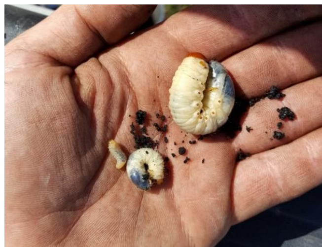
Figure 4. Diaprepes grub (left), a typical scarab grub (middle), and a Tomarus subtropicus grub (right). Typical size differences.

In our 2015 and 2016 surveys, we observed four of the six scarab grub species ranging from 20% to 30% in relative abundance. Cyclocephala parallela Casey and Phyllophaga latifrons (LeConte) are occasional pests of Florida sugarcane; Anomala marginata (F.) and Dycinetus morator (F.) are not. Gordon and Anderson (1981) reported Euphoria sepuchralis (F.) to be associated with Florida sugarcane although not causing damage. We did not find this latter species in any of our samples. Of special interest are our findings with T. subtropicus (Figures 4 and 5).