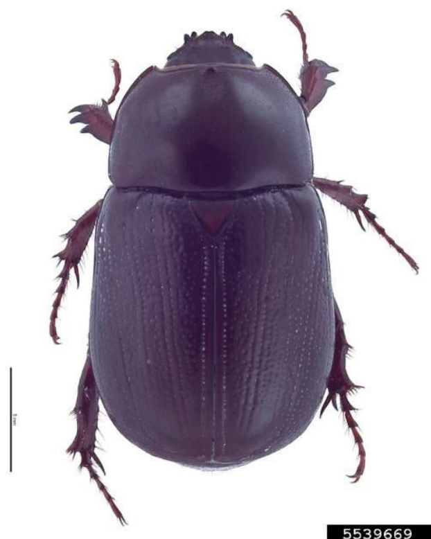
Figure 5. Tomarus subtropicus adult female (Coleoptera: Scarabaeidae).