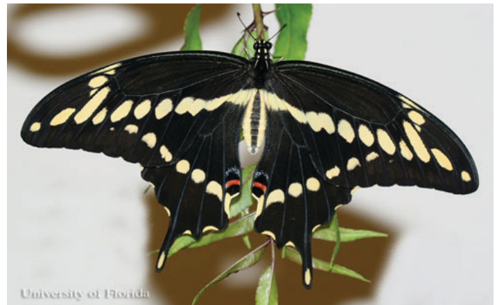
Figure 1. Adult giant swallowtail, Papilio cresphontes Cramer, dorsal view.

the entire state of Florida. It is active throughout the year in south Florida, and is common in north Florida, except in January and February.