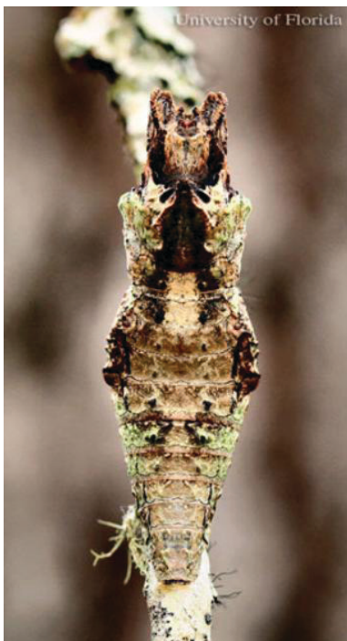
Figure 17. Dorsal view of a chrysalis of the giant swallowtail, Papilio ctesiphontes Cramer.