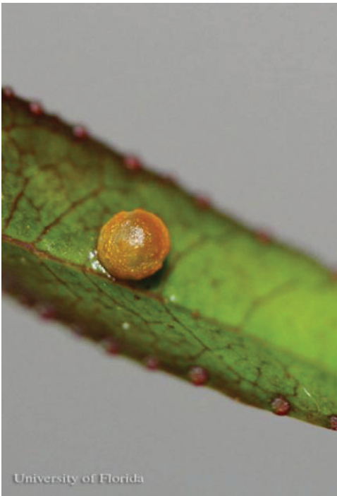
Figure 13. Dorsal view on an egg of the giant swallowtail, Papilio cresphontes Cramer, on Hercules club, Zanthoxylum clava-herculis L.

Mated females usually lay their eggs singly on the upper surface of leaves of host plants. The 1 to 1.5 mm spherical eggs are cream to brown and typically have an irregular coating of an orange secretion that is reminiscent in appearance of orange peel. Larvae progress through five instars. Larval feeding usually takes place during the night.