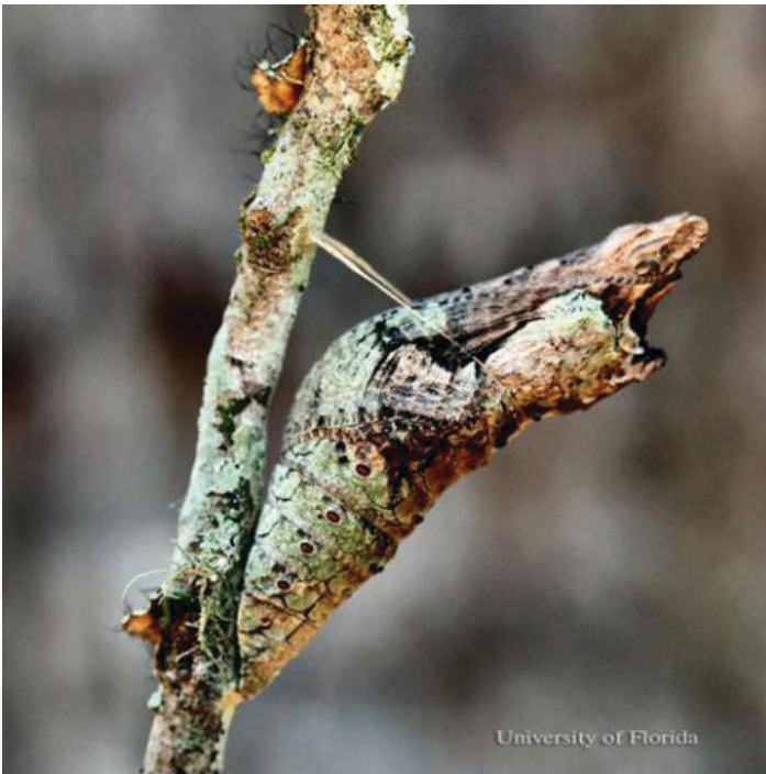
Figure 16. Lateral view of a chrysalis of the giant swallowtail, Papilio ctesiphontes Cramer.