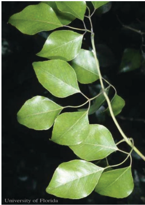
Figure 20. Sea torchwood, Amyris elemifera L., a host of the giant swallowtail, Papilio cresphontes Cramer.