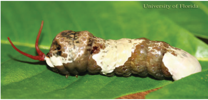
Figure 23. Mature larva of the giant swallowtail, Papilio cresphontes Cramer, with everted osmeterium. Head is to the left.