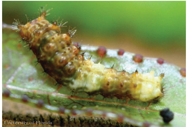
Figure 6. Three-day-old larva of the giant swallowtail, Papilio cresphontes Cramer. Head is to the left.