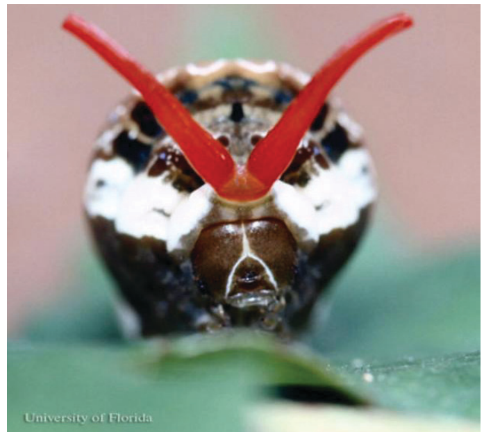
Figure 11. Frontal view of larva of the giant swallowtail, Papilio cresphontes Cramer, showing the osmeterium everted and possibly resembling the forked tongue of a snake.