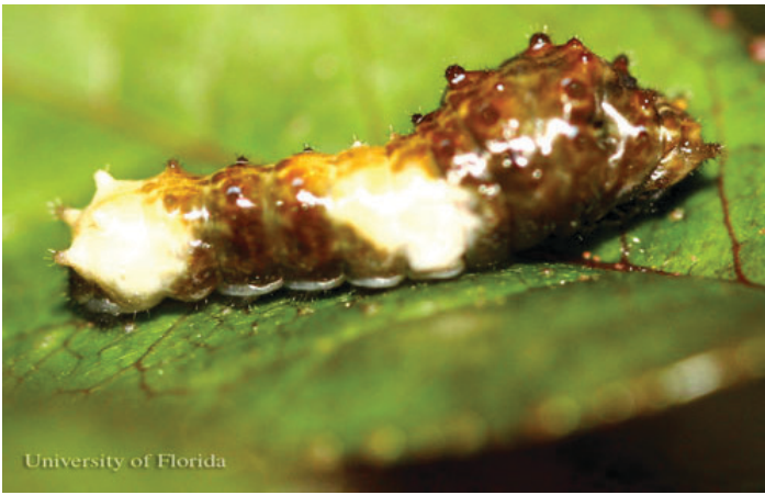
Figure 7. Five-day-old larva of the giant swallowtail, Papilio cresphontes Cramer. Head is to the right.