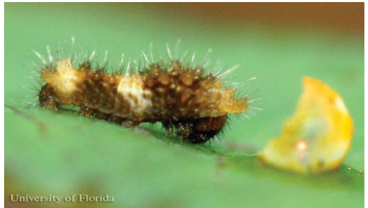
Figure 5. Newly hatched larva of the giant swallowtail, Papilio cresphontes Cramer, with partially eaten egg shell. Head is to the right.

The younger instars are predominantly black or brown with a white saddle, while the older instars are mottled dark brown with a posterior that is white or cream-colored. Younger instars also have setae (hairs) on prominent knobs. Setae are lacking and knobs are reduced in older instars.