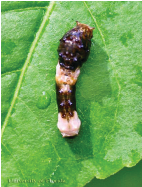
Figure 3. Young larva of the giant swallowtail, Papilio cresphontes Cramer, (illustrating bird dropping mimicry) on Ptelea trifoliata leaf. Head is to the top.

The five larval instars differ in appearance but they all share a resemblance to bird droppings. Younger instars are more realistic bird-dropping mimics because of their smaller size. Mature larvae usually rest on stems or leaf petioles (Hagen 1999), but younger larvae often rest in plain view on the upper surfaces of leaves where bird droppings would be expected.