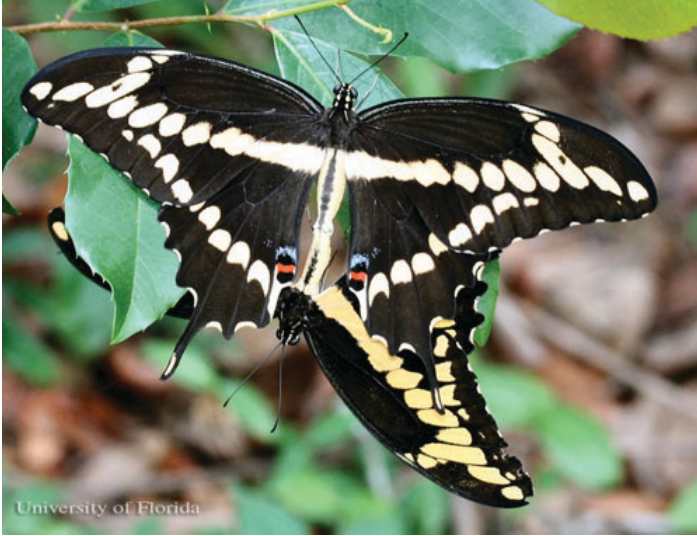
Figure 12. A mating pair of the giant swallowtail, Papilio cresphontes Cramer, with the female above.

and leisurely, and the butterflies may glide long distances between wing beats. Courtship and copulation occur in the afternoon.