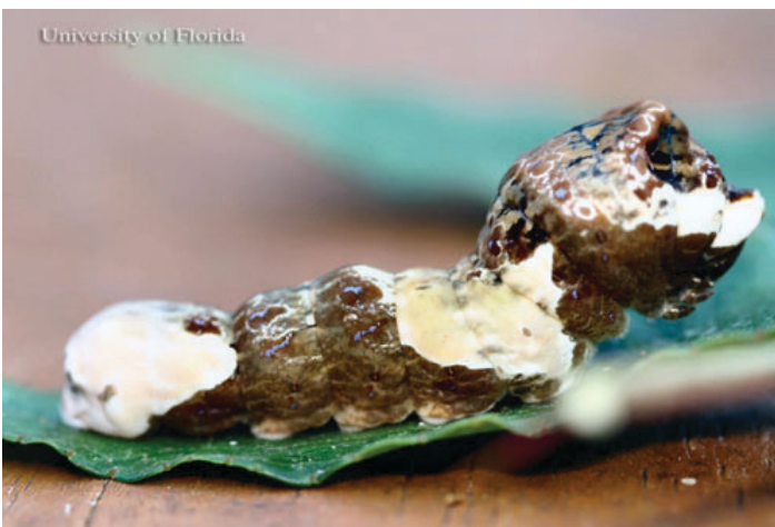
Figure 9. Larva of the giant swallowtail, Papilio cresphontes Cramer, in snake-like "striking" pose. Head is to the right.