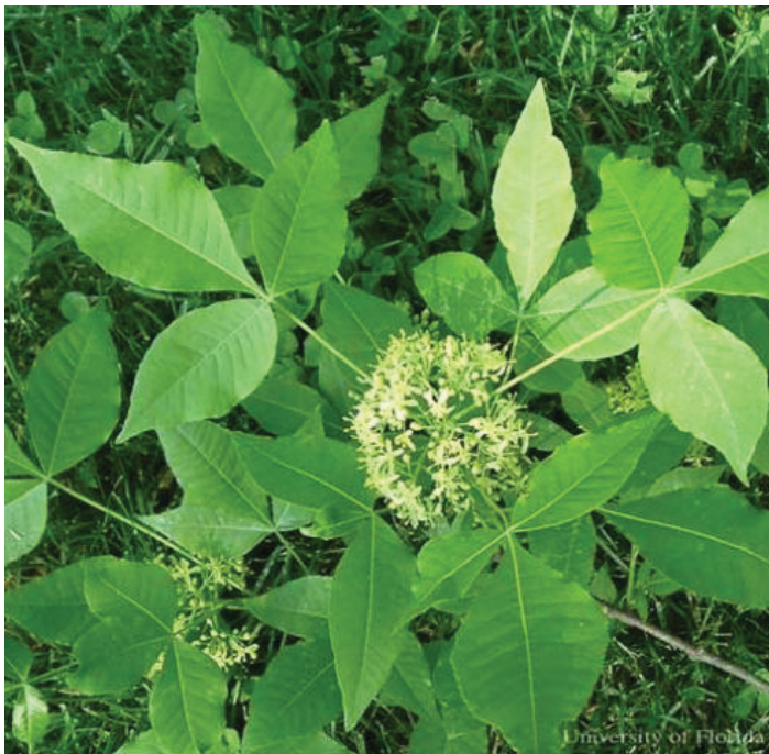
Figure 21. Hoptree, Ptelea trifoliata L., in bloom; a host of the giant swallowtail, Papilio cresphontes Cramer.