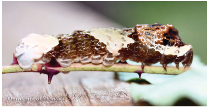
Figure 4. Full-grown larva of the giant swallowtail, Papilio cresphontes Cramer. Head is to the right.

The younger instars are predominantly black or brown with a white saddle, while the older instars are mottled dark brown with a posterior that is white or cream-colored. Younger instars also have setae (hairs) on prominent knobs. Setae are lacking and knobs are reduced in older instars.