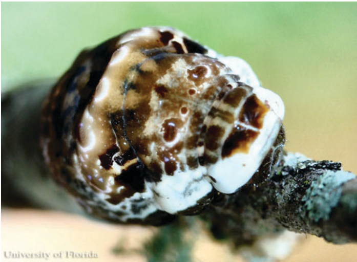
Figure 8. Mature larva of the giant swallowtail, Papilio cresphontes Cramer, showing the greatly swollen thorax that resembles a snake head. The larva's head is to the right.

It has been suggested that the older instars resemble small snakes.