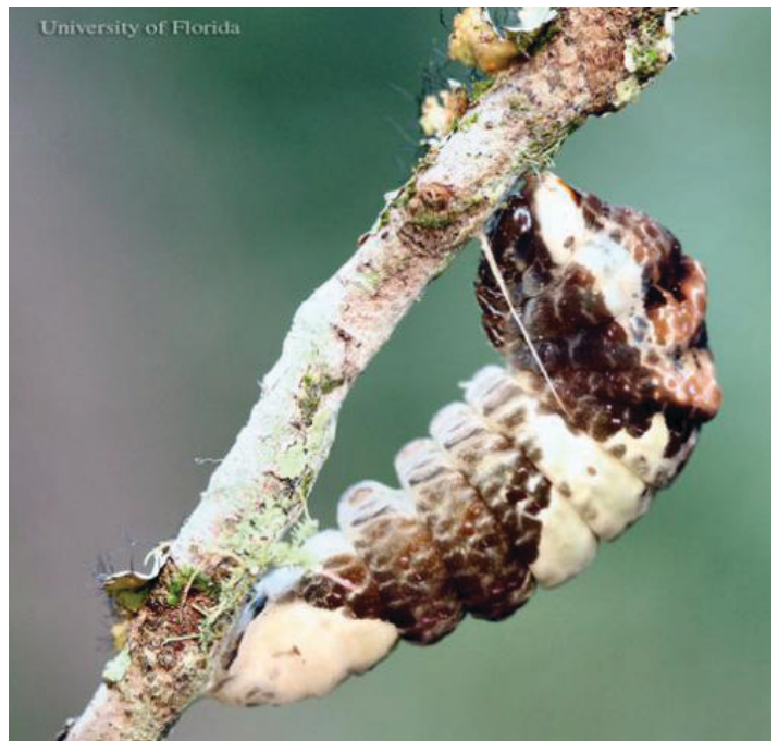
Figure 15. Prepupa of the giant swallowtail, Papilio cresphontes Cramer.

Larvae may pupate on small twigs on the host plant on which they were feeding or they may travel a short distance to a vertically-oriented structure, such as a fence or other plant. The brownish chrysalis is typically oriented at 45° to the pupation substrate, its posterior end attached directly to a silken pad on the substrate by its Velcro-like cremaster, and its anterior end attached via a thin silken thread to the substrate. At least two, and probably three, generations occur each year in Florida.