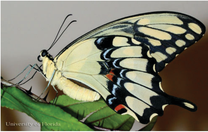
Figure 2. Adult giant swallowtail, Papilio cresphontes Cramer, with wings closed.

from all other swallowtails found in Florida except for the endangered Schaus' swallowtail , Papilio aristodemus ponceanus , which is confined to the Florida Keys. The giant swallowtail can be distinguished from the Schaus' swallowtail by the yellow-filled "tails" (Schaus' swallowtail tails are all black), and the small, brick-red patch just interior to the blue median band on the ventral hind wing.