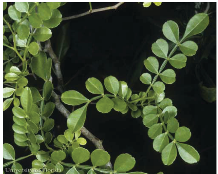
Figure 19. Lime pricklyash, Zanthoxylum fagara [L.] Sarg., a host of the giant swallowtail, Papilio ctesiphontes Cramer.