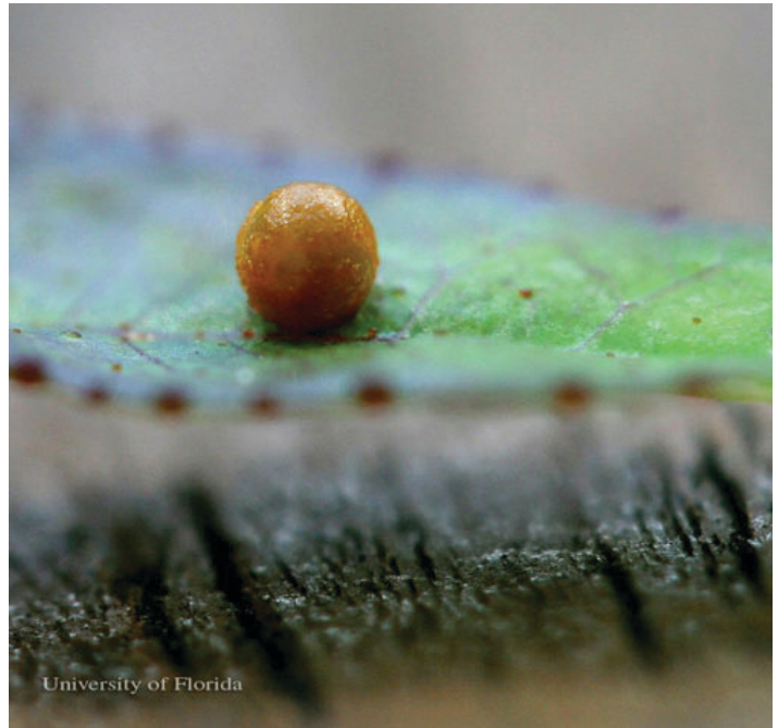
Figure 14. Lateral view on an egg of the giant swallowtail, Papilio cresphontes Cramer, on Hercules-club, Zanthoxylum clava-herculis L.

Larvae may pupate on small twigs on the host plant on which they were feeding or they may travel a short distance to a vertically-oriented structure, such as a fence or other plant. The brownish chrysalis is typically oriented at 45° to the pupation substrate, its posterior end attached directly to a silken pad on the substrate by its Velcro-like cremaster, and its anterior end attached via a thin silken thread to the substrate. At least two, and probably three, generations occur each year in Florida.