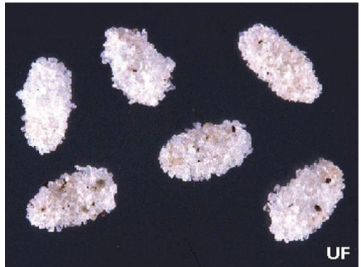
Figure 4. Pupae of the cat flea, Ctenocephalides felis (Bouché).

The cat flea life cycle is one of complete metamorphosis, involving the stages of an egg, larva, pupa, and adult. This cycle usually lasts 30 to 75 days, yet may vary due to external factors, such as temperature and humidity.