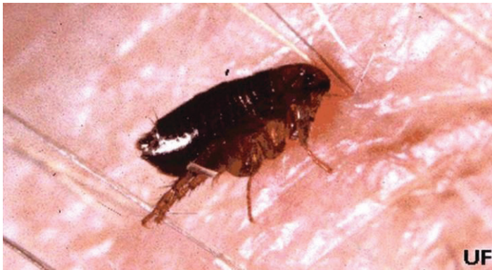
Figure 1. Adult cat flea, Ctenocephalides felis (Bouché).

There are over 2,000 described species of fleas. The most common domestic flea is the cat flea, Ctenocephalides felis (Bouché). The adult cat flea, unlike many other fleas, remains on the host. Adults require a fresh blood meal in order to reproduce.