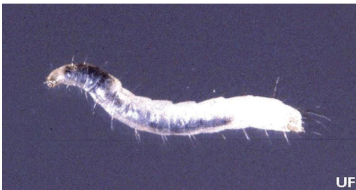
Figure 3. Larva of the cat flea Ctenocephalides felis (Bouché).