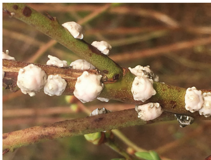
Figure 1. Florida wax scale on blueberry stems.

substance called honeydew that can promote the growth of a black fungus known as sooty mold, which reduces photosynthesis, further weakening the plant.