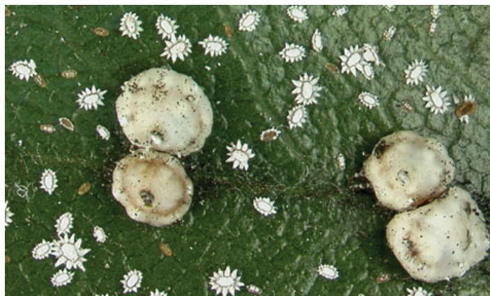
Figure 4. Wax scale adults and nymphs.

Biological control agents include parasitic wasps in some parts of the United States such as Coccophagus lycimnia Walker, Metaphycus eruptor Howard, and Scutellista cyanea Motschulsky (Drees et al.).