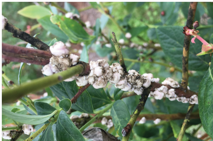
Figure 2. Florida wax scale on blueberry stems.

when the nymphs move from under the female to settle on other stems or leaves, and begin to feed and secrete a wax coating. Once the nymph inserts its mouthpart into the plant and begins to feed, it remains in place for the rest of its life. There are two additional instars in the nymph phase, and after laying eggs, the adult dies. Each generation lasts between 3 and 4 months (Sharma and Buss 2018).