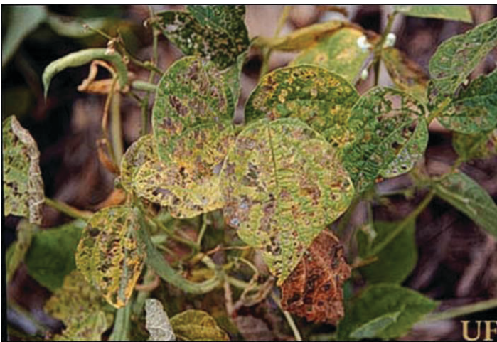
Figure 4. Mexican bean beetle damage.

The insect in both the larval and adult stages will feed upon the leaves, flowers and pods of the bean plant, but the greatest amount of injury is done to the leaves. The larvae cause more damage than the adult beetles. They feed by clinging to the lower surface of the leaves and eating irregular sections of the lower leaf surface. The upper surface of the leaves dries out after the lower section is injured, giving a lace-like, skeletonized appearance. Occasionally blossoms, and in many cases small pods, will be entirely destroyed.