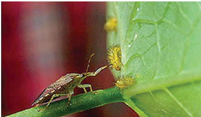
Figure 5. A Mexican bean beetle larva, Epilachna varivestis Mulsant, becomes a meal for the spined soldier bug instead.

Ten species of parasitoids are prevalent in soybeans during the vegetative stages, but only the tachinid fly Paradexodes epilachnae and the eulophid wasp Pediobius foveolatus seem to be promising in reducing the number of bean beetles. Because Paradexodes epilachnae is not native, it is necessary to import it when the Mexican bean beetle is an important pest. Pediobius foveolatus is a parasitoid of epilachnine beetles from India. It parasitizes Mexican bean beetle larvae during the growing season, but fails to overwinter for lack of diapause capability and/or available host material. The annual releases of this insect, if conducted early enough and in conjunction with establishment of nurse plot areas of snap beans in a widespread manner, are capable of suppression of the Mexican bean beetle on soybeans.