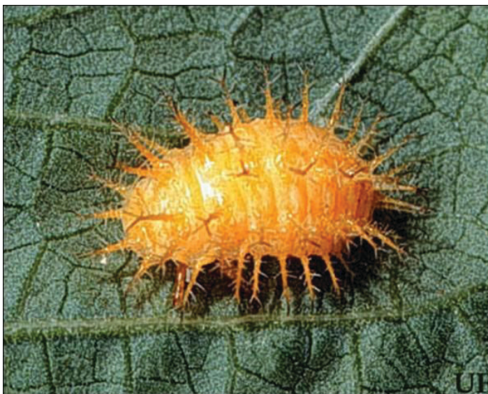
Figure 2. Larva of Mexican bean beetle, Epilachna varivestis Mulsant.