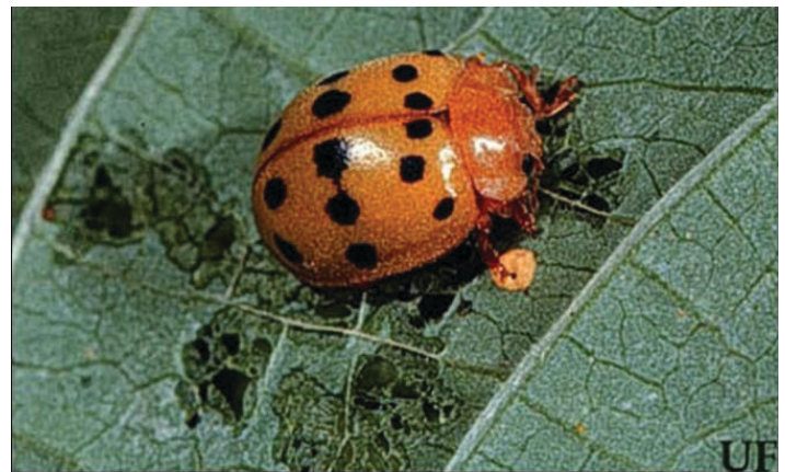
Figure 3. Adult Mexican bean beetle, Epilachna varivestis Mulsant.

The adult is oval in outline, and about 6 to 7 mm ( \sim\frac{1}{4} in) in length. The newly emerged adult is of a straw or cream-yellow color. Shortly after emergence, eight black spots of variable size appear on each wing cover, arranged in three longitudinal rows on each wing cover. The adults darken with age until they become an orange-brown with a bronze tinge, at which time the black spots are less conspicuous. The males are slightly smaller than the females. Males can be distinguished from females by having a small notch on the ventral side of the last abdominal segment.