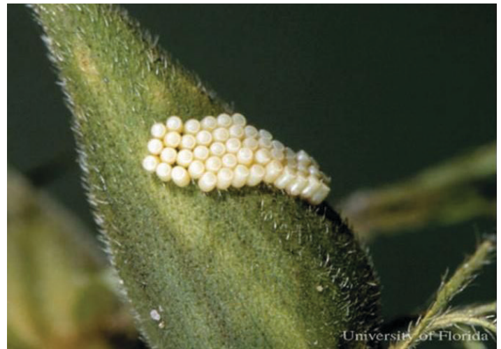
Figure 4. Eggs of the southern green stink bug, Nezara viridula (Linnaeus).

shaped with flat tops with a disc shaped lid. There are 28 to 32 finger-like projections around the lid called chorial processes. The egg is \frac{1}{20} of an inch in length and \frac{1}{29} inch wide. The incubation time for the eggs is five days in the summer and two to three weeks in early spring and late fall. As incubation continues the eggs turn pinkish in color.