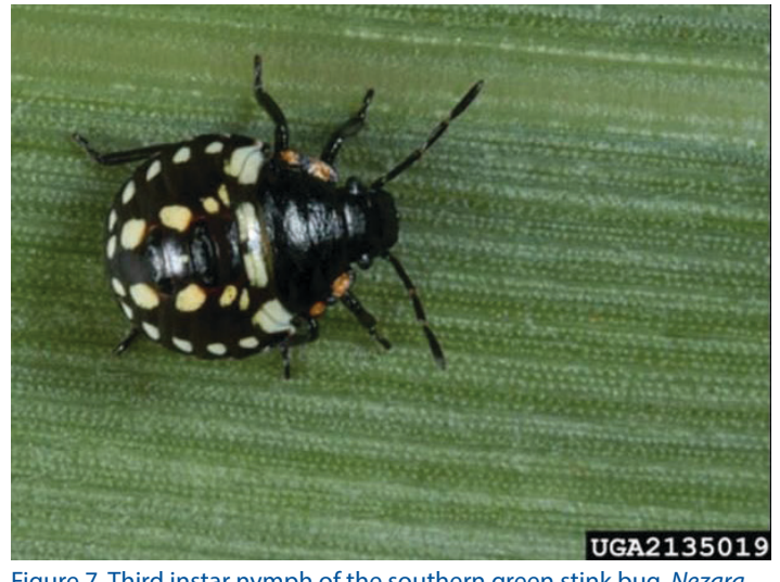
Figure 7. Third instar nymph of the southern green stink bug, Nezara viridula (Linnaeus).

The southern green stink bug can complete its life cycle in 65 to 70 days. It is most prevalent during the periods of October through December and again in March through April. The southern green stink bug is known to have up to four generations per year in warm climates. The southern green stink bug overwinters as an adult, and hides in the bark of trees, leaf litter, or other locations to obtain protection from the weather. As spring temperatures begin to warm, the southern green stink bug moves out of the winter cover and begins feeding and oviposition.