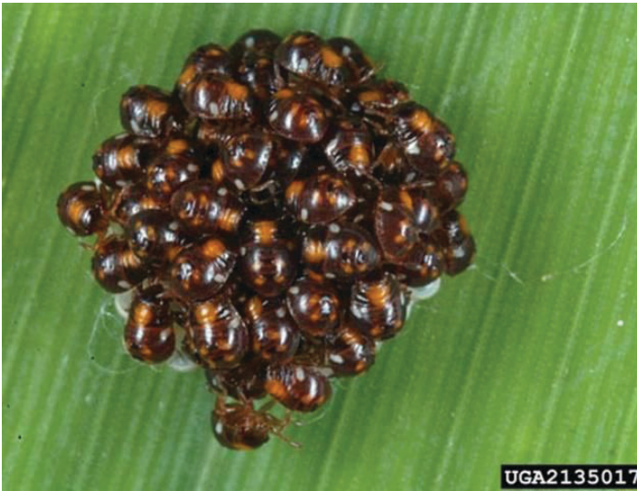
Figure 5. Recently emerged first instar nymphs of the southern green stink bug, Nezara viridula (Linnaeus).