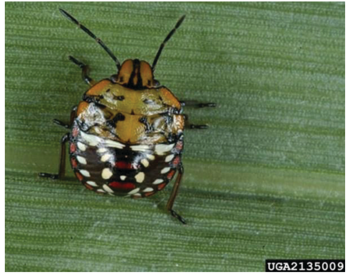
Figure 8. Fourth instar nymph of the southern green stink bug, Nezara viridula (Linnaeus).