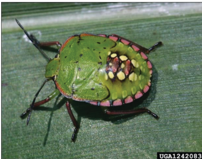
Figure 9. Fifth instar nymph of the southern green stink bug, Nezara viridula (Linnaeus).