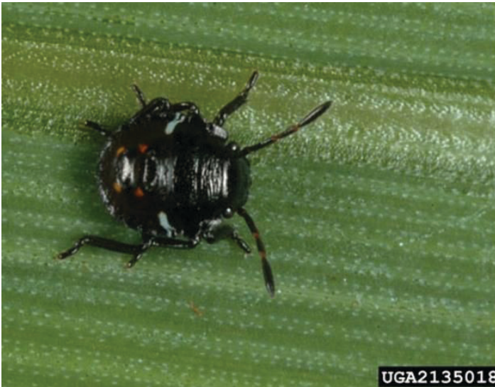
Figure 6. Second instar nymph of the southern green stink bug, Nezara viridula (Linnaeus).