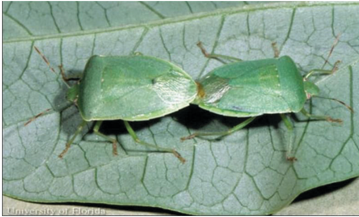
Figure 2. Mating pair of adult southern green stink bugs, Nezara viridula (Linnaeus).

masses is not uncommon. A female southern green stink bug could lay as many as 260 eggs over her life span.