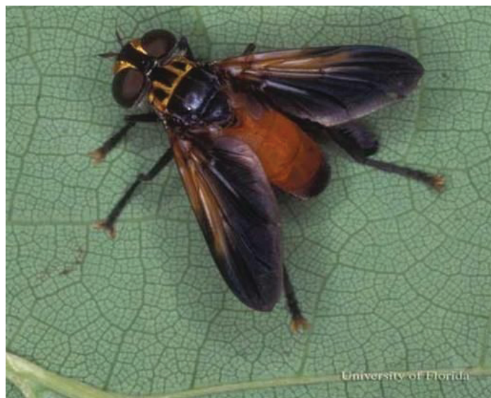
Figure 11. Adult Trichopoda pennipes , a tachinid fly that parasitizes the southern green stink bug, Nezara viridula (Linnaeus).

Parasitoids, usually wasps and flies, provide biological control of the southern green stink bug. In Florida a tachinid fly, Trichopoda pennipes , parasitizes adults and nymphs; and a wasp, Trissolcus basalis , parasitizes eggs. These two parasites have also been introduced as biological control agents in other areas, such as Australia and Hawaii, to control the southern green stink bug. California used Trissolcus basalis in an effort to control its southern green stink bug population.