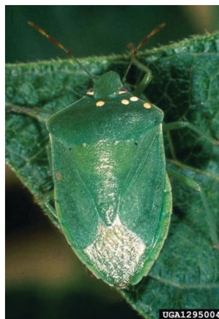
Figure 12. Adult southern green stink bug, Nezara viridula (Linnaeus), with four visible parasitoid eggs.