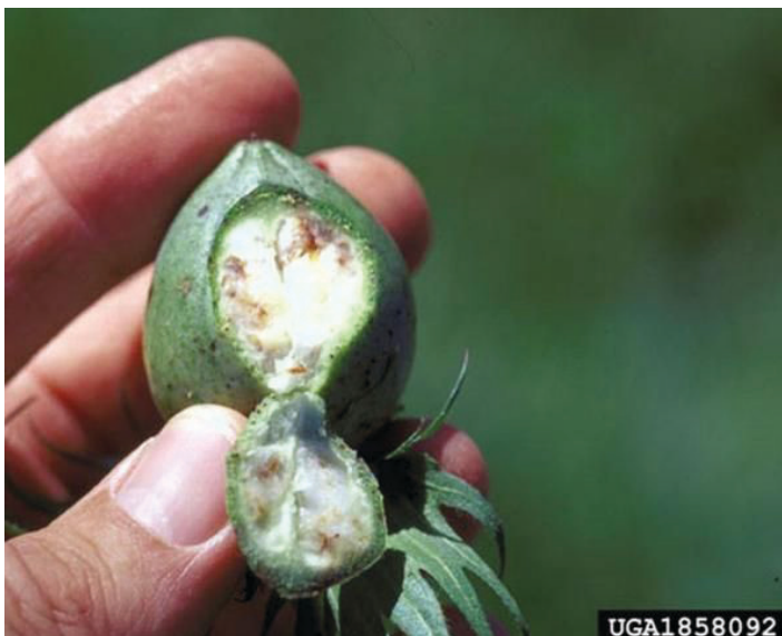
Figure 10. Feeding damage to cotton boll by the southern green stink bug, Nezara viridula (Linnaeus).