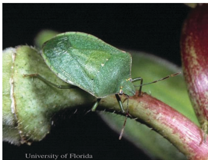
Figure 1. Adult southern green stink bug, Nezara viridula (Linnaeus).

The southern green stink bug is believed to have originated in Ethiopia. Its distribution now includes the tropical and subtropical regions of Europe, Asia, Africa, and the Americas. In South America, it is expanding its range to Paraguay, south Argentina, and toward the northeast of Brazil, due to expanding soybean production (Panizzi 2008). In North America, it is limited primarily to the southeastern United States, Virginia to Florida in the east, Ohio and Arkansas in the midwest, and to Texas in the southwest. It is also established in Hawaii and California (Capinera 2001).