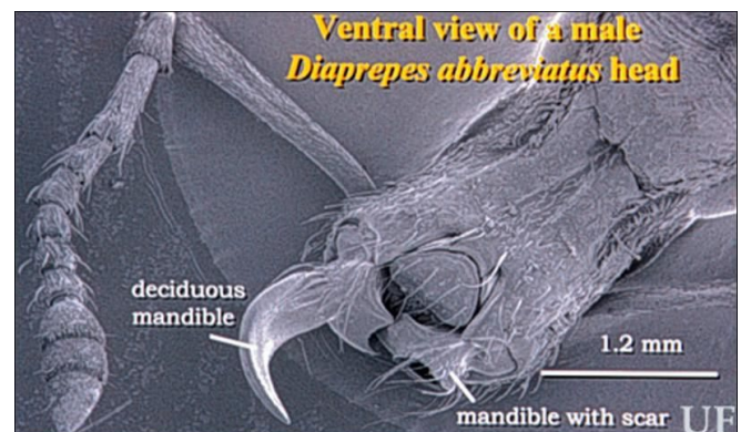
Figure 2. SEM of deciduous mandible scar of Diaprepes abbreviatus (L.).