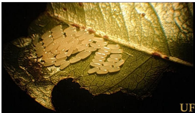
Figure 3. Egg mass of Diaprepes abbreviatus (L.), on citrus leaf.