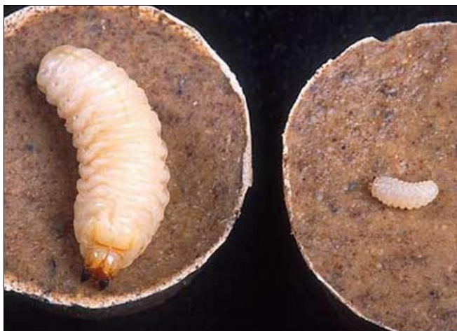
Figure 5. Young (right) and older (left) larvae of the diaprepes root weevil, Diaprepes abbreviatus (Linnaeus), on cakes of an artificial diet developed by the USDA-ARS.