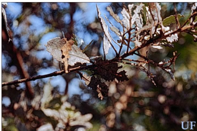
Figure 6. Damage—notching on leaves—by Diaprepes abbreviatus (L.).