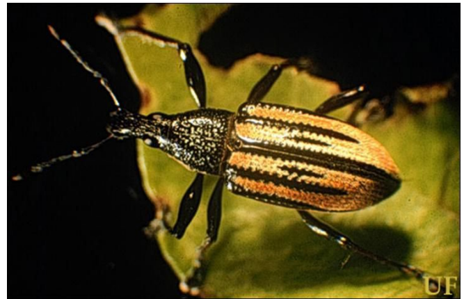
Figure 1. Adult Diaprepes abbreviatus (L.).

The adult weevils (Figure 1) vary in length from 0.95 to 1.90 cm (3/8 to 3/4 inch). They are black, and overlaid by minute white, red-orange, and/or yellow scales on the elytra (wing covers). These scales are often rubbed off of the tops of ridges on the elytra giving the appearance of black stripes on a light colored background. Adults emerging from pupae in the soil are armed with a pair of deciduous mandibles (Figure 2) that break off as they tunnel through the soil to get above ground. Scars at the site where the deciduous mandibles break off are visible under a microscope.