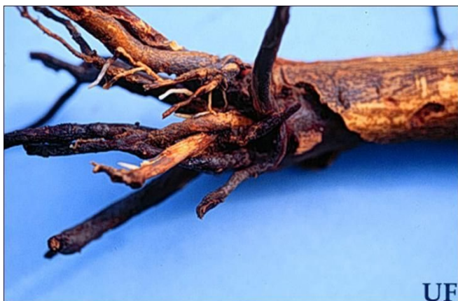
Figure 7. Damage to citrus tree roots by Diaprepes abbreviatus (L.).

The larvae of Diaprepes abbreviatus are found in the soil where they feed on the roots of the host (Figure 7). They will often girdle the taproot, impeding the ability of the plant to take up water and nutrients resulting in plant mortality. In addition, this type of injury provides an avenue for root rot infections by Phytophthora fungus. Young hosts can be killed by a single larva, while several larvae can cause serious decline of older, established hosts. Because larvae are below ground, it is difficult to detect them before decline of above ground portions of the host is observed.