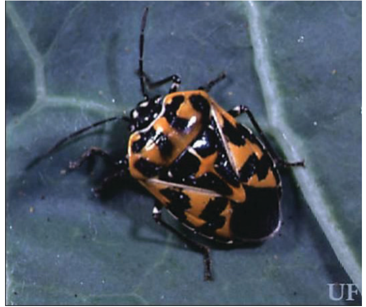
Figure 4. Adult harlequin bug, Murgantia histrionica (Hahn).

the absence of these favorite hosts, tomato, potato, eggplant, okra, bean, asparagus, beet, weeds, fruit trees, and field crops may be eaten.