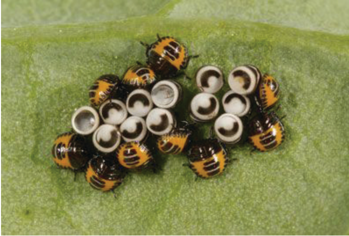
Figure 2. Eggs and nymphs of the harlequin bug, Murgantia histrionica (Hahn).

to black (in the fifth instar). Antennae of first instars are colorless and darken to black with each progressive molt. The thorax ranges from pale orange in the first instars to a final pattern of scarlet, white, yellow, and black in the fifth or sixth instars. The abdomen coloration progresses similarly to that of the thorax, getting showier with each progressive molt.