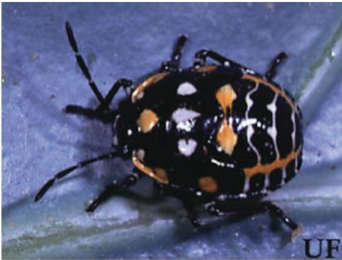
Figure 3. Nymph of the harlequin bug, Murgantia histrionica (Hahn).

The adults are gaudy, red-and-black-spotted stink bugs about 9.5 mm (~ \frac{1}{2} in) long, with flat and shield-shaped bodies. At rest, the front pair of wings overlap and the insect's back appears to be marked with a distinct "X."