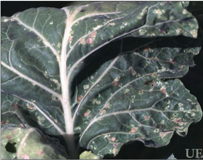
Figure 5. Feeding injury by harlequin bug, Murgantia histrionica (Hahn).