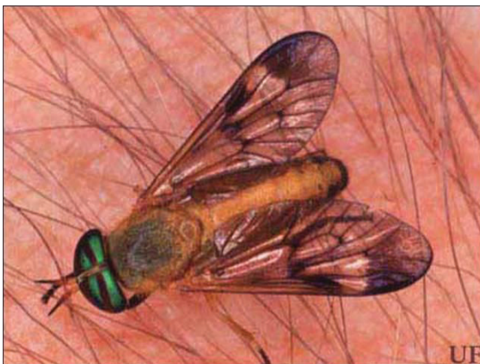
Figure 7. Adult yellow fly, Diachlorus ferrugatus (Fabricius).