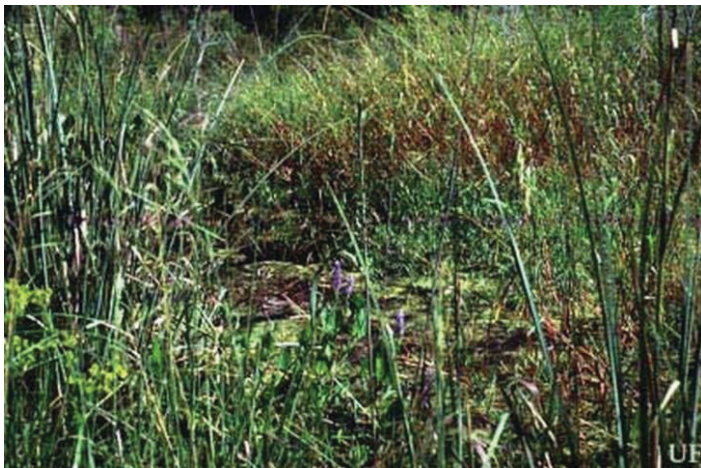
Figure 3. Typical habitat used by biting flies for egg laying.