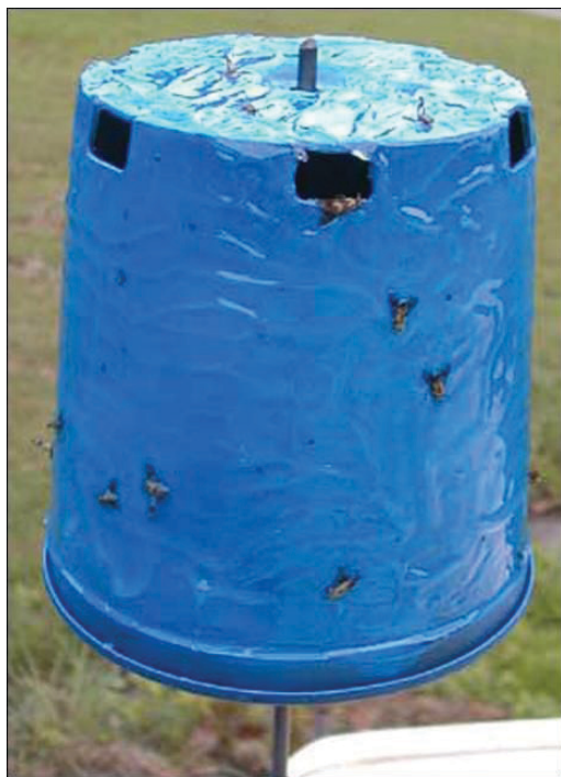
Figure 12. A blue cylinder covered with sticky material makes an effective removal trap for deer flies and other tabanids when attached to a slow moving object (< 7 mi/hr).