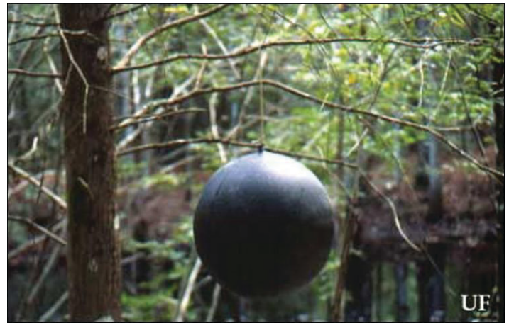
Figure 9. Ball trap, black sphere, used to lure biting flies.