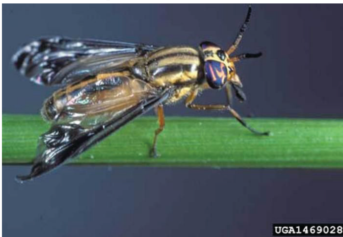
Figure 6. Adult female deer fly, Chrysops pikei Whitney.

the flies mate. Mating starts with the male pursuing the female. Mating is initiated in the air and completed on the ground. The female then deposits an egg mass and is ready to seek a host. Adult Tabanidae are large flies with broad bodies and bulging eyes. The males are easily differentiated from female flies, because eyes are contiguous in the males and widely separated in the females. The antennae are three segmented. The thorax and abdomen are covered with fine hairs. Deer flies range in length from 7 to 10 mm while horse flies are from 10 to 25 mm (~ \frac{3}{8} to 1 in). The deer flies are yellow to black, have stripes on the abdomen, and possess mottled wings with dark patches. Yellow flies are yellowish with the same body shape of deer flies but have dark purple to black eyes marked with fluorescent green lines. Horse flies are black to dark brown with green or black eyes. Adult deer flies have apical spurs on the hind tibiae that are not present in horse flies.