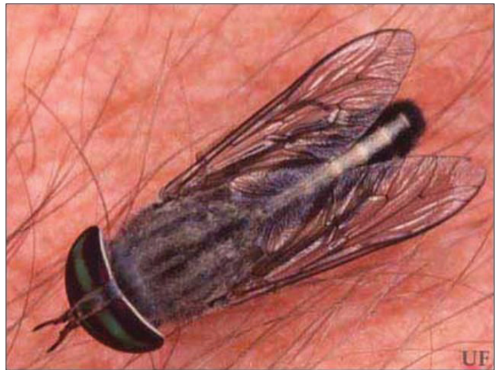
Figure 8. Adult horse fly, Tabanus sp.