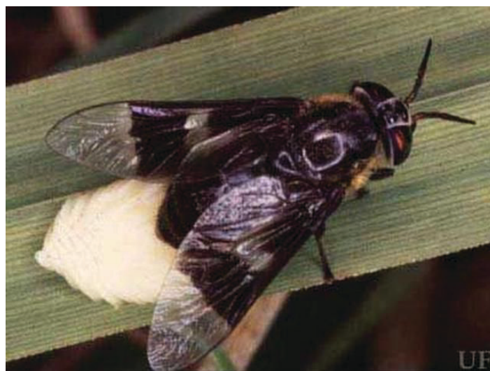
Figure 1. An adult female deer fly, Chrysops cincticornis, laying eggs.

Horse flies and deer flies are world wide in distribution. They are, however, unreported in Hawaii, Greenland, and Iceland. In the United States, Florida produces a large population of tabanids because of the availability of suitable habitat. Florida's mild climate and large, permanently wet and undeveloped areas provide good breeding areas.