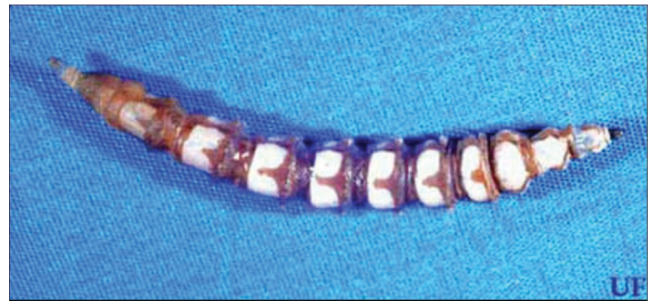
Figure 4. Typical larva of a Tabanidae species.

or green depending on the species. Black bands are found around each segment of the body in many species. The larva breathes through a tracheal siphon located at their posterior end. The larva has a small head and 11 to 12 additional segments. Larvae pass through six to nine stadia. The time spent in the larval stage can last from a few months to a year. The larvae of Chrysops feed upon organic matter in the soil. Tabanus spp. feed upon insect larvae, crustaceans, and earthworms. Even though the Tabanus spp. are considered to be carnivorous and cannibalistic, reports of as many as 120 larvae per square yard have been found. The larva moves into the upper 2.5 to 5.0 cm ( \sim 1 to 2 in) of the soil, where it is drier, when it is ready to pupate. Within two days after moving to the surface the pupal stage is reached.