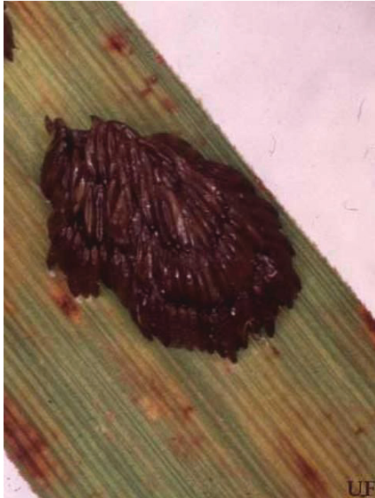
Figure 2. Deer fly, Chrysops sp., egg mass after darkening.

the development of larvae. The female will not deposit egg masses on vegetation that is too dense. Eggs are initially a creamy white color but soon darken to gray and black. Eggs are cylindrical in shape and measure from 1 to 2.5 mm ( \sim\frac{1}{32} to \frac{1}{8} in) in length. Eggs hatch in five to seven days, depending upon ambient weather conditions, and the larvae fall to the moist soil and water below.