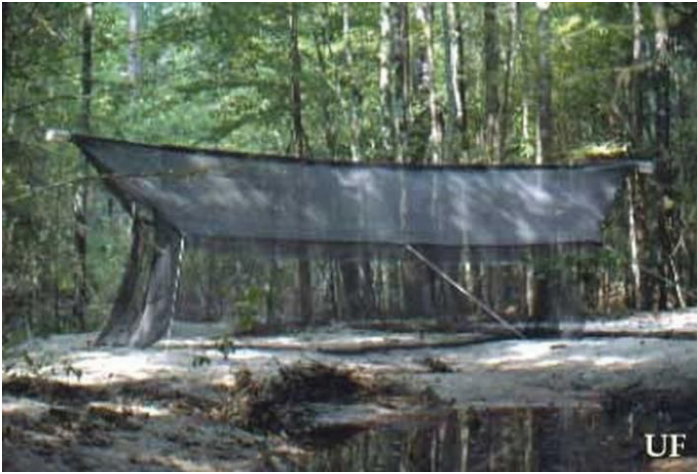
Figure 11. Malaise traps can catch large numbers of biting flies by simply being in their flight paths or by the use of attractants, such as CO 2 and octenol.