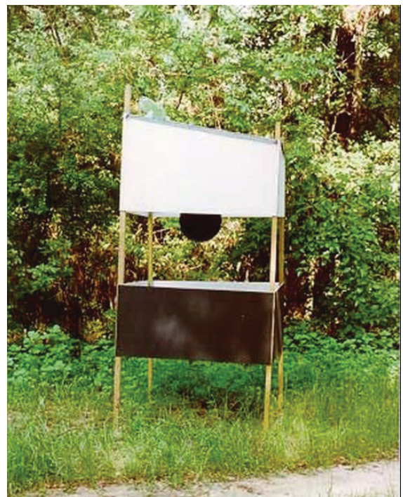
Figure 10. Attractant trap, with black sphere, used to lure biting flies.