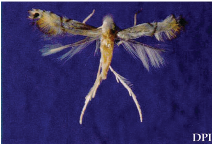
Figure 2. Pinned adult citrus leafminer, Phyllocnistis citrella Stainton, (4mm wingspread).

Adults of the CLM (Figure 2) are minute moths with a 4 mm wingspread. They have white and silvery iridescent scales on the forewings, with several black and tan markings, plus a black spot on each wingtip. The hind wings and body are white, with long fringe scales extending from the hindwing margins. In resting pose with wings folded, the moth is much smaller in appearance (about 2.4 mm). The head is very smooth-scaled and white, and the haustellum has no basal scales. CLM is most easily detected by its meandering serpentine larval mine, usually on the ventral side of the leaf. Larvae are minute (up to 3 mm), translucent greenish-yellow, and located inside the leaf mine. The pupa characteristically is in a pupal cell at the leaf margin. Adults generally are too minute to be easily noticed and are active diurnally and in the evenings.