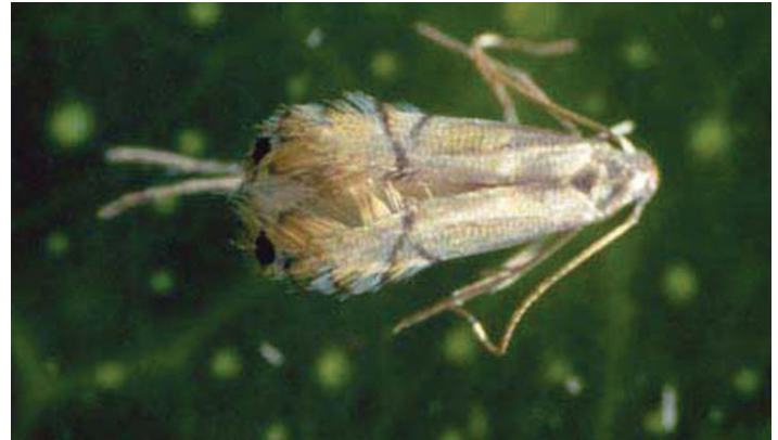
Figure 1. Adult citrus leafminer, Phyllocnistis citrella Stainton. Credits: Lyle J. Buss, UF/IFAS.

Australia before 1940, and by 1995 had spread across the continent (Beattie and Hardy 2004). CLM also occurs in South Africa and in parts of West Africa (CAB, personal communication).