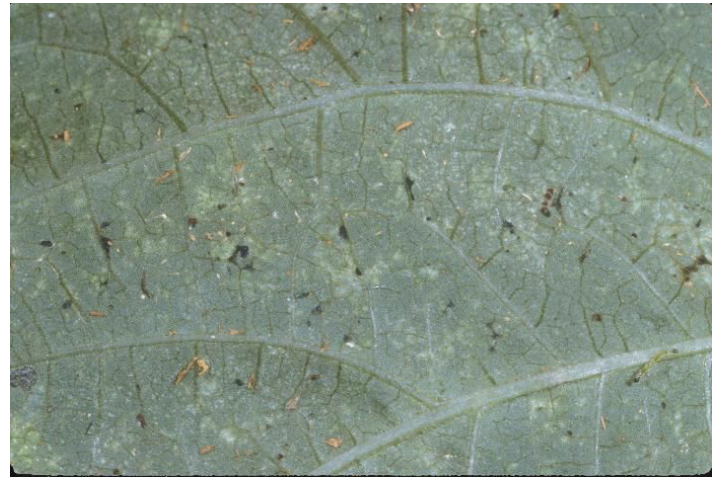
Figure 7. Fecal spots from the garden fleahopper, Microtechnites bractatus (Say), on underside of leaf.

This fleahopper has a broad host range, but leguminous crops are most frequently damaged. Vegetable crops that host garden fleahopper include bean, beet, cabbage, celery, cowpea, cucumber, eggplant, lettuce, pea, pepper, potato, pumpkin, squash, sweet potato, and tomato. Field crops injured include alfalfa, clover, and sweet clover. Ornamental plants, especially annual and perennial flowering crops such as chrysanthemum, daisy, marigold, and salvia, can be damaged. Some of the common weeds that support garden fleahopper are beggartick, Bidens sp.; bindweed, Convolvulus spp.; burdock, Arctium minus ; mallow, Malva spp.; pigweed, Amaranthus spp.; plantain, Plantago spp.; ragweed, Ambrosia spp.; smartweed, Polygonum spp.; prickly lettuce, Lactuca serriola ; thistle, Carduus spp.; and wood sorrel, Oxalis stricta . Occasionally it will feed on other insects.