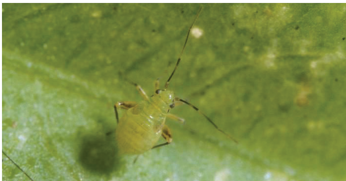
Figure 3. Nymph of garden fleahopper, Microtechnites bractatus (Say).

The nymphs are green in color. Initially they are pale green, but by the fifth (final) instar they are dark green. First and second instars are difficult to distinguish, differing principally in size. In the third instar, however, a black dot is present on the sides of the prothoracic segment; the black spots persist through the remaining nymphal stages. In the fourth instar, wing pads are apparent, and extend back over the first abdominal segment. During the last instar, the wing pads extend over about half of the abdominal segments. In females which are brachypterous (short-winged) as adults, the wing pads in the fifth instar tend to be slightly less than one-half the length of the abdomen. In males, or females which will be macropterous (long-winged) as adults, the wing pads in the fifth instar tend to be slightly longer than one-half the length of the abdomen. The mean duration of each instar is about 8.3, 9.9, 7.8, 5.8, and 7.2 days, respectively. Body length of each instar is about 0.7, 0.8, 1.0, 1.2, and 2.0 mm ( < \frac{1}{32} , < \frac{1}{32} , \frac{1}{32} , \frac{1}{32} , and \frac{1}{16} in), respectively.