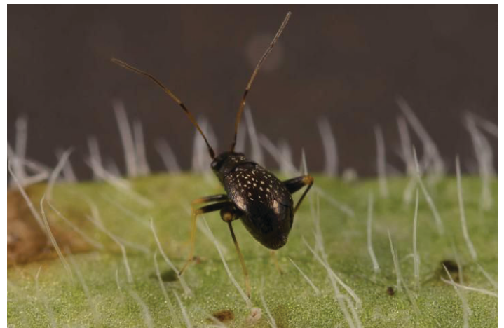
Figure 4. Brachypterous (short-winged) adult female garden fleahopper, Microtechnites bractatus (Say).

The adults are shiny black in color, with some yellow on the antennae and legs. Garden fleahopper adults occur in three forms: brachypterous (short-winged) females (Figure 4), macropterous (long-winged) females, and macropterous males (Figure 5). The males are thin, measuring about 1.9 to 2.1 mm ( \frac{1}{16} in) in length and 0.7 mm ( < \frac{1}{32} in) in width. The females are more robust, the brachypterous form measuring about 1.6 mm ( \frac{1}{16} in) in length and the macropterous form measuring about 2.2 mm ( \frac{1}{16} in) in length, with both forms about 1.0 mm ( \frac{1}{32} in) in width. Females generally are brachypterous. The adults have greatly expanded hind femora and hop when disturbed. Thus, in both behavior and form (especially the brachypterous females) the fleahoppers resemble flea beetles. The long antennae of fleahoppers exceed the length of the body; this helps to distinguish fleahoppers from flea beetles, which have antennae less than half the length of the body. Fleahoppers and flea beetles also differ in their mouthpart configuration, having piercing-sucking and chewing mouthparts, respectively.