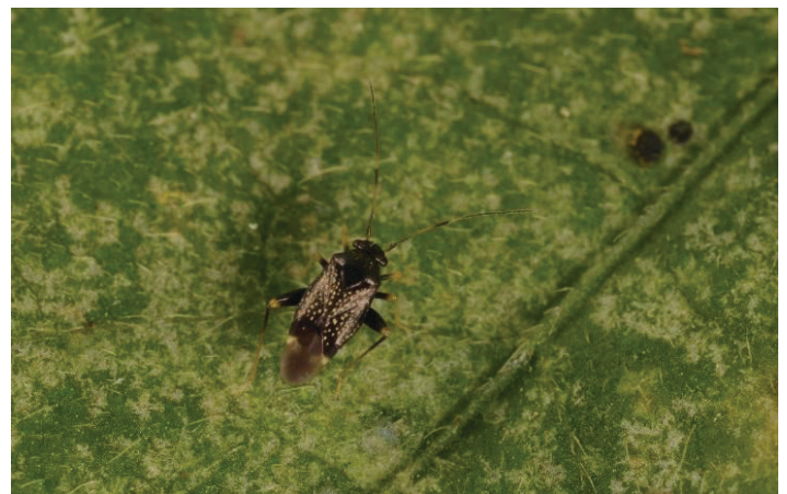
Figure 5. Macropterous (long-winged) adult male garden fleahopper, Microtechnites bractatus (Say).