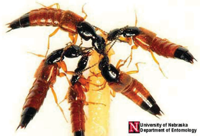
Figure 2. Rove beetles attacking a house fly maggot.

as pests; but although contact with Paederus may cause dermatitis on human skin, the toxin pederin may be harnessed for its therapeutic effects, and some Paederus species are valuable predators of crop pests. Finally, Staphylinidae form a substantial part of the world's biodiversity.