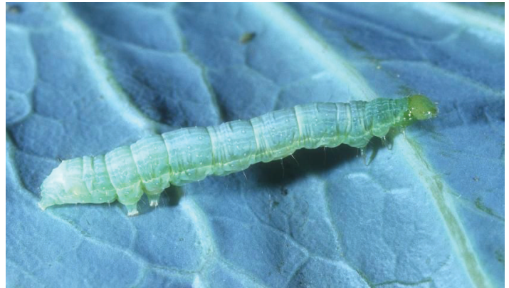
Figure 2. Early instar larva of the cabbage looper, Trichoplusia ni (Hübner).