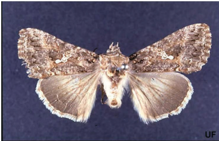
Figure 6. Adult cabbage looper, Trichoplusia ni (Hübner).

During the adult stage, which averages 10 to 12 days, 300 to 600 eggs are produced by females (Shorey 1963). Moths are considered to be seminocturnal because feeding and oviposition sometimes occurs about dusk. They may become active on cloudy days or during cool weather but are even more active during the nighttime hours. They oviposit readily at temperatures as low as 15.6°C (60.1°F), but flight activity is higher on warmer evenings.