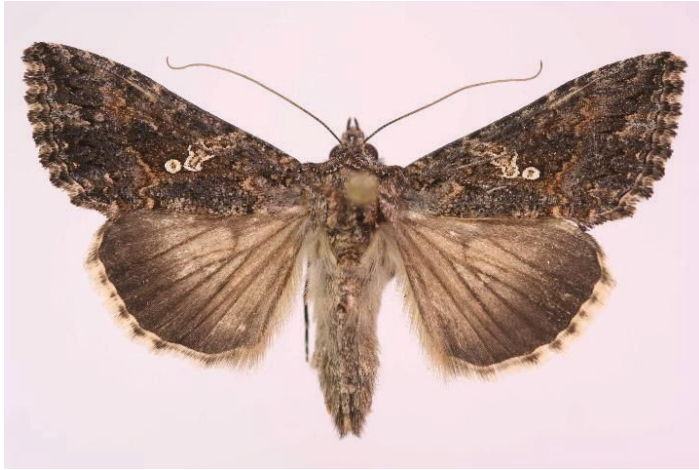
Figure 5. Adult cabbage looper, Trichoplusia ni (Hübner).

The forewings of the cabbage looper moth are mottled gray-brown in color; the hind wings are light brown at the base, with the distal portions dark brown. The forewing bears silvery white spots centrally: a U-shaped mark and a circle or dot that are often connected. The forewing spots, although slightly variable, serve to distinguish cabbage looper from most other crop-feeding noctuid moths. The moths have a wingspan of 33 to 38 mm (1 ⅓–1 ½ in).