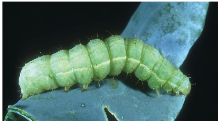
Figure 3. Mature larva of the cabbage looper, Trichoplusia ni (Hübner).