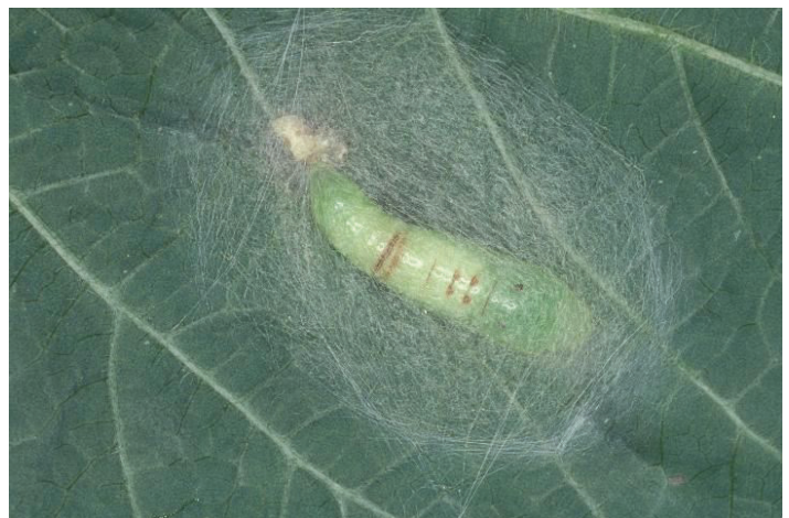
Figure 4. New pupa of the cabbage looper, Trichoplusia ni (Hübner).

At pupation, a white, thin, fragile cocoon is formed on the underside of foliage, in plant debris, or among clods of soil. The pupa contained within is initially green, but soon turns dark brown or black. The pupa measures about 2 cm ( \frac{3}{4} in) in length. Duration of the pupal stage is about four, six, and 13 days at 32°C, 27°C, and 20°C (89.6°F, 80.6°F, and 68°F), respectively.