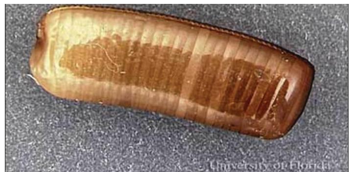
Figure 8. Egg case (ootheca) of the Asian cockroach, Blattella asahinai Mizukubo.