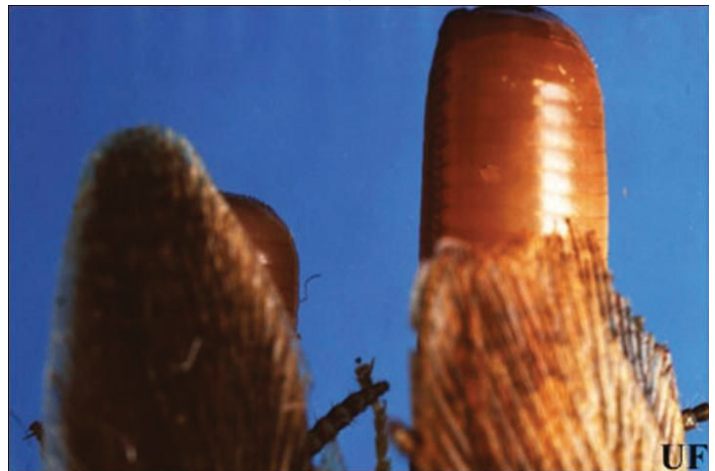
Figure 4. The ootheca of a female Asian cockroach (left), Blattella asahinai Mizukubo, does not extrude as far beyond the adult's wings as the ootheca of a female German cockroach (right), Blattella germanica (Linnaeus).