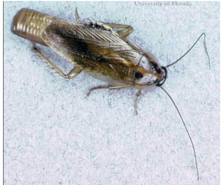
Figure 1. Adult female Asian cockroach, Blattella asahinai Mizukubo, carrying an egg case (ootheca).

The Asian cockroach was first described in 1981 from insects collected on Okinawa Island, Japan. Blattella asahinai was most likely introduced into the United States through imports from Japan. Since the first identification of Blattella asahinai in Lakeland (Polk County), it has spread through much of Florida and is reported in Alabama, Georgia, South Carolina, Louisiana, Mississippi, and Texas, and is likely present in Mississippi too.