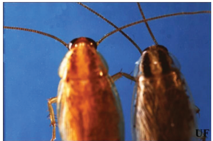
Figure 7. Adult male German (left), Blattella germanica (Linnaeus), Asian (right), Blattella asahinai Mizukubo, cockroaches, dorsal view. The pronotal stripes of the Asian cockroach are darker and more defined compared to the stripes on the German cockroach.