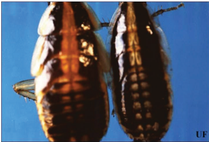
Figure 6. Late instar German (left), Blattella germanica (Linnaeus), and Asian (right), Blattella asahinai Mizukubo, cockroaches, dorsal view. Spots along the midsection of the Asian cockroach appear white, while those areas are lightly pigmented in the German cockroach. Asian cockroach nymphs are also smaller than German cockroach nymphs.