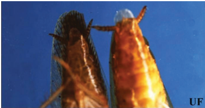
Figure 2. Adult male Asian (left), Blattella asahinai Mizukubo, and German (right), Blattella germanica (Linnaeus), cockroaches, ventral view. Notice the wings of the Asian cockroach extend past the tip of the abdomen.

Asian cockroaches are almost identical to German cockroaches . Chemical analysis by gas chromatography will confirm the species. However, there are also slight morphological differences between Blattella asahinai and Blattella germanica . Asian cockroach adults have longer and narrower wings than those of German cockroaches.