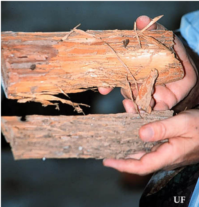
Figure 11. Heterotermes subterranean termite damage showing dry and shredded appearance of wood, Miami, Florida.