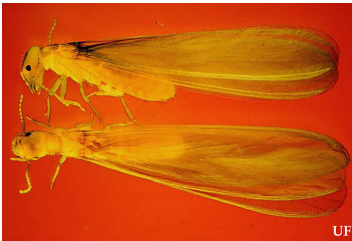
Figure 5. Heterotermes subterranean termite alates in lateral (top) and dorsal views.