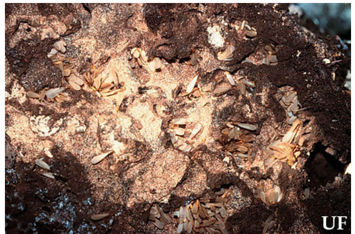
Figure 8. Heterotermes subterranean termite alates congregating beneath a rock before swarm.

Like Reticulitermes , damage resulting from a Heterotermes infestation can become severe if left untreated. Subtle differences in foraging behavior and biology, however, do exist. Heterotermes seems to be better adapted to dry environments than Reticulitermes . Heterotermes often forage into wood members that are distant from moisture sources and workers transport little or no free water to feeding sites. Even driftwood lying on dry, hot, and sandy beaches is prone to attack by Heterotermes . Dispersal flights, foraging tubes, or damage (often shredded and dry in appearance) are usually the first indications of an infestation. Heterotermes foraging tubes are lighter in color, narrower, and more circular in cross-section than those of Reticulitermes or Coptotermes . Like their foraging tubes, the accumulation of fecal spotting on the surface of Heterotermes -infested wood is also a beige or cream color. In structural infestations, Heterotermes will sometimes openly build very narrow free-hanging tubes from ceilings, shelves, and overhangs.