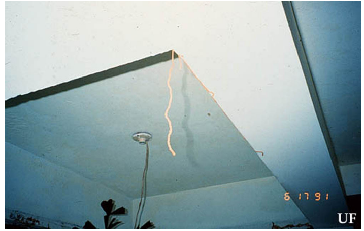
Figure 12. Heterotermes subterranean termite foraging tube dropping from living room ceiling, Santo Domingo, Dominican Republic.

Infestations of Heterotermes in Miami are infrequent at this time. Having demonstrated successful establishment in Florida suggests that this pest will become more widespread over time. Due to climatic restrictions, the future distribution of Heterotermes in the eastern United States will not likely extend far beyond southern Florida.