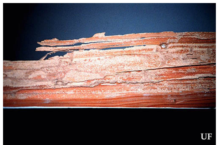
Figure 9. Damage and fecal spotting by Heterotermes subterranean termites to wood molding, Miami, Florida.