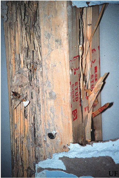
Figure 10. Damage and fecal spotting by Heterotermes subterranean termites in dry framing, Miami, Florida.