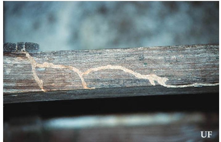
Figure 13. Heterotermes subterranean termite foraging tube on a sheltered bench, Cat Island, Bahamas.