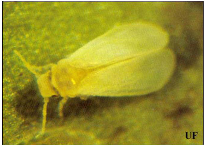
Figure 4. Adult of the bayberry whitefly, Parabemisia myricae (Kuwana).

The adult is a small whitish-yellow moth-like insect that flits about when disturbed. The adults have a strong ovipositional preference for very young foliage in the "feather" stage (Walker & Aitken 1985). The adult will frequently place eggs along the leaf margin. At first, the eggs are white, but turn black in a few days.