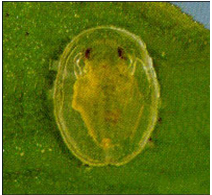
Figure 3. Nymph of the bayberry whitefly, Parabemisia myricae (Kuwana).

The adult is a small whitish-yellow moth-like insect that flits about when disturbed. The adults have a strong ovipositional preference for very young foliage in the "feather" stage (Walker & Aitken 1985). The adult will frequently place eggs along the leaf margin. At first, the eggs are white, but turn black in a few days.