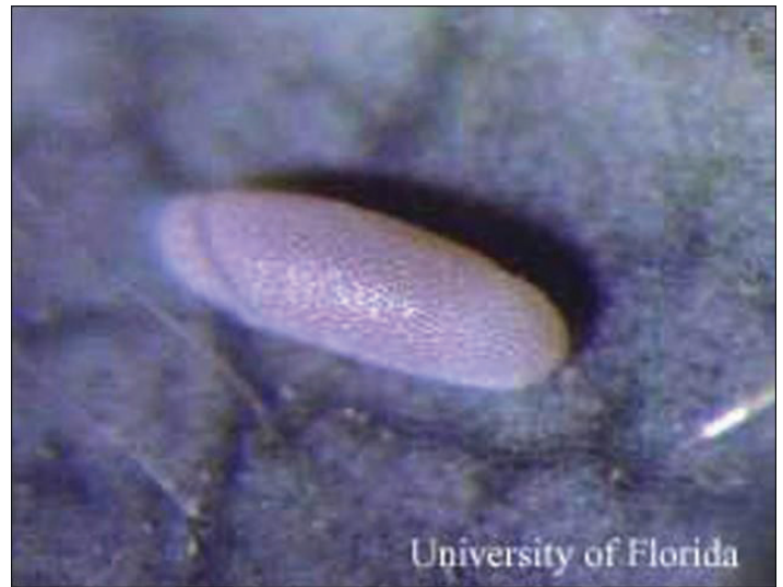
Figure 3. Egg shell of an emerged hover fly, Allograpta obliqua (Say).