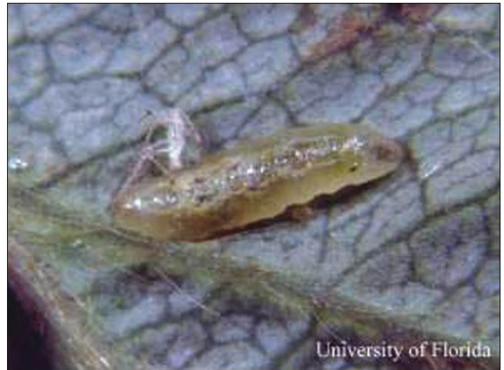
Figure 4. Larva of Allograpta obliqua (Say), a hover fly.