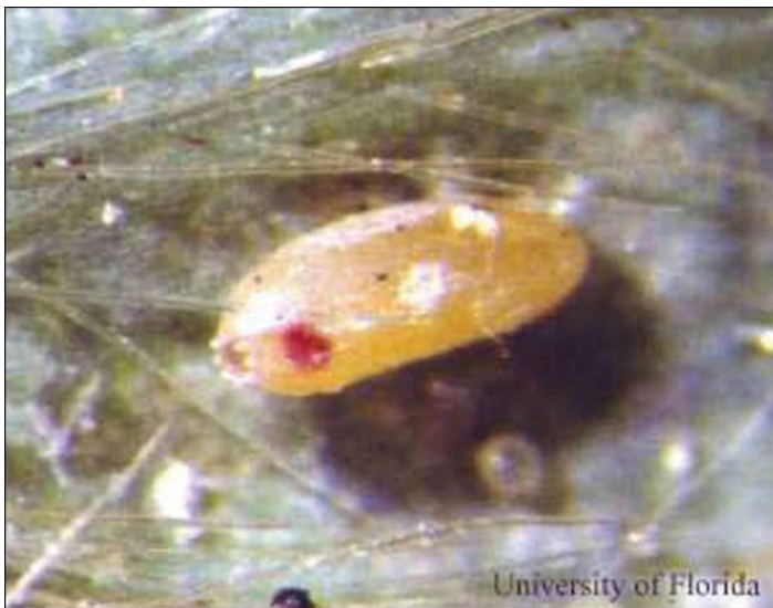
Figure 2. Egg of Allograpta obliqua (Say), a hover fly.

Larvae of Allograpta obliqua are almost indistinguishable from those of A. exotica (Wiedemann), which occur uncommonly in Florida. The puparium is green; the two whitish larval stripes apparent for a day or two. As the true pupa inside takes on the black and yellow color of the adult, the color of the puparium changes until all of the green disappears. The puparium averages 5.25 mm (0.21 in) long, 2.5 mm (0.1 in) wide, and 2.3 mm (0.1 in) high. Posterior elevation is very gradual. The adult is 6 to 7 mm (~0.2 to 0.3 in) long. This species may be recognized by the generic characters—yellow thoracic stripes and abdominal cross-bands; on the fourth and fifth segments, four longitudinal, oblique, yellow stripes or spots; and yellow face lacking a complete median stripe. Eyes of the male are holoptic; those of the female dichoptic.