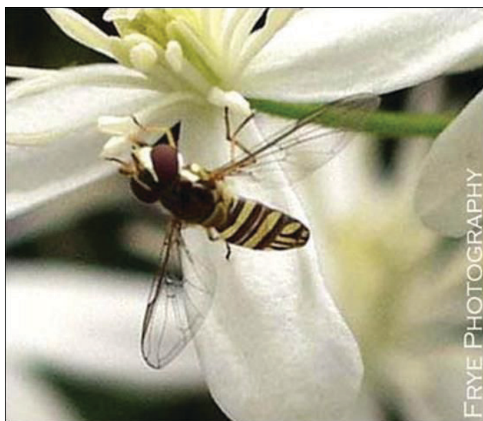
Figure 1. An adult female hover fly, Allograpta obliqua (Say).