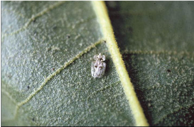
Figure 2. Closeup of adult sycamore lace bug, Corythucha ciliata (Say).

The sycamore lace bug is the only lace bug listed as feeding on P. occidentalis according to the world host list for lace bugs (Drake and Ruhoff 1965). Adults are whitish in color and about 3 mm in length. For practical purposes, the association with the host plant should be diagnostic for this species.