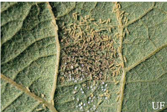
Figure 4. Larvae of the grapeleaf skeletonizer, Harrisina americana (Guérin-Ménéville), hatching from an egg cluster on a grape leaf.

A common species in Florida most likely to be confused with the grapeleaf skeletonizer is the ctenuchid Cisseps