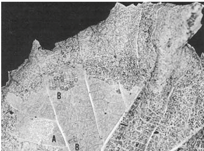
Figure 5. Underside of 'Lake Emerald' grape leaf, showing considerable damage by young larvae of the grapeleaf skeletonizer, Harrisina americana (Guérin-Ménéville). (A) = remains of egg mass, (B) = young larvae.