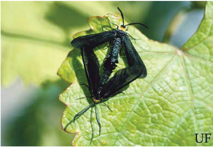
Figure 2. Adult grapeleaf skeletonizers, Harrisina americana (Guérin-Ménéville), mating.