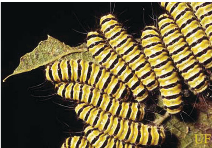
Figure 3. Larvae of the grapeleaf skeletonizer, Harrisina americana (Guérin-Ménéville), feeding on a grape leaf.