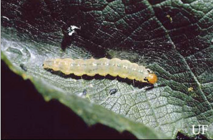
Figure 1. Larva of the grape leaffolder, Desmia funeralis (Hübner).

sexes have various amounts of white on the fringes of the wings and parts of the head, body, and legs. The antennae in the male appear thickened and notched near the middle, while in the female they are uniform and threadlike. Adults of other species of Desmia and certain other similar species in Florida have the white spots of the wings much more linear or are obviously different in number of spots or some other characteristic.