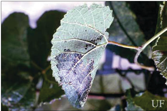
Figure 3. Damage to bunch grape foliage caused by the grape leaffolder, Desmia funeralis (Hübner).

Injury to the leaves is very characteristic and may be easily recognized. As soon as a larva is large enough it folds the leaf, exposing the under surface; the edge is held in place by bands of silk thread. It is within the protection of this fold that the larva feeds, skeletonizing the leaf of the upper surface. When the larvae are numerous, the injury to the vine becomes conspicuous, even at a considerable distance, because the light color of the under surface of the folded leaves contrasts boldly with the dark green of the upper side normally presented, thus giving the vine a patchy appearance. Larvae roll muscadine leaves, which are thinner than bunch grape leaves.