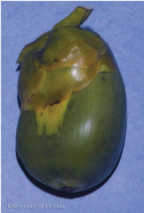
Figure 6. Early damage to a young coconut by Aceria guerreronis Keifer, a coconut mite.

beneath the perianth, eventually covering a large portion of the surface. Older damaged tissue is suberized (cork-like), with deep longitudinal fissures that may be intersected by horizontal cracks.