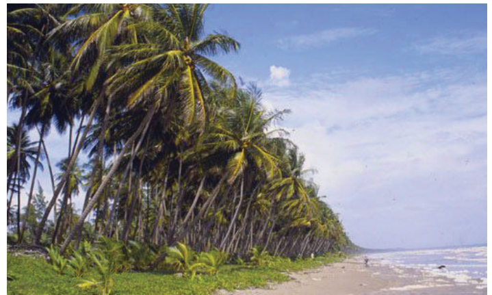
Figure 5. Coconut palms, Cocos nucifera L., on the beach at Manzanilla Bay, Trinidad.

Copra, a major product of the coconut industry, is the white kernel, or coconut “meat,” after it is dried. In one study, coconut mite damage was found to cause a loss of up to 30% of the copra. Other researchers have reported a less serious impact on copra production. In many tropical countries, coconut water is a principal product. Coconut water is the clear liquid in the coconut and is sometimes erroneously called coconut milk (which is actually the paste made by grinding the kernel). In Puerto Rico about 10 million fresh coconuts are sold each year for coconut water. Data is not available on the possible impact of the coconut mite on the production of coconut water, but where this product is served in fresh coconuts, the unappealing appearance of mite-damaged coconuts adversely affects sales. A favorite motif in advertising tourist destinations in Florida and other tropical locales is a view of a beach with gracefully swaying coconut palms stretching towards the sea. Coconut palms are present in the designed landscapes of resort areas in these regions and are treasured by many homeowners. Damage by coconut mite is not noticeable from a distance and does not affect the aesthetic appearance of palms. As a pest of ornamental plants, coconut mite is most important to homeowners or managers of areas where palms are seen up close, such as in the landscaping around hotel swimming pools.