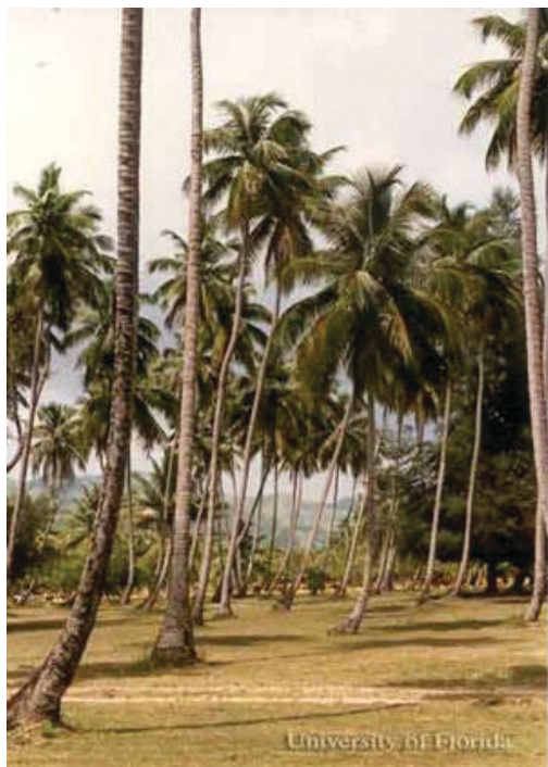
Figure 8. Coconut palms, Cocos nucifera L. of the 'Jamaica Tall' variety, at Tres Hermanos Beach, near Añasco, Puerto Rico. The coconuts are periodically pruned from palms at this resort area.

Field observations have indicated that in some situations there is an inverse relationship between water availability and damage levels of coconut mite. Other observations indicate that increased nutrient availability results in faster growth of coconuts so that they incur less coconut mite damage or tolerate it better. However, in other studies, increased nutrients seemed to increase the level of mite attack. More research is needed to determine an economically feasible cultural control of the coconut mite.