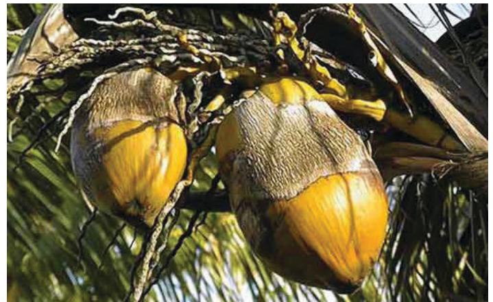
Figure 3. Coconuts with damage by coconut mite, Aceria guerreronis Keifer.