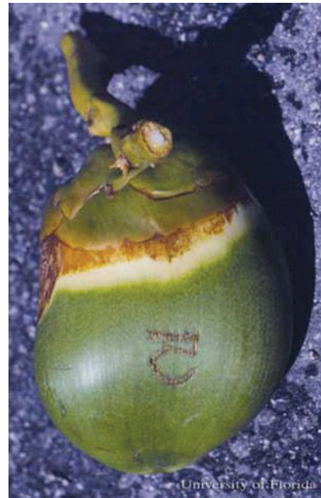
Figure 7. Early damage in a broader area to a young coconut by Aceria guerreronis Keifer, a coconut mite

Young coconuts are green, yellow, bronze, light orange, or a blend of these colors, depending on variety. Mature coconut fruits are brown. Thus, the dark brown color of advanced coconut mite damage is most noticeable before the fruit has fully matured. Coconut mite damage can be spotted at a distance, but the diagnosis must be confirmed by closer examination. Browning of coconuts can be caused by factors other than coconut mites, including various forms of mechanical damage. For example, a petiole constantly rubbing against a coconut in the wind can cause browning over the affected area of the surface. A smooth brown surface may be the result of recent damage due to cold. In Florida and Puerto Rico, a second mite, Tarsonemus sp. (Acari: Tarsonemidae), causes damage similar in appearance to early coconut mite damage, but is rare. This mite occurs in populations of not more than a few hundred individuals per coconut and has been seen only on young coconuts. In a Florida study of coconuts with damage attributable to mites feeding beneath the perianth, 99% were found to be infested with coconut mite, and only 1% with Tarsonemus sp.