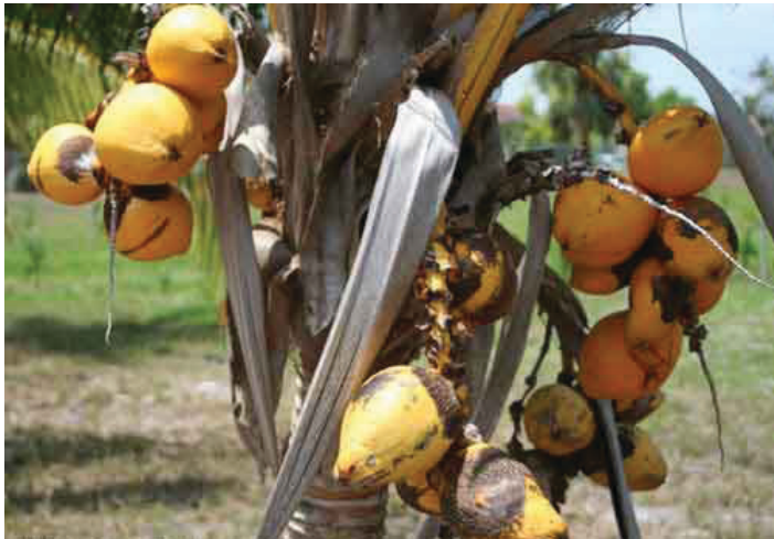
Figure 4. A ‘Red Spicata Dwarf’ coconut palm, Cocos nucifera L., with damage from Aceria guerreronis Keifer, a coconut mite.

Coconut palm varieties differ in their susceptibility to coconut mite. Almost all varieties probably have some level of susceptibility.